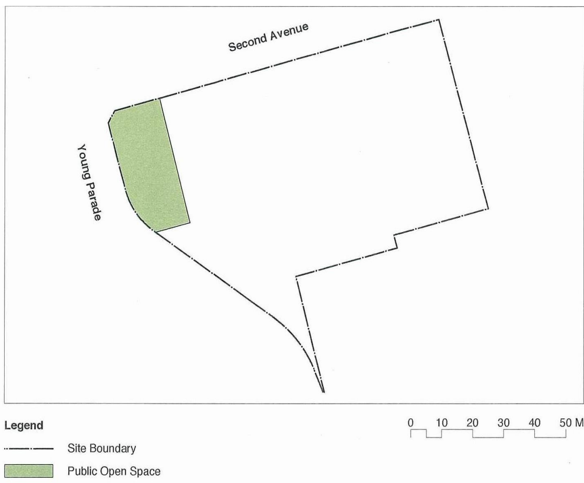
Figure 6.3.4 Location of Privately owned Publicly Accessible Open Space