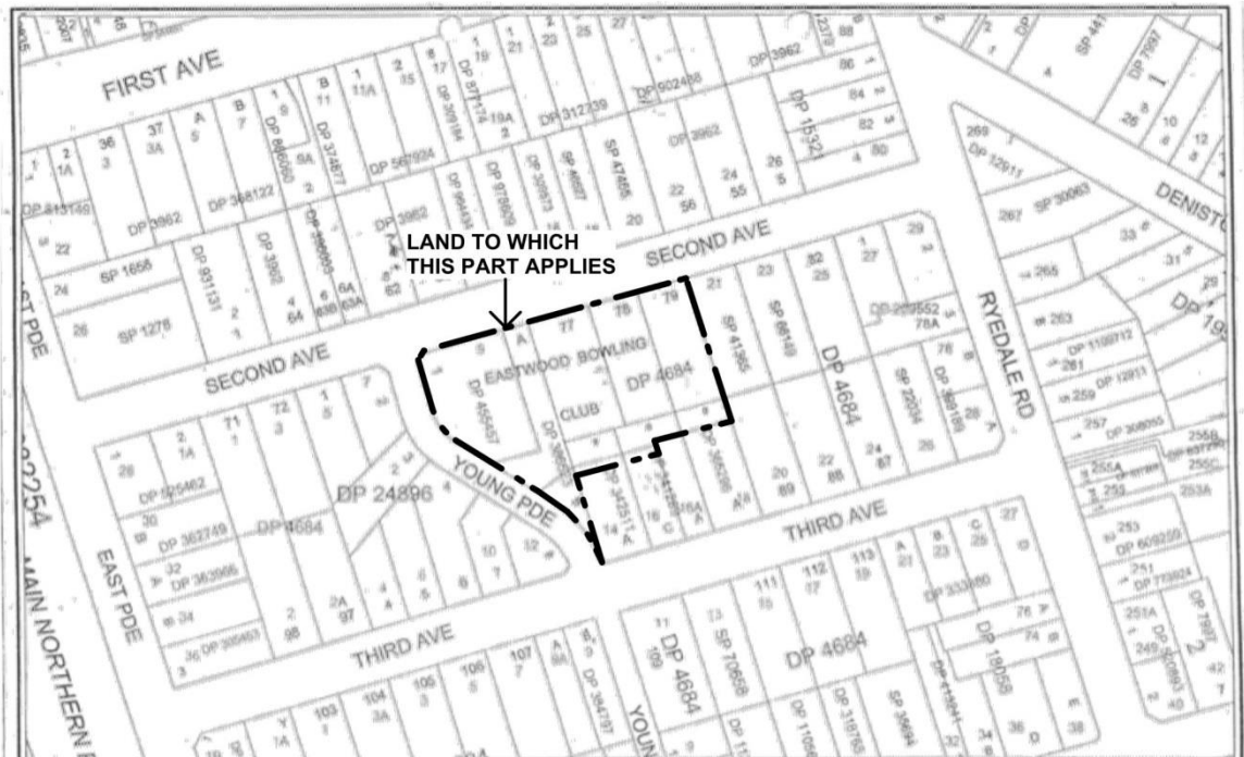
Figure 6.3.1 Land to which this Part Applies

The land to which this Part applies is shown on Figure 6.3.1.