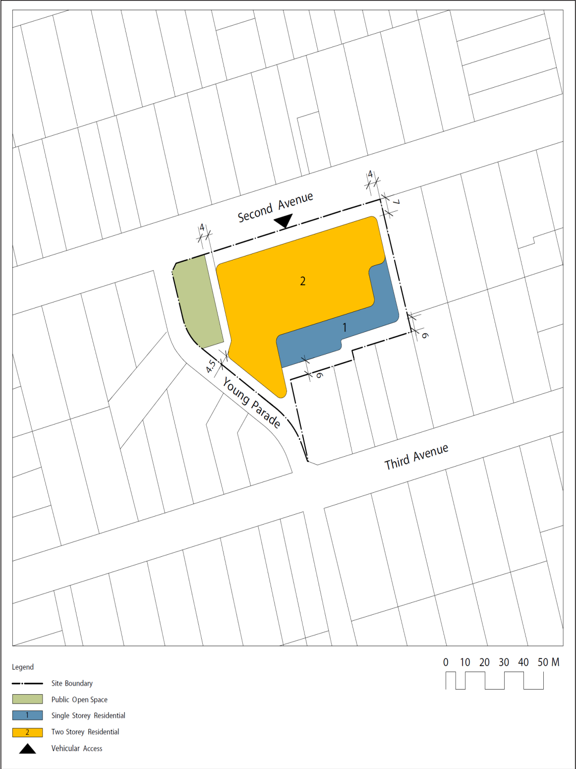
Figure 6.3.3 Building Form Plan