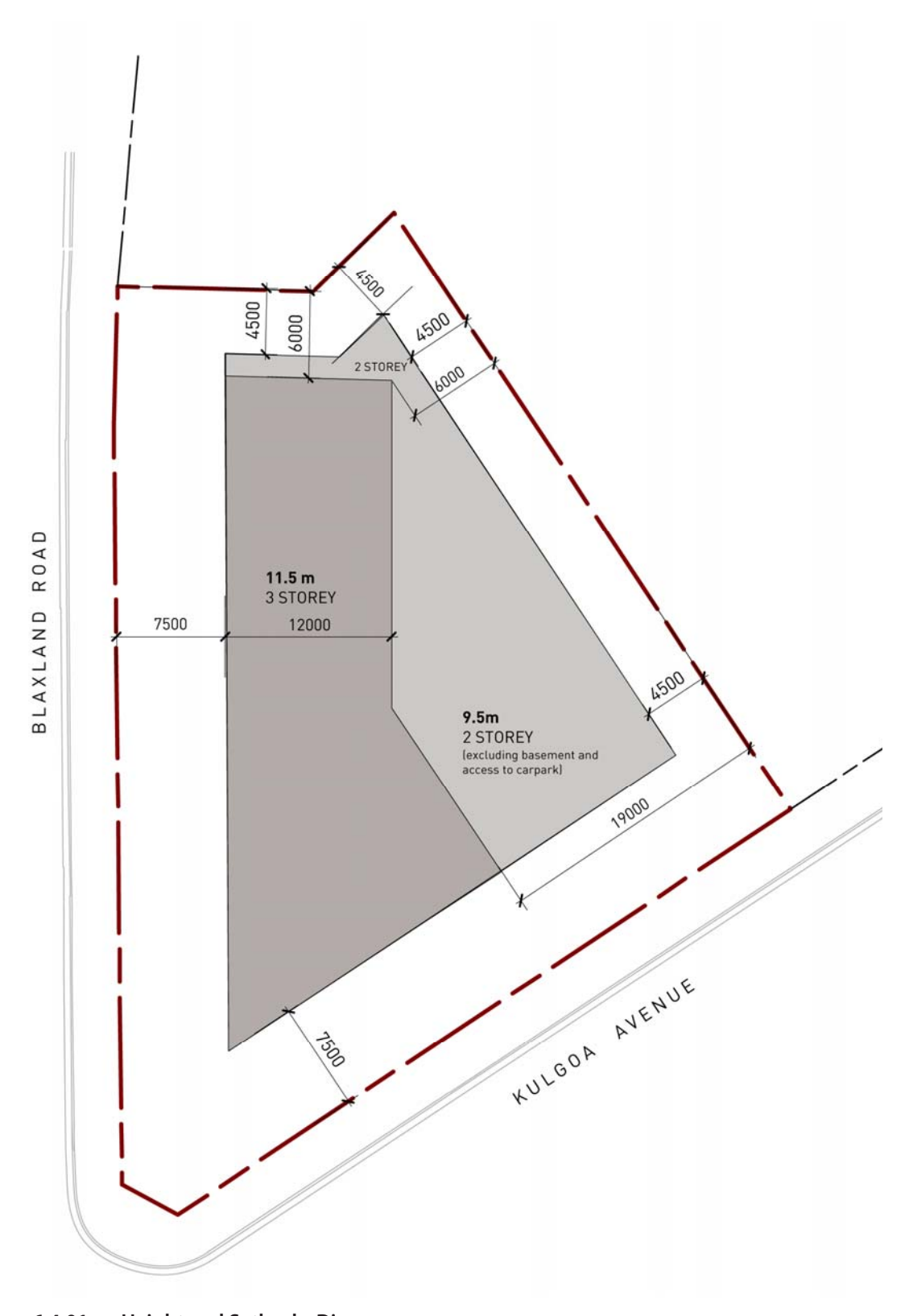
Figure 6.4.01 Height and Setbacks Diagram