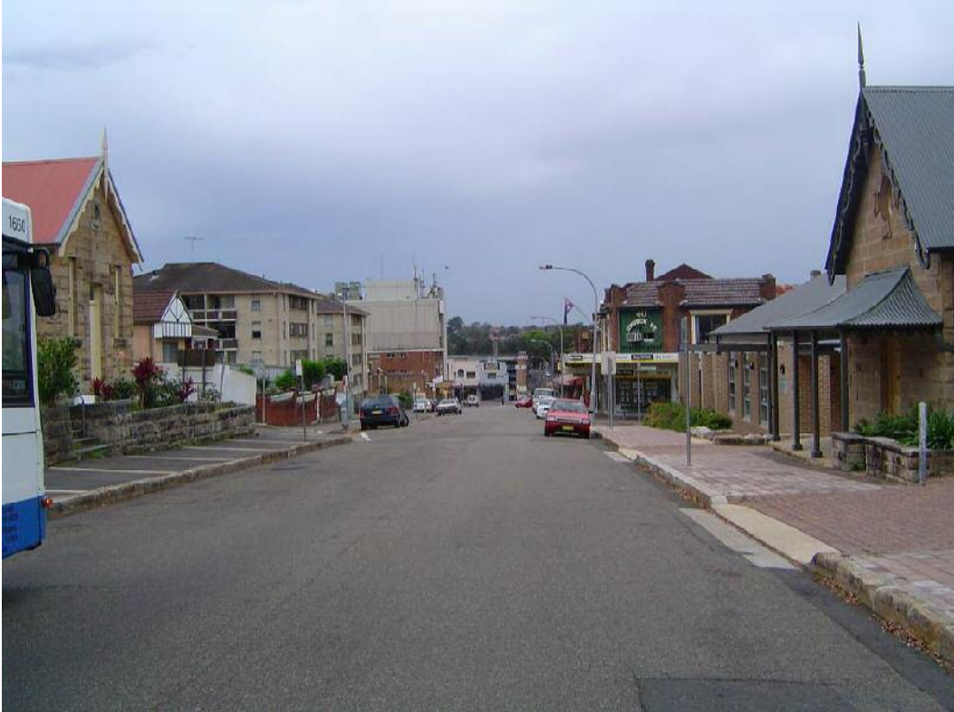
Figure 7: The site looking east from Church Street showing other heritage items in the wider vicinity not directly affected by the current proposal.