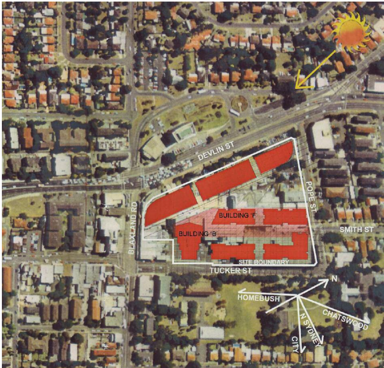
Figure 2: Aerial photograph showing the site of the proposed Top Ryde Shopping Centre Redevelopment.

The current proposal generally involves the construction of two multi-storey residential buildings -Building 'B' to accommodate 106 residential units and Building 'F' to accommodate 79 residential units; with the provision of on-site car parking on levels 3 & 4; and communal open spaces (residential podium) on level 5.