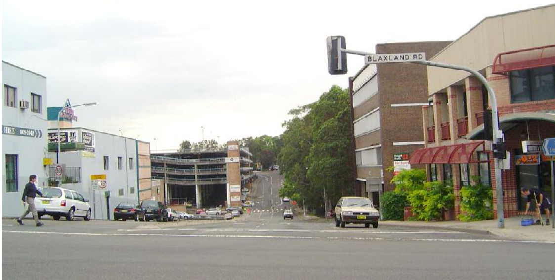
Figure 5: The subject site as viewed from the intersection of Blaxland Street and Tucker Street. Blackland Road streetscape is generally characterised by two-storey retail and commercial development, mainly dating from the early twentieth century.