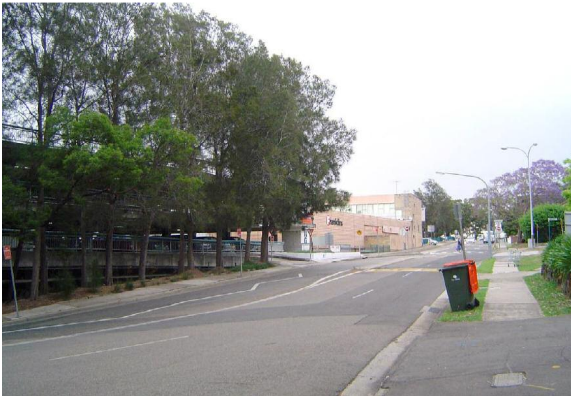
Figure 6: Pope Street looking towards Devlin Street. The site to the left. NBR&P 2007