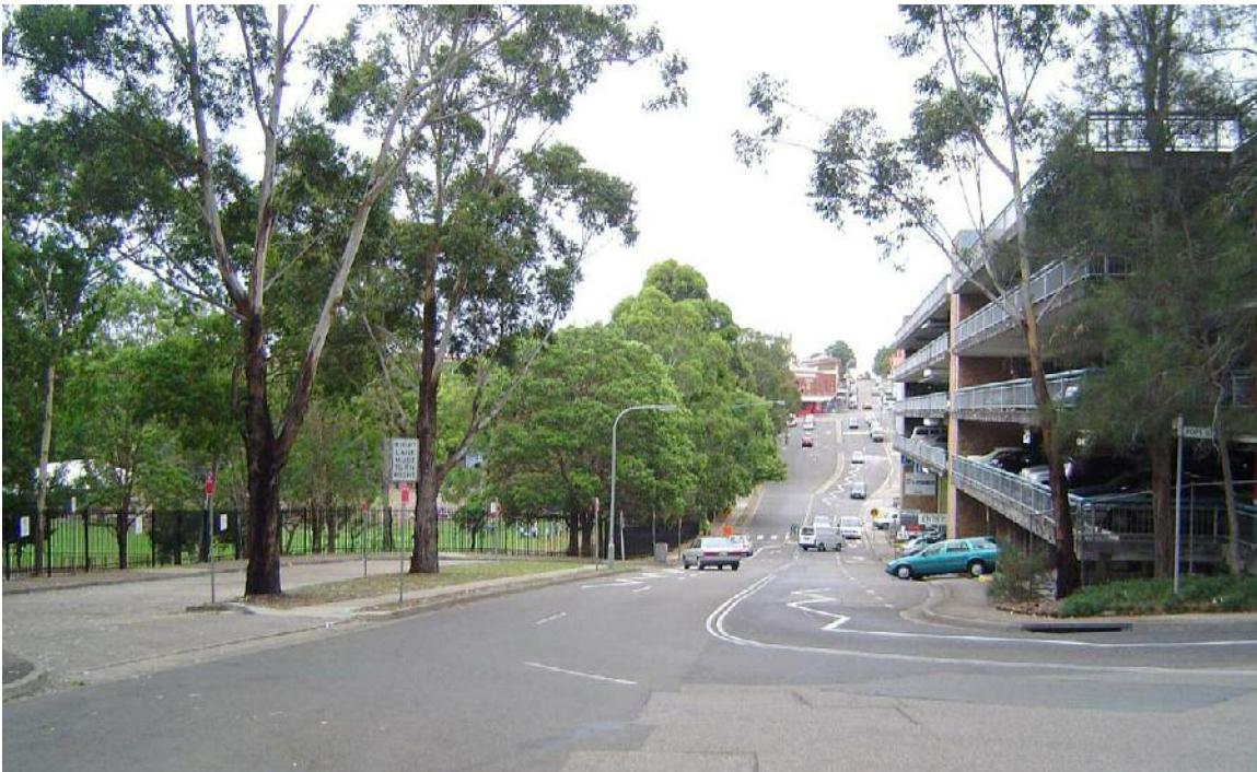
Figure 4: Existing screening to Ryde Public School on the eastern side of Tucker Street. The Top Ryde Redevelopment site to the right.