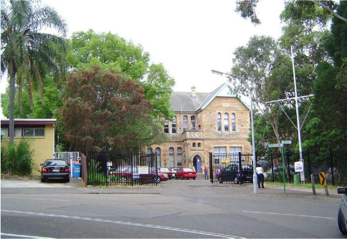
Figure 3: Ryde Public School as viewed from the site.