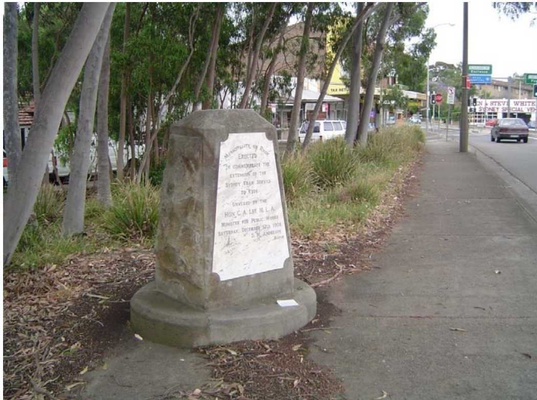
Figure 3: The obelisk in Devlin Street. Not in original location

The location of the Obelisk is not of heritage significance as it not in its original location and may be relocated with the redevelopment of the Civic Centre. The development proposal for Commercial Buildings A & B will have no impact on the Obelisk.