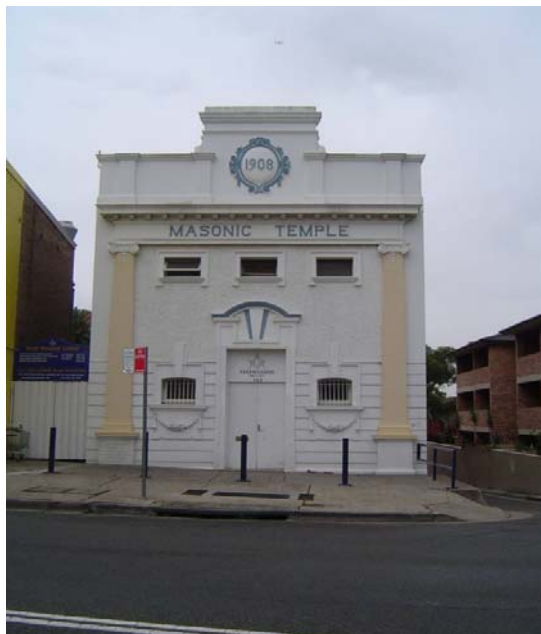
Figure 2: The Masonic Temple Hall 142 Blaxland Road, Ryde

The Masonic Temple Hall at 142 Blaxland Road is located to the west of the development site. It is significant as both a local landmark and a social focus of the community. It is a simple two storey Federation Hall built close to the street alignment on the corner of Blaxland Road and a laneway. The building is symmetrical and constructed of brickwork with a gable roof which is concealed behind a parapet. There is a smaller lean to section at the rear. The side walls are unpainted brickwork divided into bays by brick buttresses. The street facade is rendered and features classical motifs. The facade features a pair of tapered pilasters supporting an entablature bearing the words Masonic Temple . The interior is simple and features a curved plaster ceiling, turned timber balustrading, painted brickwork, timber boarded ceilings and painted joinery typical of the period.