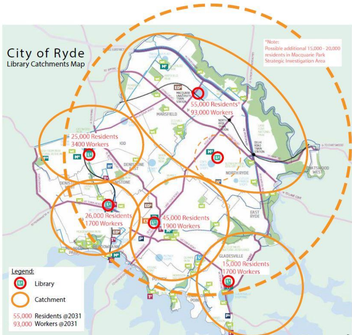
Figure 3 – Library Catchment for City of Ryde LGA

By comparison, Ryde Library (Top Ryde) is 2,031sqm, including approximately 200sqm dedicated to library administration and back of house processes. Ryde Library opened in 2011 and introduced an innovative approach to library design. The success of the library is undoubted, with average visitation of over 1,000 persons per day. On many days during peak periods this figures exceeds 1,200 persons per day. Library visitors use Ryde Library for more than just borrowing books. It is used as a place to attend a meeting or event, to undertake private study, to use technology, or simply as a safe, comfortable place to share with others. Modern public libraries are sometimes called the ‘lounge room of the city’. The ground-breaking Danish Model for Public Libraries identifies four key spaces that are integral to a public library, being spaces for: