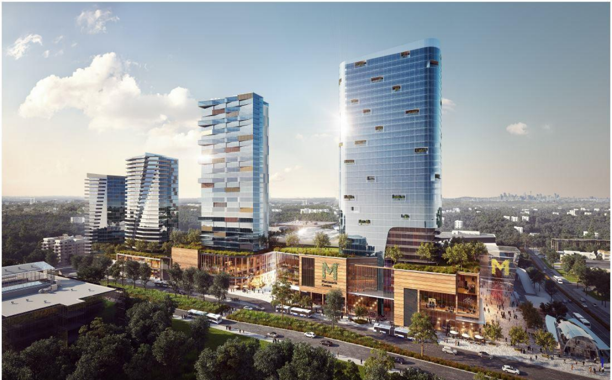
Figure 1 – Artist's Impression of Macquarie Centre Redevelopment (Herring Road frontage)

According to the Statement of Environmental Effects (SEE) submitted with LDA2015/655 the project will: