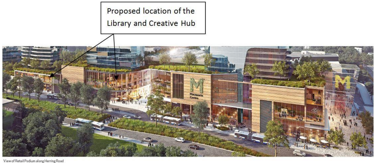
Figure 2 – Approximate location of Library and Creative Hub on Herring Road

AMP Capital have also provided a letter ( ATTACHMENT 2 ) dated 10 October 2016 outlining the scope of public benefits, including the Library and Creative Hub; The following table is an excerpt from the letter that summarises the value of the works: