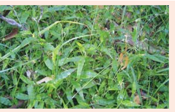
14. Australian Basket Grass Oplismenus aemulus (L von Richter)

• Ornamental, fine creeping grass with erect seed heads • Perennial with short, broad and pointed leaves • Very hardy as a native lawn • Height to 30 cm • Flowers: most of the year • Position: shade / semi-shade • Great as food/habitat for: Insects, Frogs and Lizards