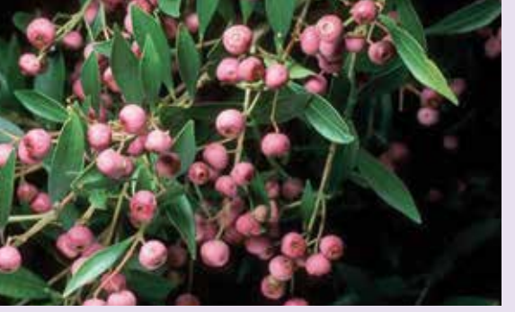
21. Lillypilly Acmena smithii (J Plaza)

• Graceful shrub with soft slender 'leaves' • Creamy ball flowers form dense clusters • Frost and drought resistant, grows in variety of soils • Height to 2 m • Flowers: December - April • Position: semi-sun / sun • Great as food/habitat for: Insects and Birds