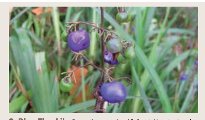
2. Blue Flax Lily Dianella caerulea (G Strid-Nwulaekwe) Beautiful strappy leaved plant tufts that speads blue/purple flower clusters and glossy berries • Height to 50 cm • Flowers: early to mid summer • Position: semishade / sun • Great as food/habitat for: Insects (eg native bees), Frogs, Lizards and Birds

• Attractive shrub or tree with glossy, dense foliage • Creamy white flowers and white-purple edible berries • Can be trimmed into dense plant when young • Great for screening, prefers rich soils and shelter • Tree can grow to 5-20 m • Flowers: in summer • Position: shade / sun Great as food/habitat for: Insects, Birds and Bats (fruits)