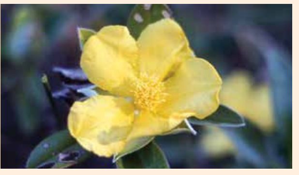
8. Climbing / Golden Guinea Flower Hibbertia scandens (TM Tame)

• Scrambling vine with dense shiny leaves • Large showy bright yellow flowers • Prefers richer soils • Flowers: spring - early summer • Position: semi-sun • Great as food/habitat for: Insects and Birds