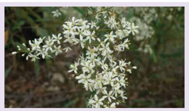
23. Blackthorn Bursaria spinosa (FLCNP) • Variable shrub or small tree with light foliage and spines • Fragrant, creamy coloured flower sprays, papery capsules • Trim to form dense bird habitat • Prefers reasonably drained rich soils • Height to 3-8 m • Flowers: mainly in summer • Position: semi-sun / sun • Great as food/habitat for: Insects (eg native bees) and Birds

Attractive common shrub with slender leaves • Showy pink spider like flowers • Small green glossy fruits • Prefers sandy soils in open situations • Height to 1-2 m • Flowers: July -November • Position: semi-sun / sun • Great as food/habitat for: Insects and Birds