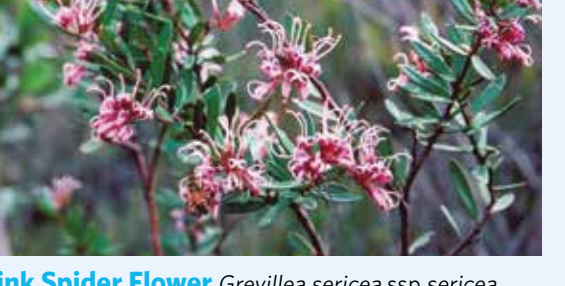
18. Pink Spider Flower Grevillea sericea ssp sericea (Tlenz)

Attractive common shrub with slender leaves • Showy pink spider like flowers • Small green glossy fruits • Prefers sandy soils in open situations • Height to 1-2 m • Flowers: July -November • Position: semi-sun / sun • Great as food/habitat for: Insects and Birds