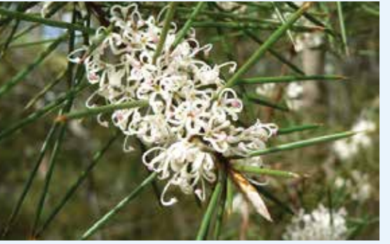
19. Bushy Needlebush Hakea sericea (FLCNP)

• Ornamental, fine creeping grass with erect seed heads • Perennial with short, broad and pointed leaves • Very hardy as a native lawn • Height to 30 cm • Flowers: most of the year • Position: shade / semi-shade • Great as food/habitat for: Insects, Frogs and Lizards