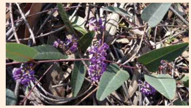
7. False Sarsaparilla, Purple Coral Pea Hardenbergia violacea (FLCNP)

• Attractive scrambling vine with narrow leaves • Pretty clusters of purple pea flowers • Great for fence screening or as groundcover • Grows on variety of soils • Flowers: mostly in spring • Position: sun • Great as food/habitat for: Insects (eg native bees) and Birds