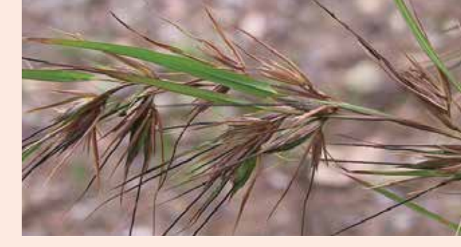
15. Kangaroo Grass Themeda australis (Eurobodalla Shire Council)

• Showy tufted grass with partly purplish flower heads • Perennial and wide spread across Australia • Drought resistant, grows in variety of soils • Height to 1 m • Flowers: summer - autumn • Position: semi-sun / sun • Great as food/ habitat for: Insects and Birds