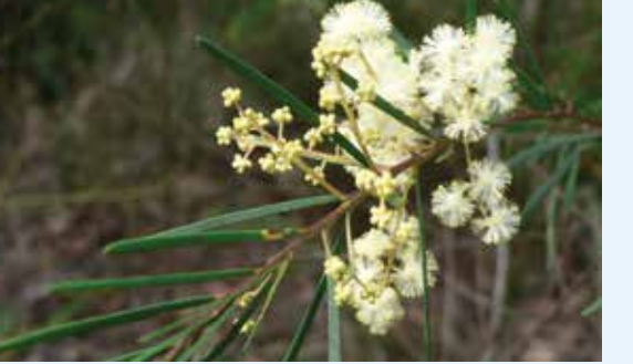
16. Flax-leafed / White Wattle Acacia linifolia (FLCNP)

• Pleasant fern with lacy soft fronds • Easy growing, fronds forming dense colonies • Height to 1.5 m • Prefers sandy moist soils • Position: semi-shade / sun • Great habitat for: Frogs and Small birds