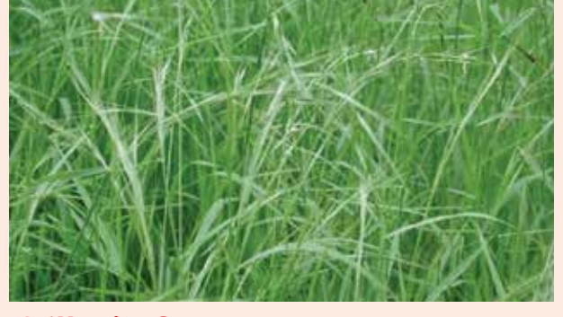
13. Weeping Grass Microlaena stipoides var stipoides (L von Richter)

• Scrambling vine with dense shiny leaves • Large showy bright yellow flowers • Prefers richer soils • Flowers: spring - early summer • Position: semi-sun • Great as food/habitat for: Insects and Birds