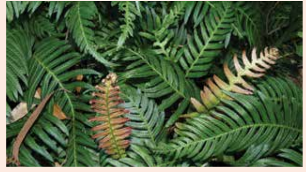
12. Prickly Rasp Fern Doodia aspera (FLCNP) • Short but colourful fern with rough fronds • Easy to grow and forms dense colonies • Prefers well drained soil • Height to 20-40 cm • Position: semi-shade • Great habitat for: Lizards and Frogs

• Attractive scrambling vine with narrow leaves • Pretty clusters of purple pea flowers • Great for fence screening or as groundcover • Grows on variety of soils • Flowers: mostly in spring • Position: sun • Great as food/habitat for: Insects (eg native bees) and Birds