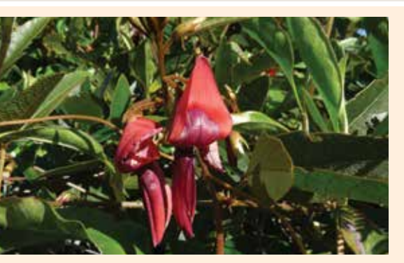
9. Dusky Coral Pea Kennedia rubicunda (FLCNP) • Robust scrambling vine in sheltered situations • Leaves 3-parted, can form dense thickets • Large, red pea flowers in clusters • Flowers: July - November • Position: semi-sun / sun • Great for as food/habitat for: Lizards, Birds and Common Ringtail Possum