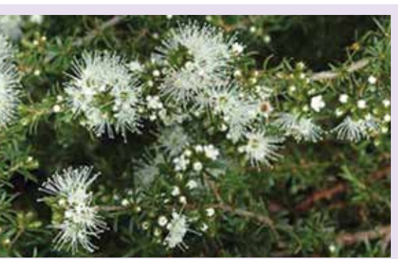
24. Tick Bush Kunzea ambigua (M Fagg)

Attractive shrub with spiky 'leaves' and woody fruits pale yellow/cream flowers with honey or almond scent • Trim to form dense bird habitat • Prefers dry sandy or clay soils in open situations • Height to 2-3 m • Flowers: June - September • Position: semi-sun / sun • Great as food/habitat for: Insects