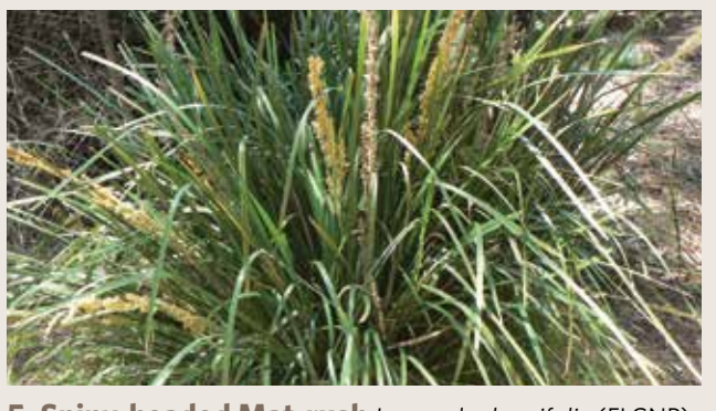
5. Spiny-headed Mat-rush Lomandra longifolia (FLCNP) • Prominent strappy leaved plant to 1 m tall • Very hardy tufts and great for edging • Grows on a variety of soils • Flowers: September - November • Position: semi-sun / sun • Great as food/habitat for: Insects (eg native bees), Frogs, Lizards and Birds

• Common tall spreading shrub with small leaves • Sprays of honey scented, fluffy white flowers • Light pruning for best habitat • Prefers sandy well drained soils • Height to 2-5 m • Flowering: October - December • Position: semi-sun / sun Great as food/habitat for: Insects, Birds and Common Ringtail Possum (nesting)