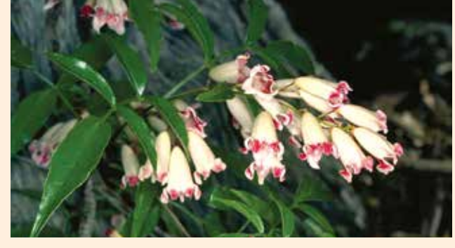
10. Wonga Wonga Vine Pandorea pandorana (M Fagg)