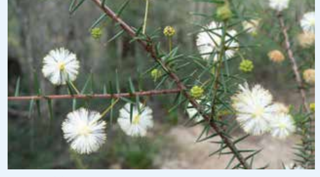
17. Prickly Moses Acacia ulicifolia (FLCNP) Common small shrub with short prickly 'leaves' and pale creamy flower balls • Trim to form dense bird habitat Prefers dry to sandy soils of low fertility Height to 1.5 m

• Flowers: autumn - winter • Position: sun / semi-shade