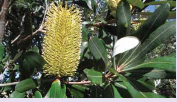
22. Coastal Banksia Banksia integrifolia (FLCNP)

• Ornamental tree with narrow canopy • Oblong leaves are silver undernerneath • Beautiful yellow flower spikes and woody cones • Prefers sandy soils • Height to 5-15 m • Flowers: mainly January - June • Position: sun • Great as food/habitat for: Insects, Birds and Small bats (nectar)