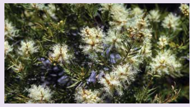
25. Snow in Summer / Flax-leaved Paperbark Melaleuca linariifolia (C Green)

leaves with chamomile scent • Large top clusters of creamy/ white, papery flowers • Prune in late summer for denser growth • Height to 2 m • Flowers: winter - spring • Position: semi-sun / sun • Great as food/habitat for: Insects and Birds