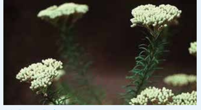
20. Paper Daisy Ozothamnus diosmifolius (D Hardin) Easy growing pretty shrub on sandy soils Thin and short

• Showy tufted grass with partly purplish flower heads • Perennial and wide spread across Australia • Drought resistant, grows in variety of soils • Height to 1 m • Flowers: summer - autumn • Position: semi-sun / sun • Great as food/ habitat for: Insects and Birds