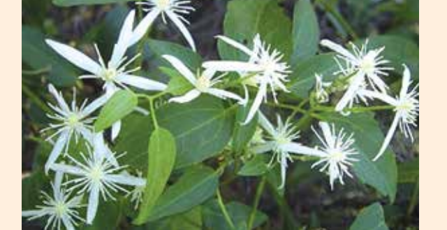
6. Old Man's Beard Clematis glycinoides (or C. aristata ) (L von Richter)

• Hardy, dense and creeping herb with pointed leaves • May be confused with weedy, exotic Trad • Small blue flowers in warmer months • Needs moisture • Position: semi-sun / shade • Great as food/habitat for: Insects (eg native bees), Frogs and Lizards