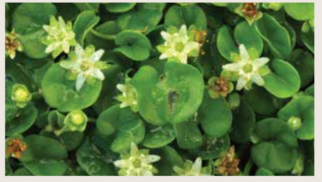
3. Native Kidney Herb Dichondra repens (W Cherry) • Great as a hardy soft groundcover or lawn substitute • Kidney shaped leaves and few small flowers • Prefers damp soil • Position: semi-shade / shade • Great as food/habitat for: Insects, Frogs and Lizards

• Ornamental tree with narrow canopy • Oblong leaves are silver undernerneath • Beautiful yellow flower spikes and woody cones • Prefers sandy soils • Height to 5-15 m • Flowers: mainly January - June • Position: sun • Great as food/habitat for: Insects, Birds and Small bats (nectar)