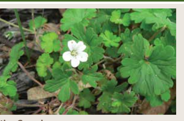
4. Native Geranium Geranium homeanum (FLCNP) Fine-leaved, scrambling herb or dense groundcover • Small pretty, pale pink flowers • Height to 30 cm • Flowers: November - February • Position: semi-sun • Great as food/ habitat for: Insects, Lizards and Birds