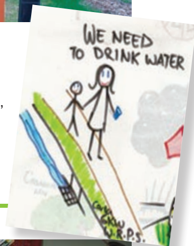
Student artworks on water conservation and stormwater protection

For upcoming Catchment Connections activities including guided nature walks and workshops see http://www.ryde.nsw.gov.au/catchmentconnections