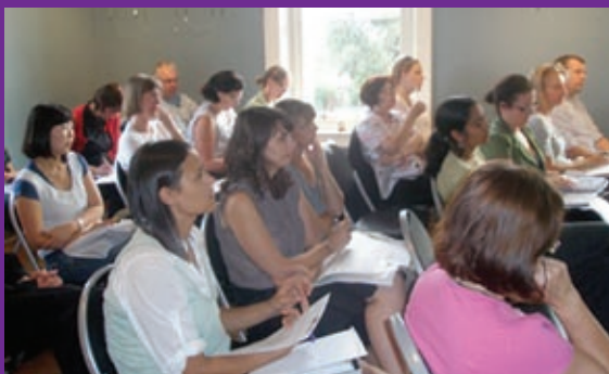
Launch Meeting 2010

It also includes recent REEN highlights and details of the next REEN meeting. Enjoy!