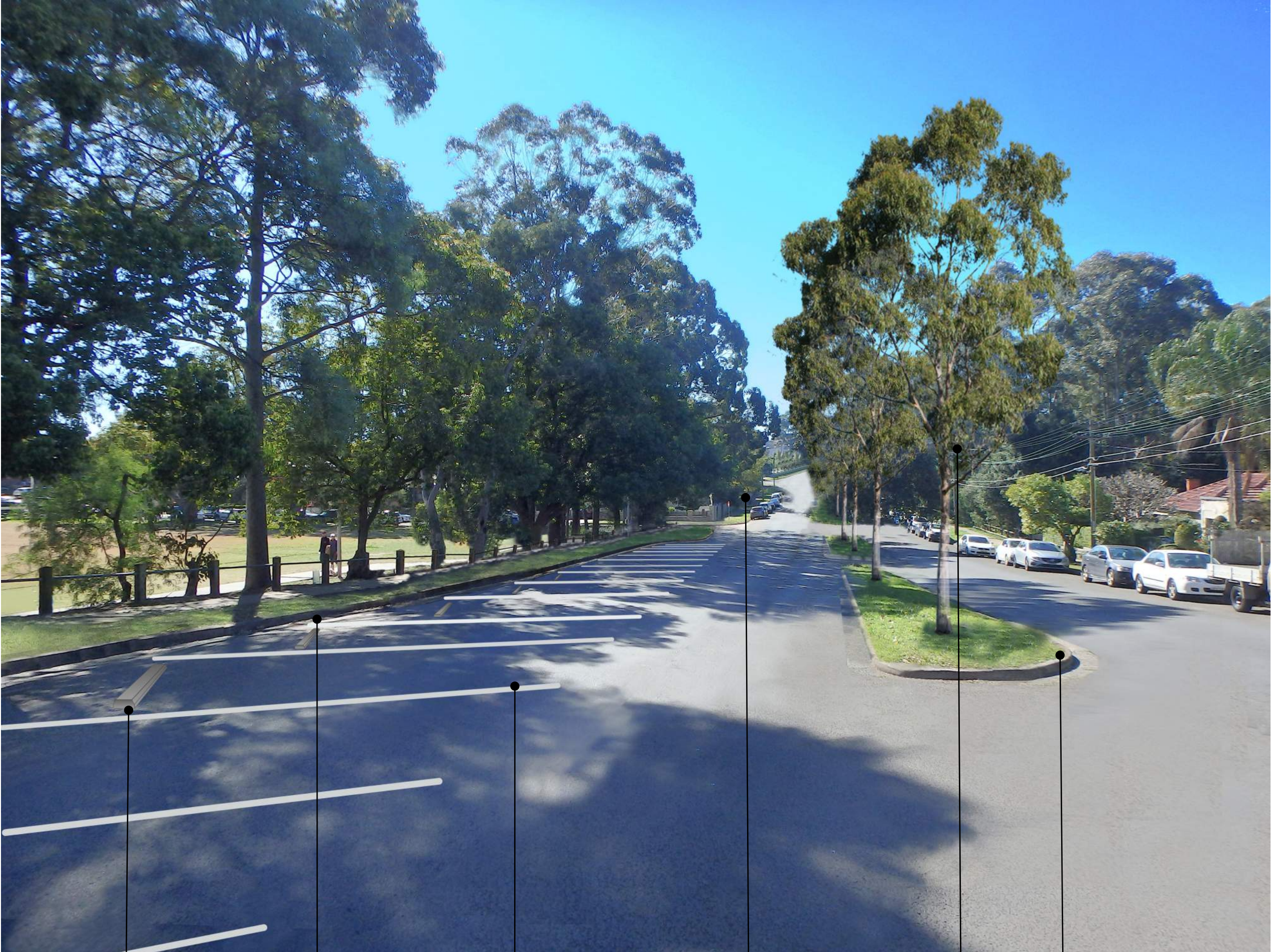
ARTIST'S IMPRESSION SHOWING 60 DEGREE ANGLES PARKING SPACES, KERB REALIGNMENT AND MEDIAN ISLAND UPGRADE - VIEW FROM LOCATION 1