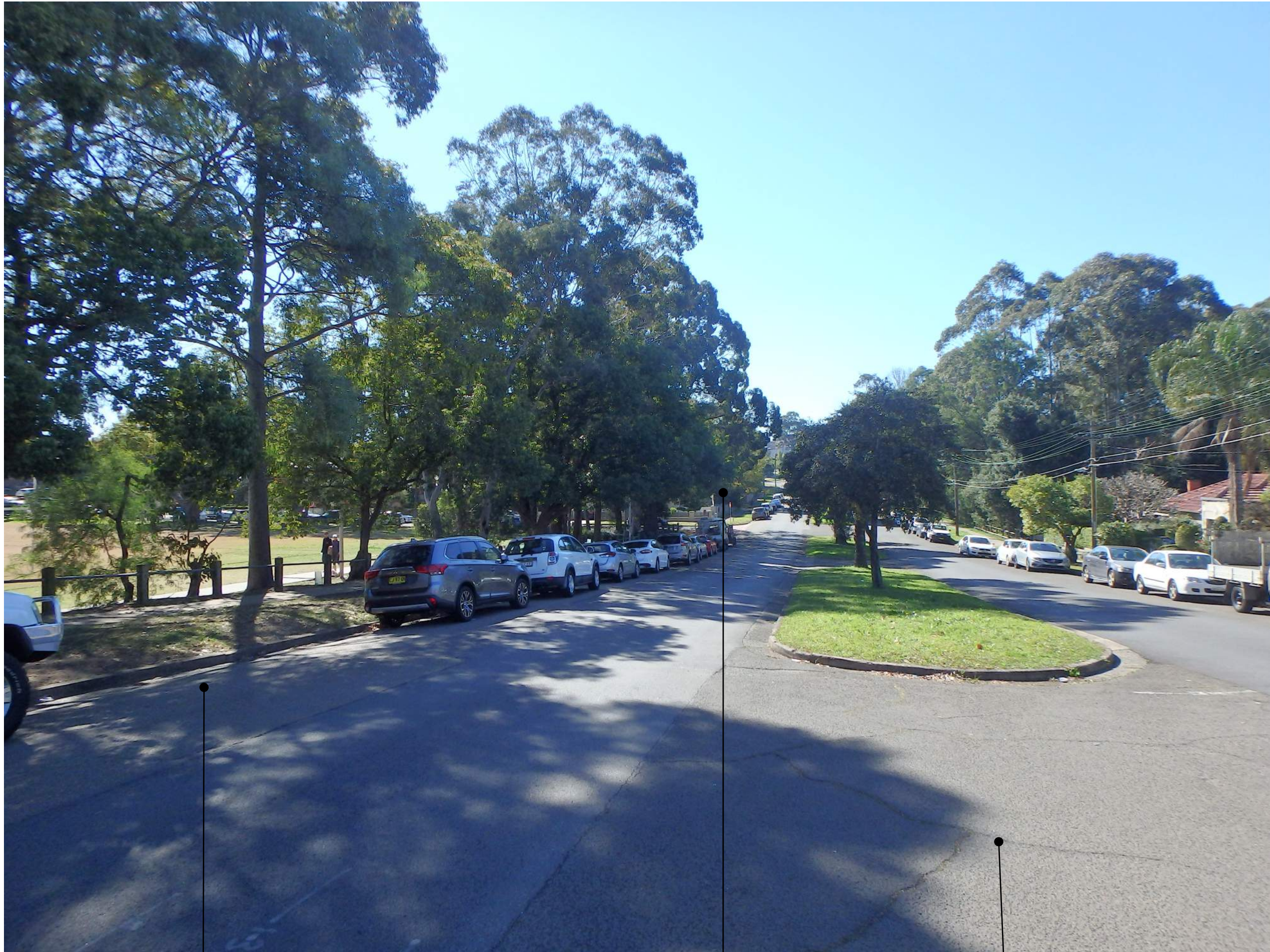
EXISTING STREET VIEW (VIEW FROM LOCATION 1) REFER TO PLAN BELOW FOR LOCATION. PHOTO WAS TAKEN ON 3 AUGUST 2019