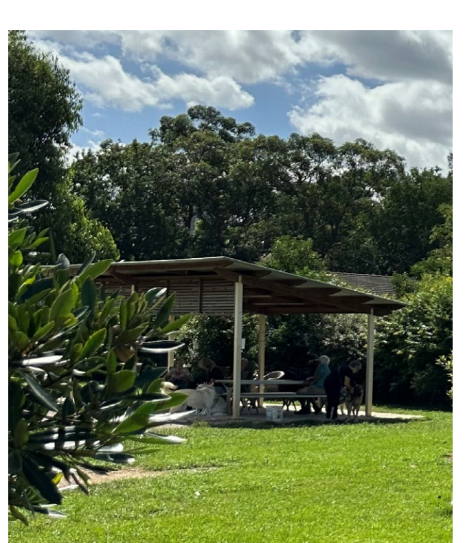
SHADE STRUCTURE SEATING)