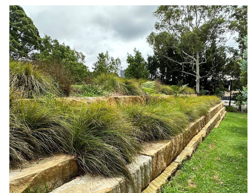
TERRACED BUFFER WITH PLANTING AND GRASS