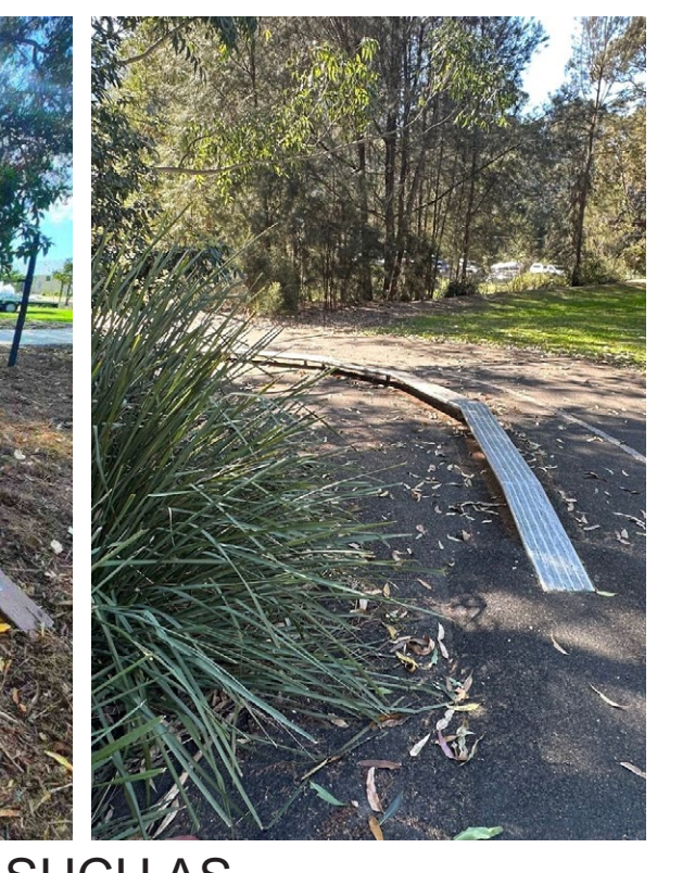
DOG AGILITY (RE-PURPOSED EXISTING SITE MATERIALS, SUCH AS BIKE TRACK OBSTACLES, BALUSTRADES, SEATS, TREE TRUNKS, ETC)