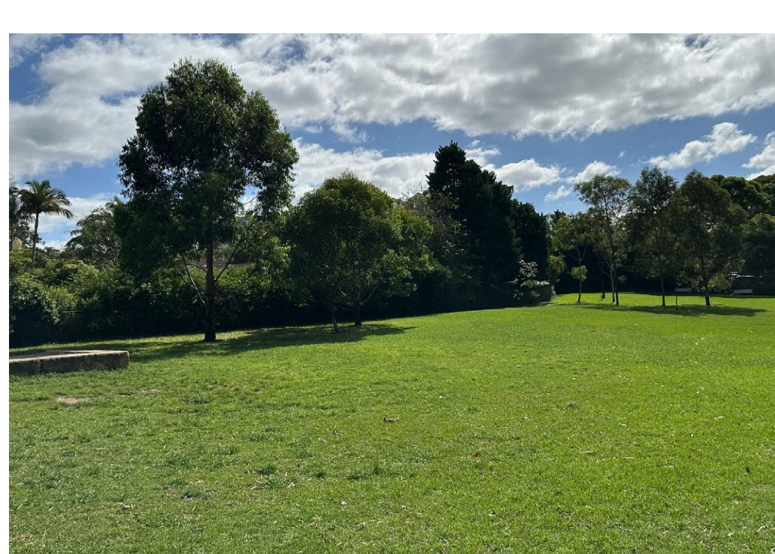
OPEN GRASS AREA (10M X 4M, WITH SALVAGED (GENERALLY FLAT OPEN LAWN WITH TREE CANOPIES SURROUNDED)