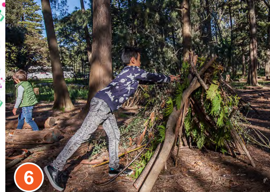
New Playground Equipment and Play Ideas, Indicative Only