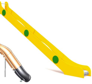
6 CANOE SLIDE