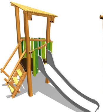
2 COMBINATION UNIT