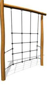
3 CLIMBING NET