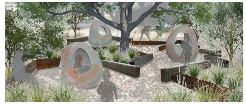
1 ART-PLAY CUBBIES - CONCEPT DESIGN