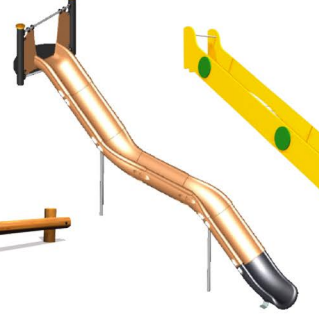
5 KAYAK SLIDE