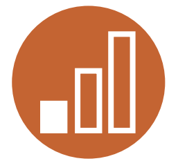
Easy level of challenging equipment