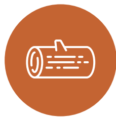
Nature play elements