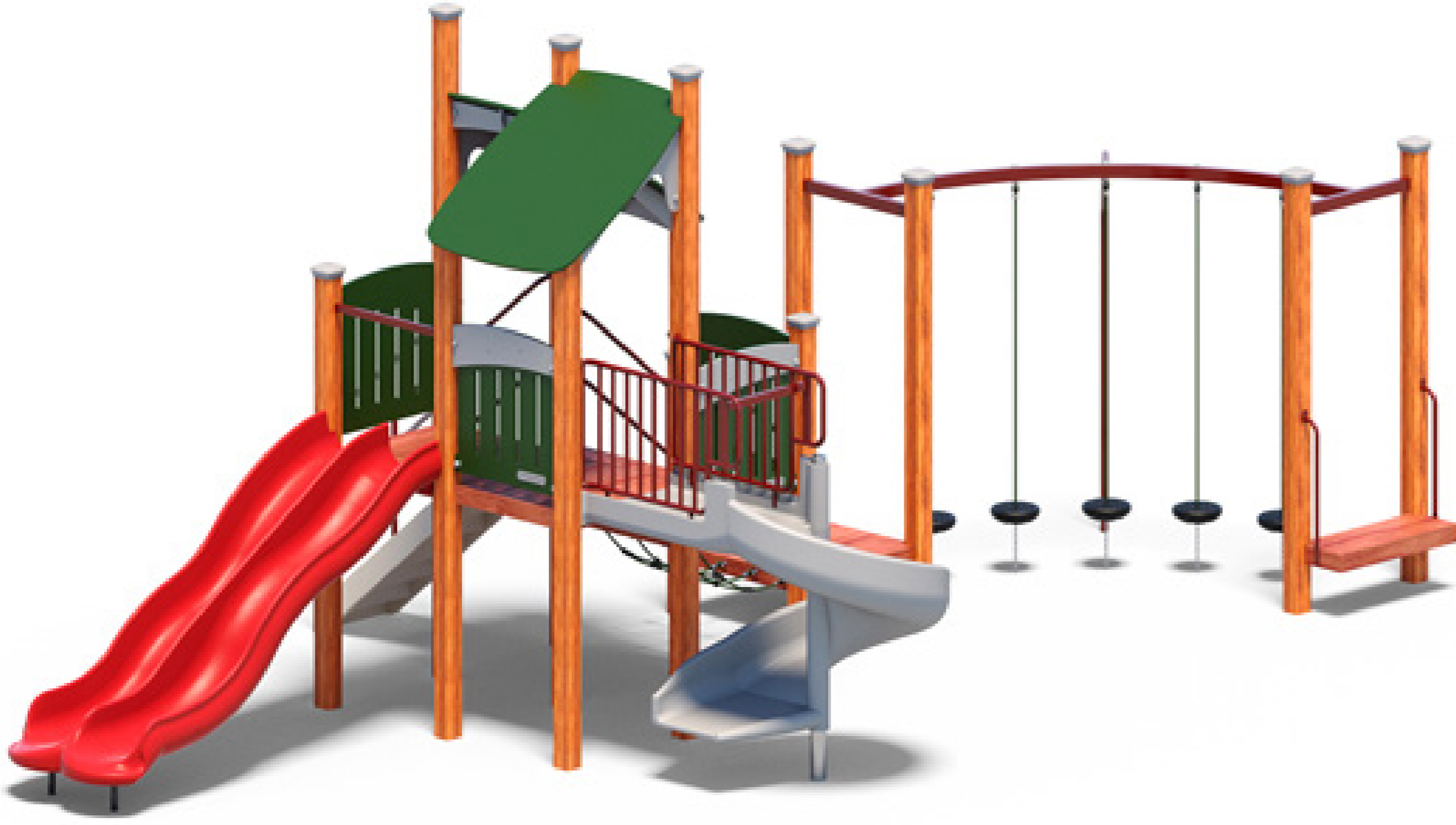
MULTIPLAY UNIT WITH SLIDES