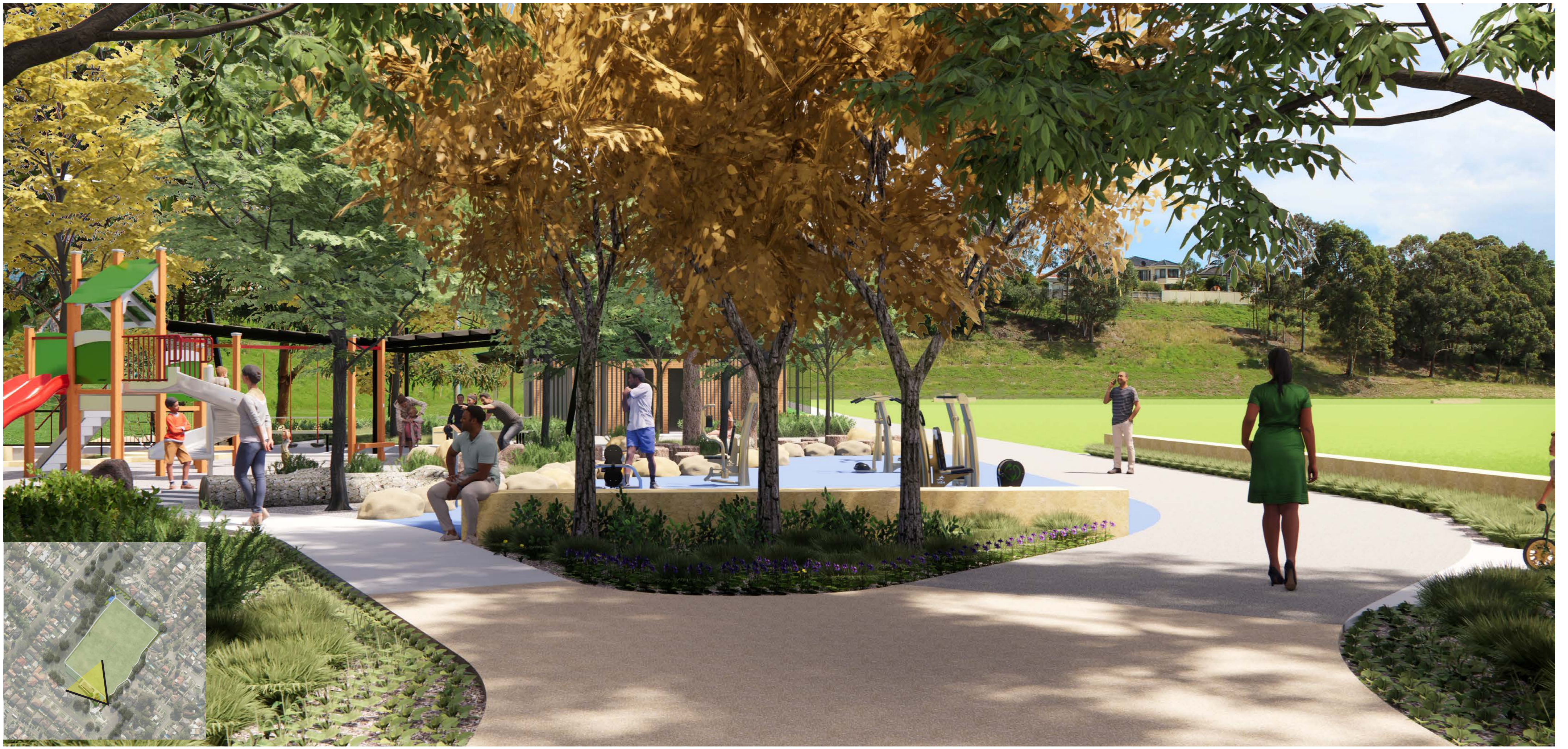
PLAYGROUND EXTENSION AND FITNESS AREA 2 - DYNAMIC EQUIPMENT