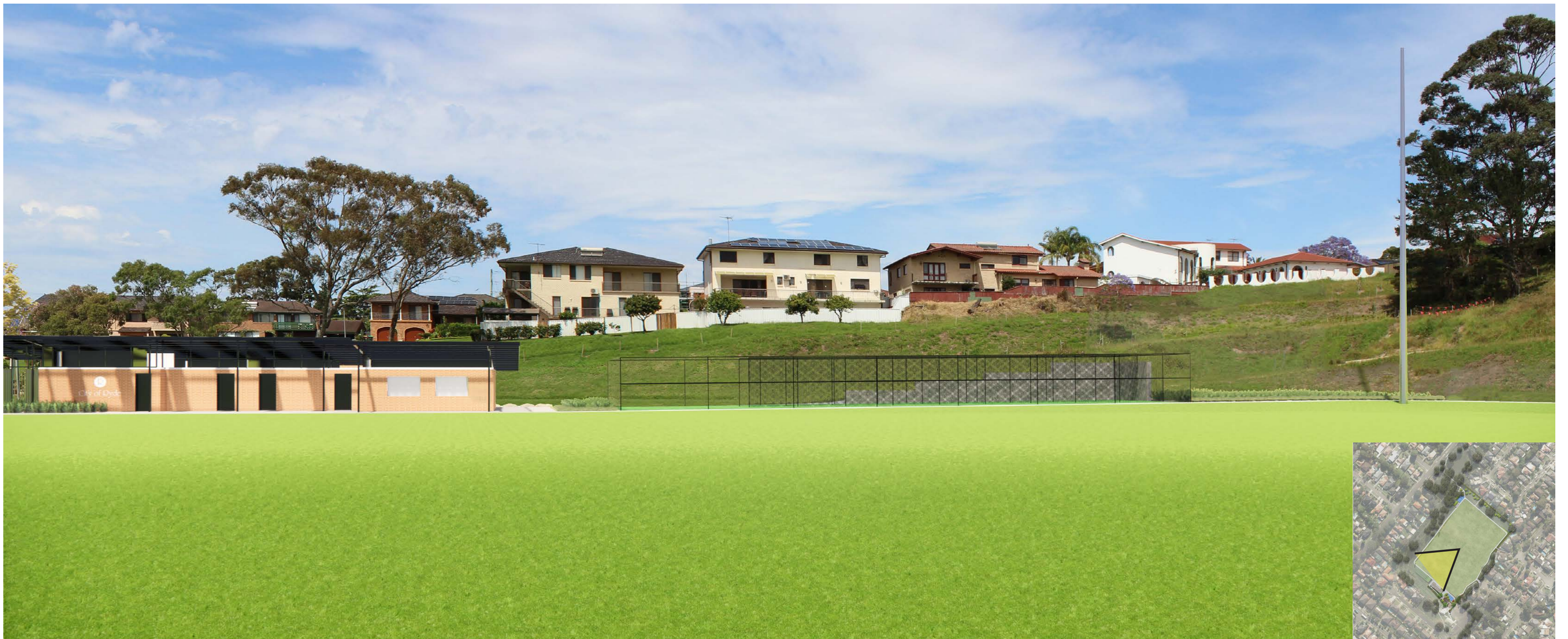
CRICKET NETS AND NEW AMENITIES BUILDING