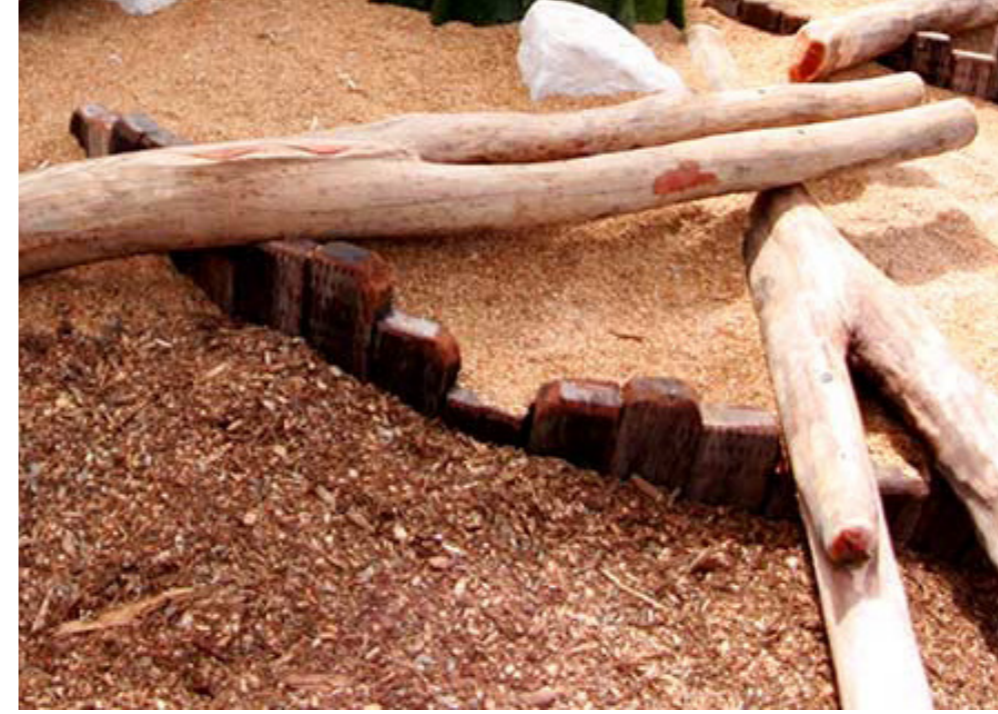
NATURE PLAY - TIMBER LOG PLAY