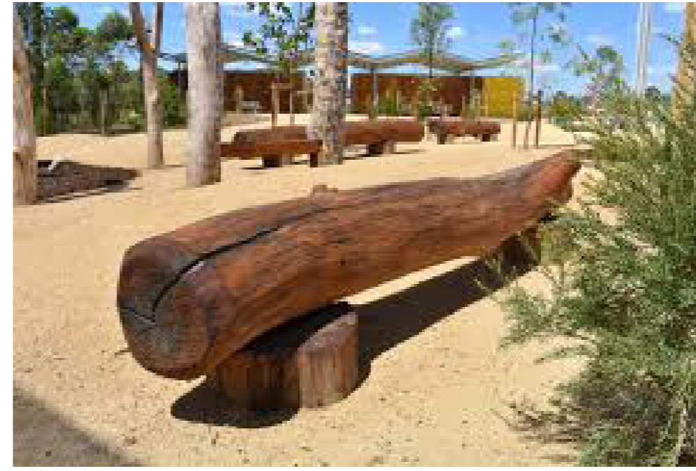
NATURE PLAY - TIMBER LOG SEATER