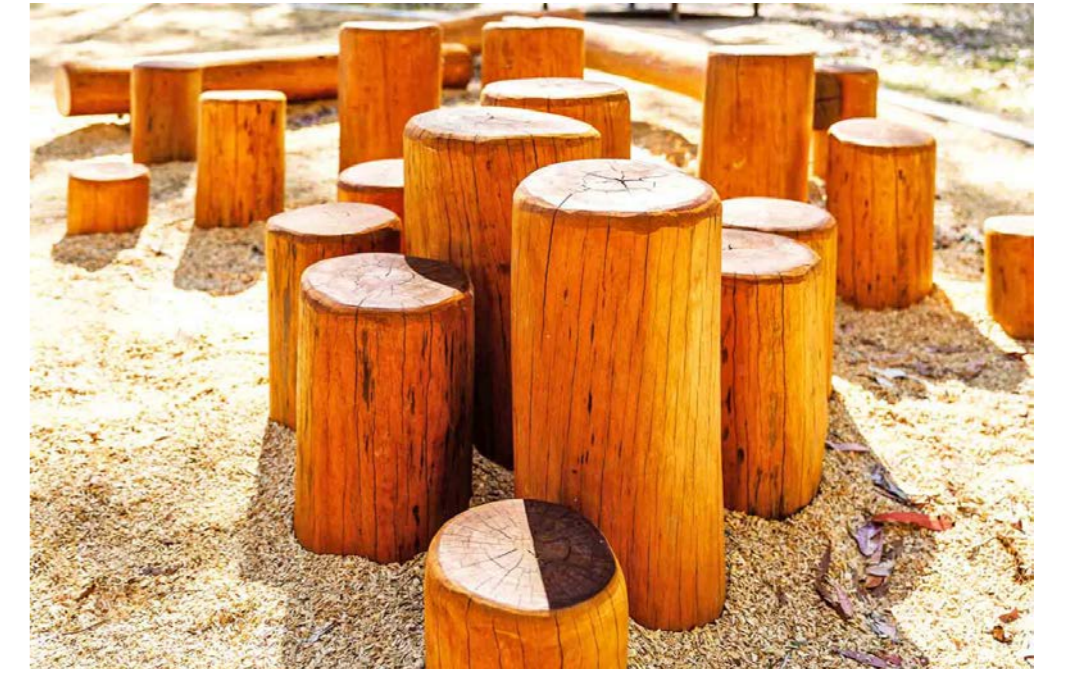
NATURE PLAY - TIMBER STEPPER