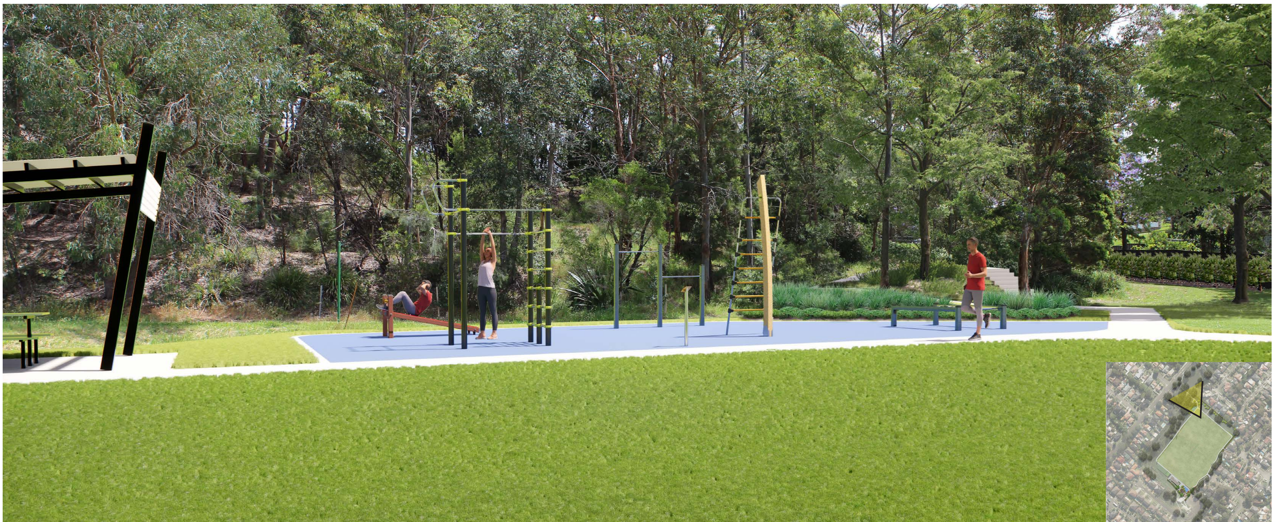
FITNESS AREA 1 - STATIC EQUIPMENT