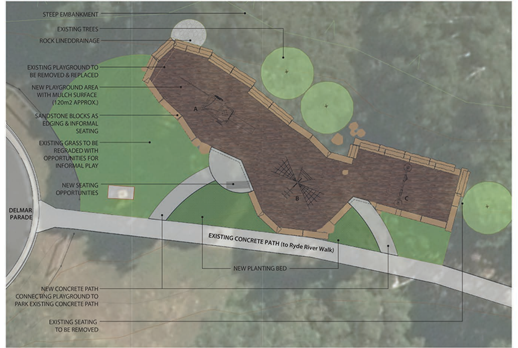
PLAYGROUND UPGRADE - SKETCH DESIGN PLAN