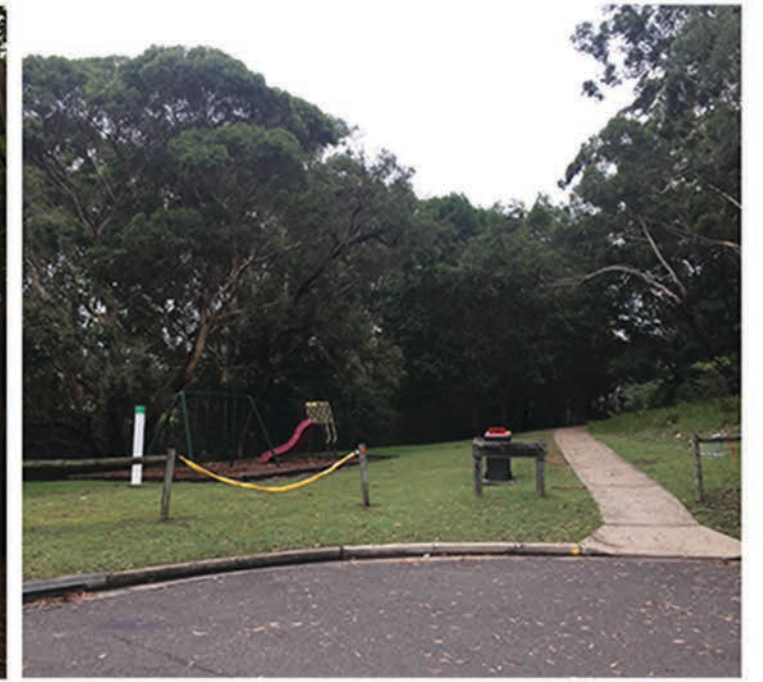
PLAYGROUND UPGRADE - EXISTING SITE PHOTO (06.01.2019)