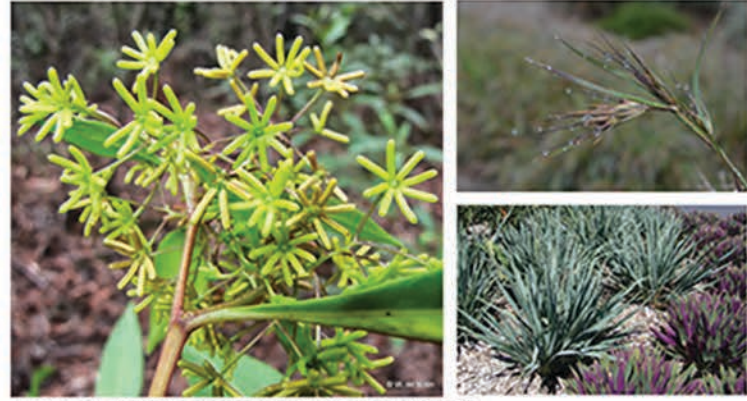
NATIVE PLANTS TO SOFTEN ENTRY TO PLAY SPACE ( Dodonaea triquetra . Dianella caerulea . Lomandra longifolia )