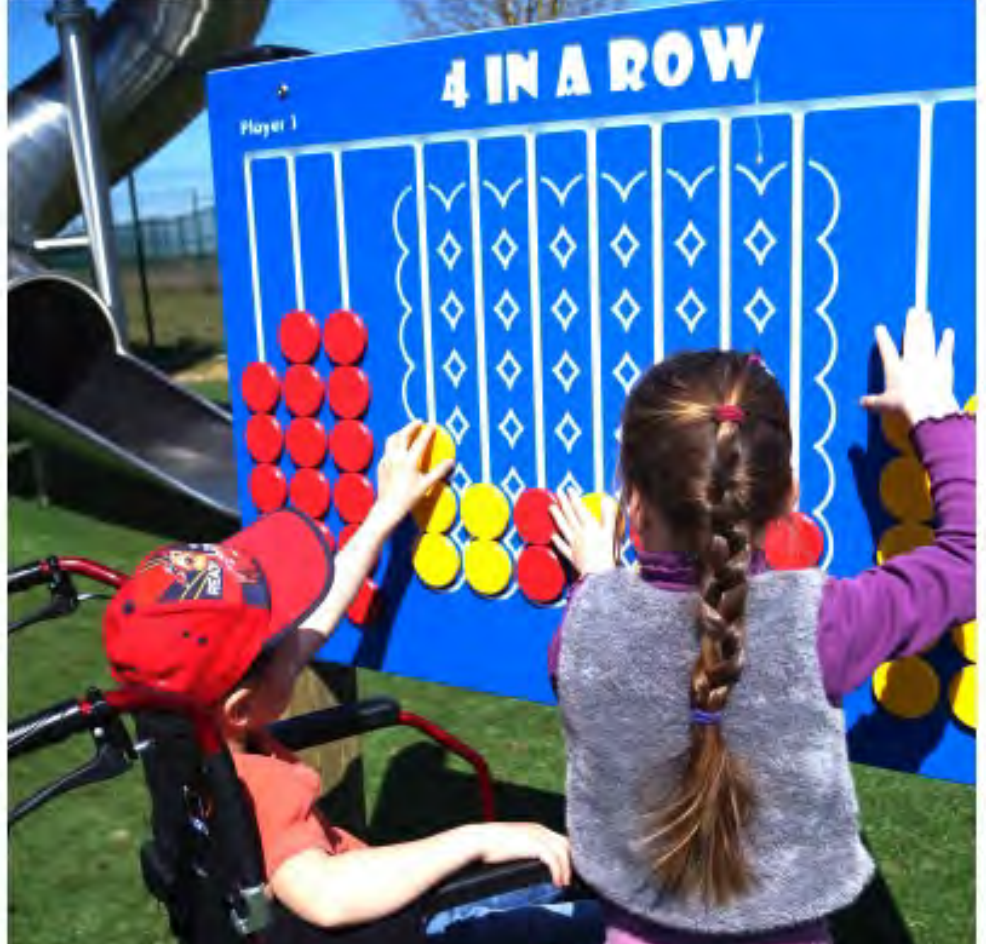
D PLAY PANEL

NEW PLAYGROUND EQUIPMENT IDEAS - INDICATIVE ONLY (NOT SHOWN TO SCALE)