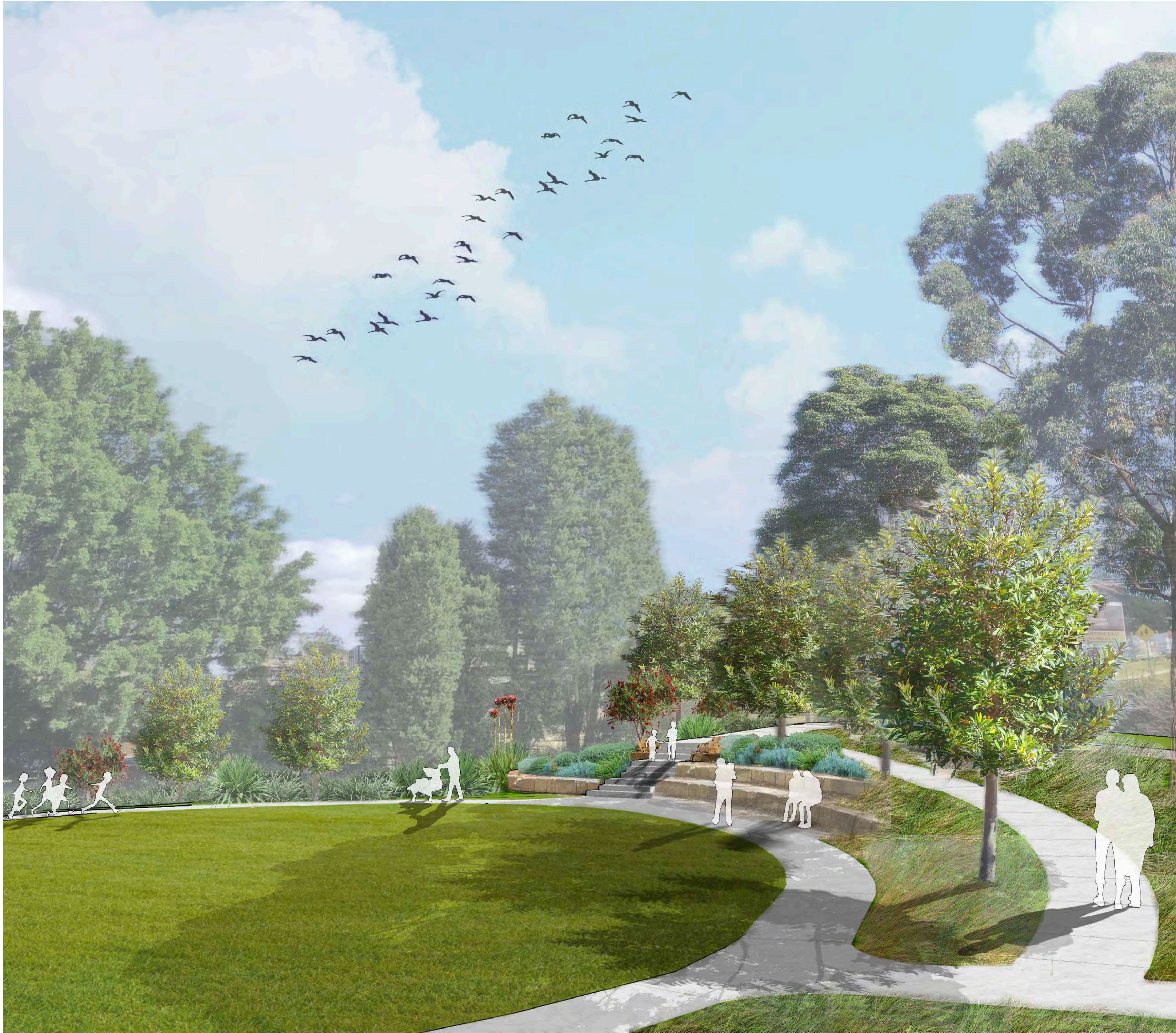
VIEW 1 ACROSS BALL GAME AREA TOWARDS MAIN STAIR LEADING TO KINGS ROAD