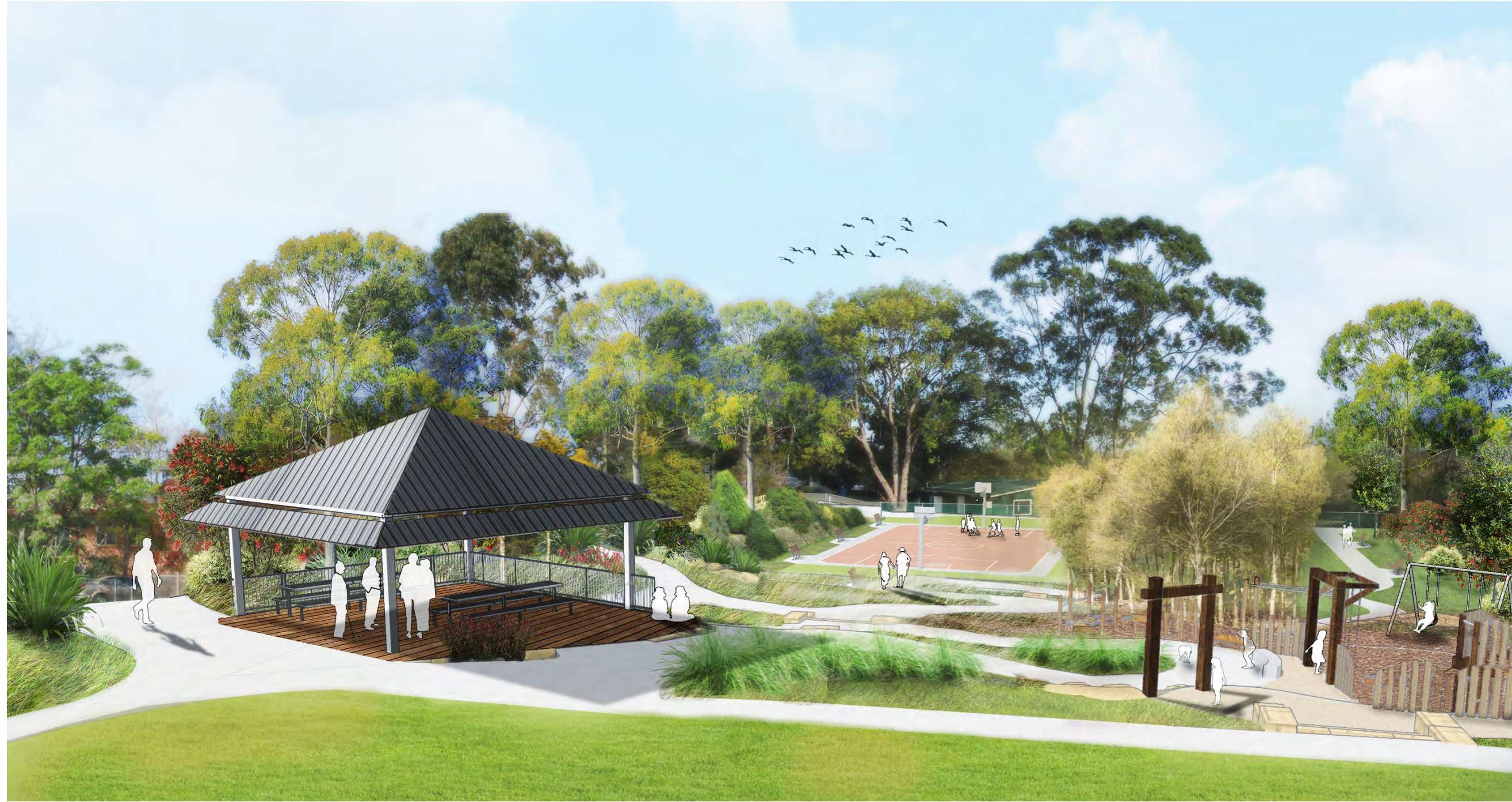
VIEW 2 FROM THE SHELTER SHOWING THE PATHWAY WINDING THROUGH THE GRASSLANDS DOWN TO THE MULTI COURT AREA