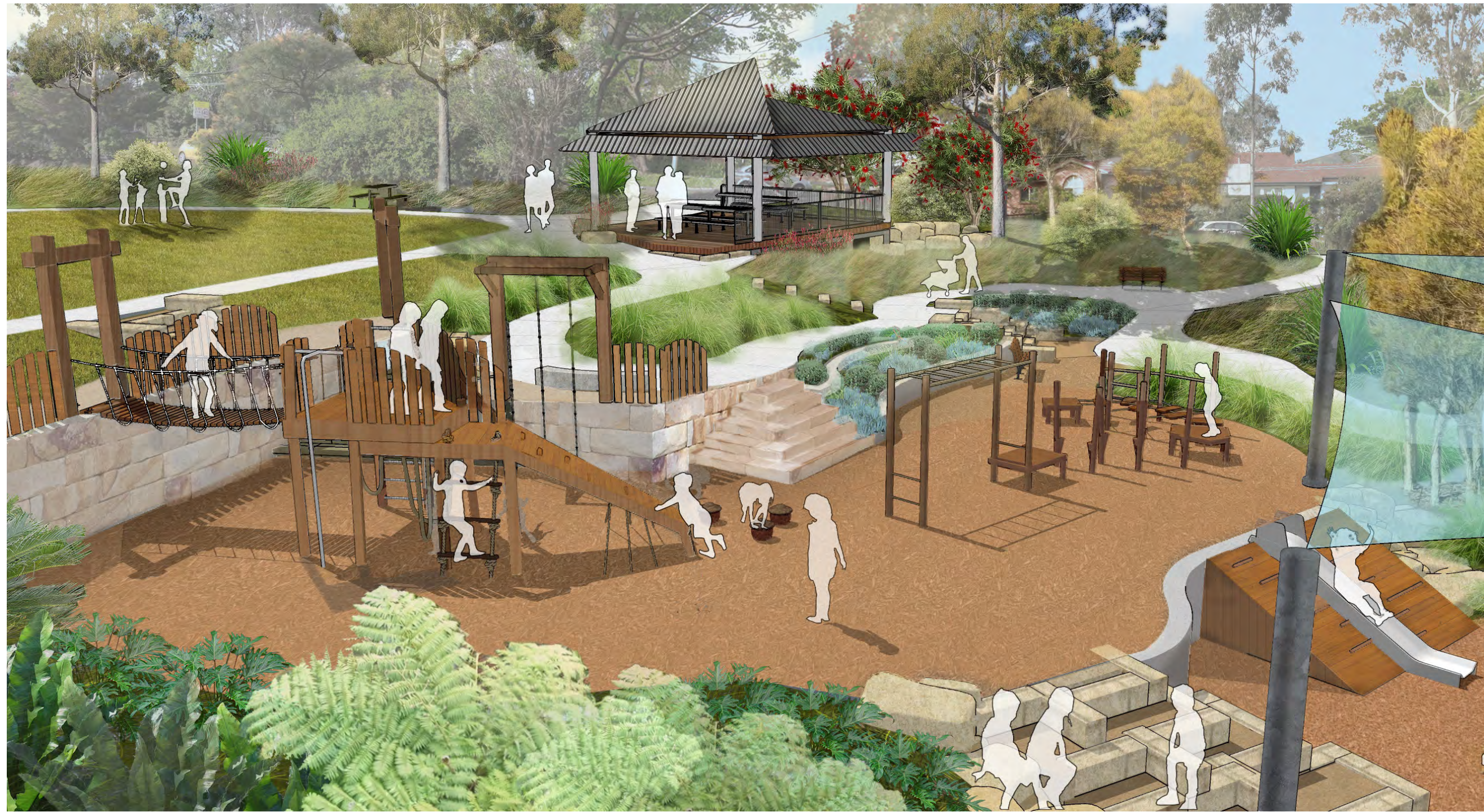
VIEW 3 OF UPPER PLAY AREA CAPTURING THE SHELTER IN THE BACKGROUND