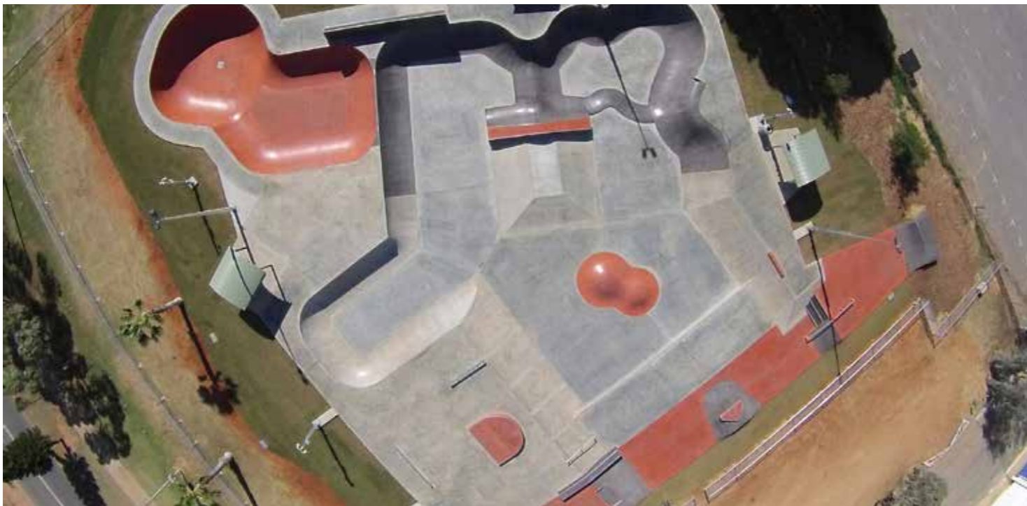
WONTHELLA SKATE PARK | TRANSITION