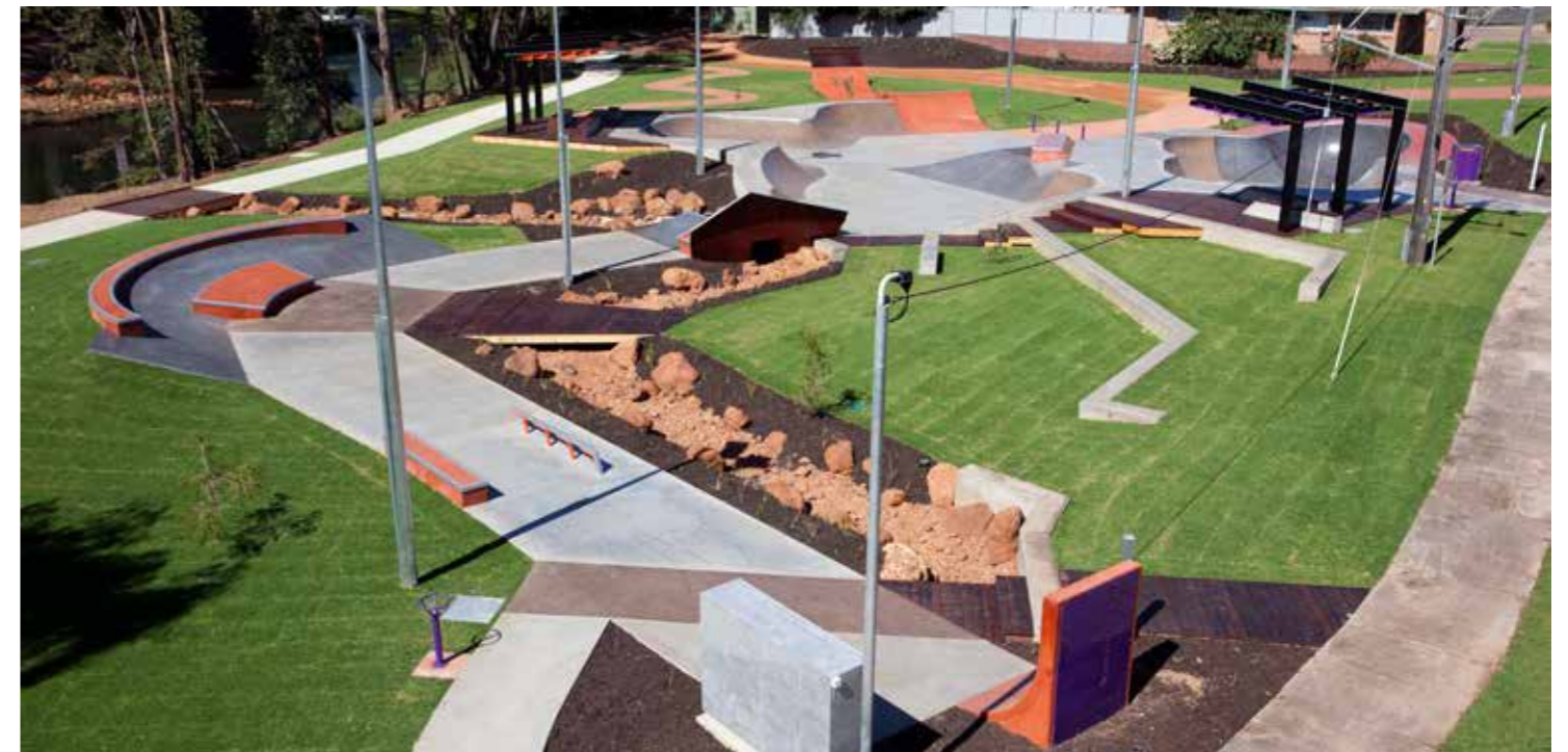
COLLIE YOUTH SPACE | MIXED