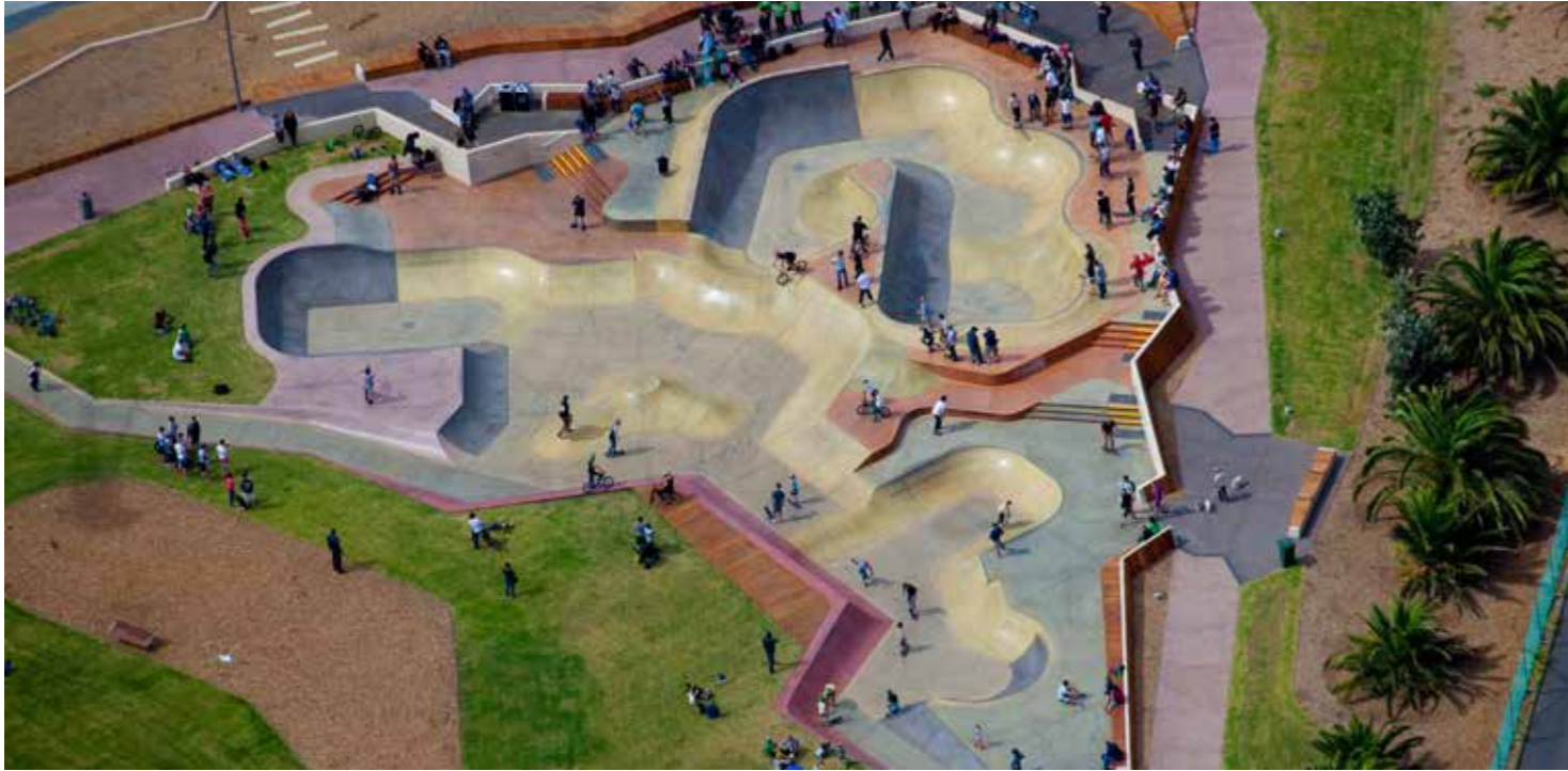
ST KILDA SKATE PARK | TRANSITION