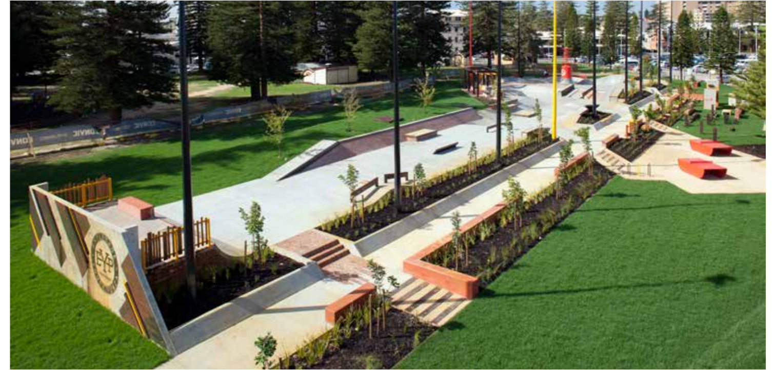
FREMANTLE ESPLANADE YOUTH PLAZA | STREET