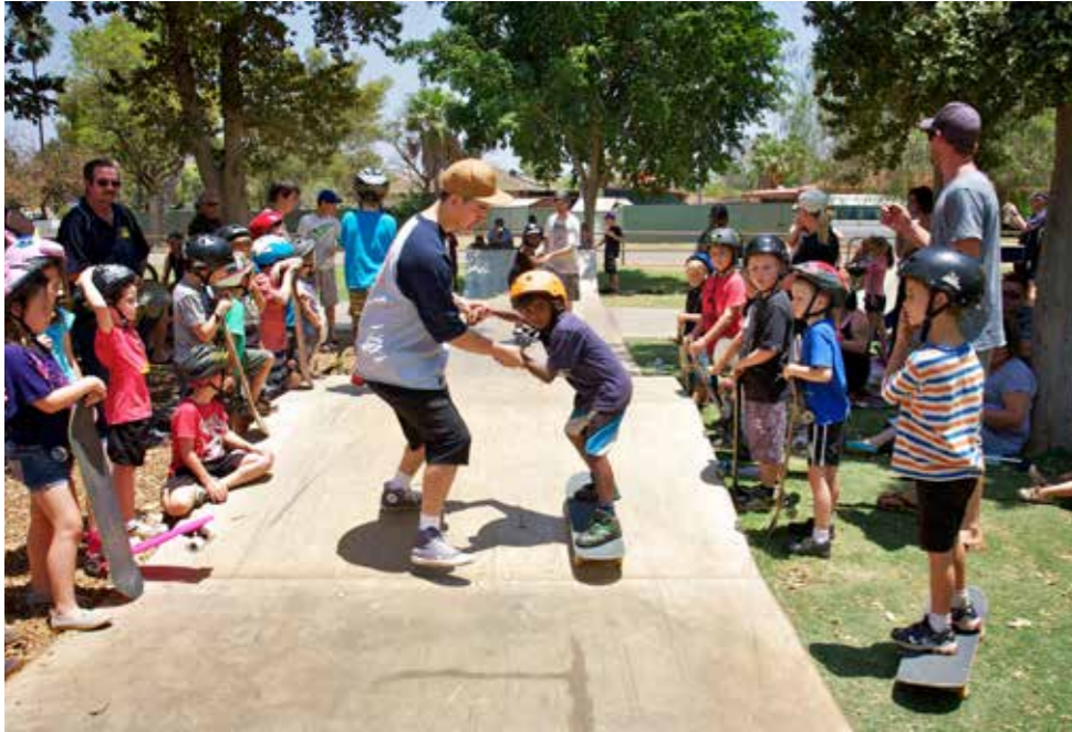
LEARN TO SKATE WORKSHOPS