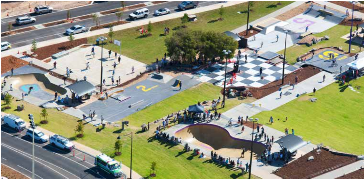
BUSSELTON YOUTH ACTIVE AREA | MIXED