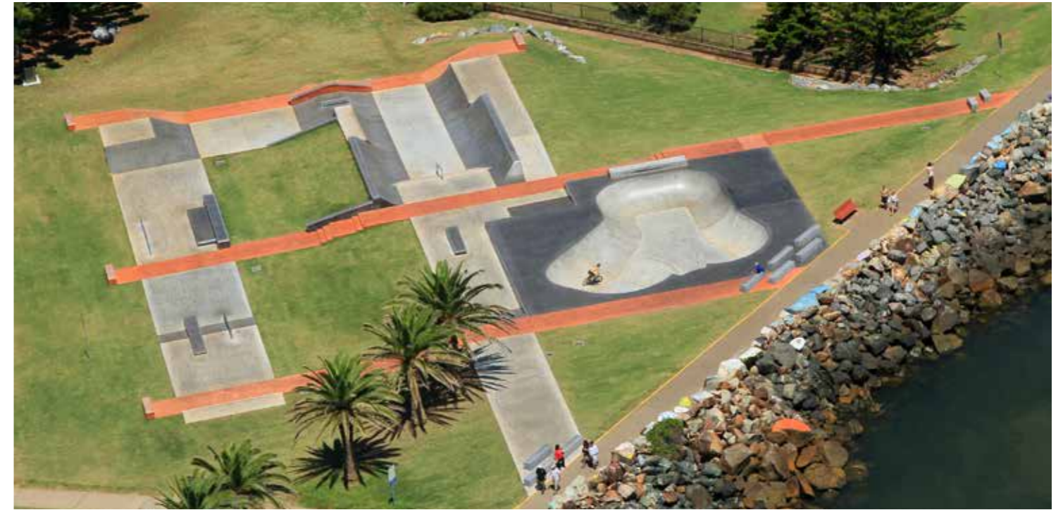
PORT MAQUARIE SKATE PARK | MIXED