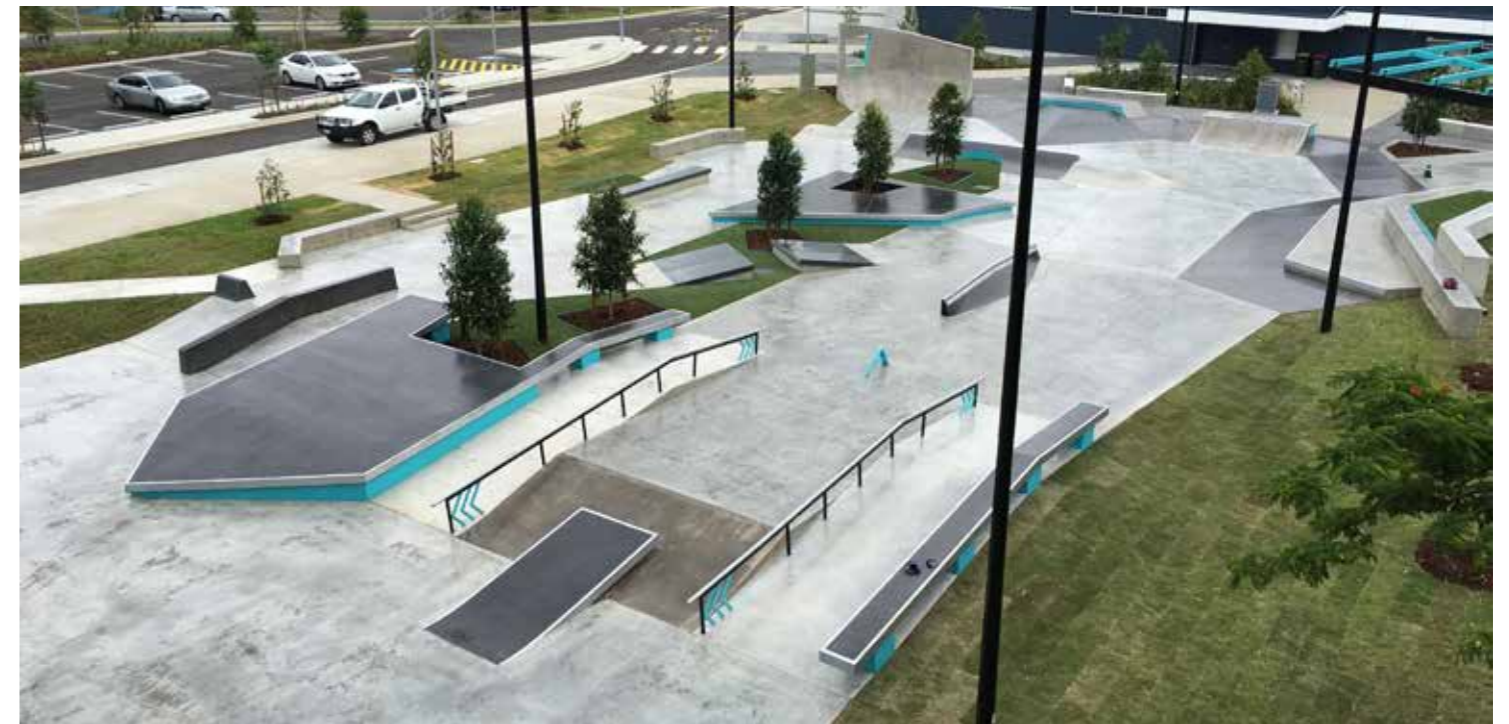
BRACKEN RIDGE SKATE PLAZA | STREET