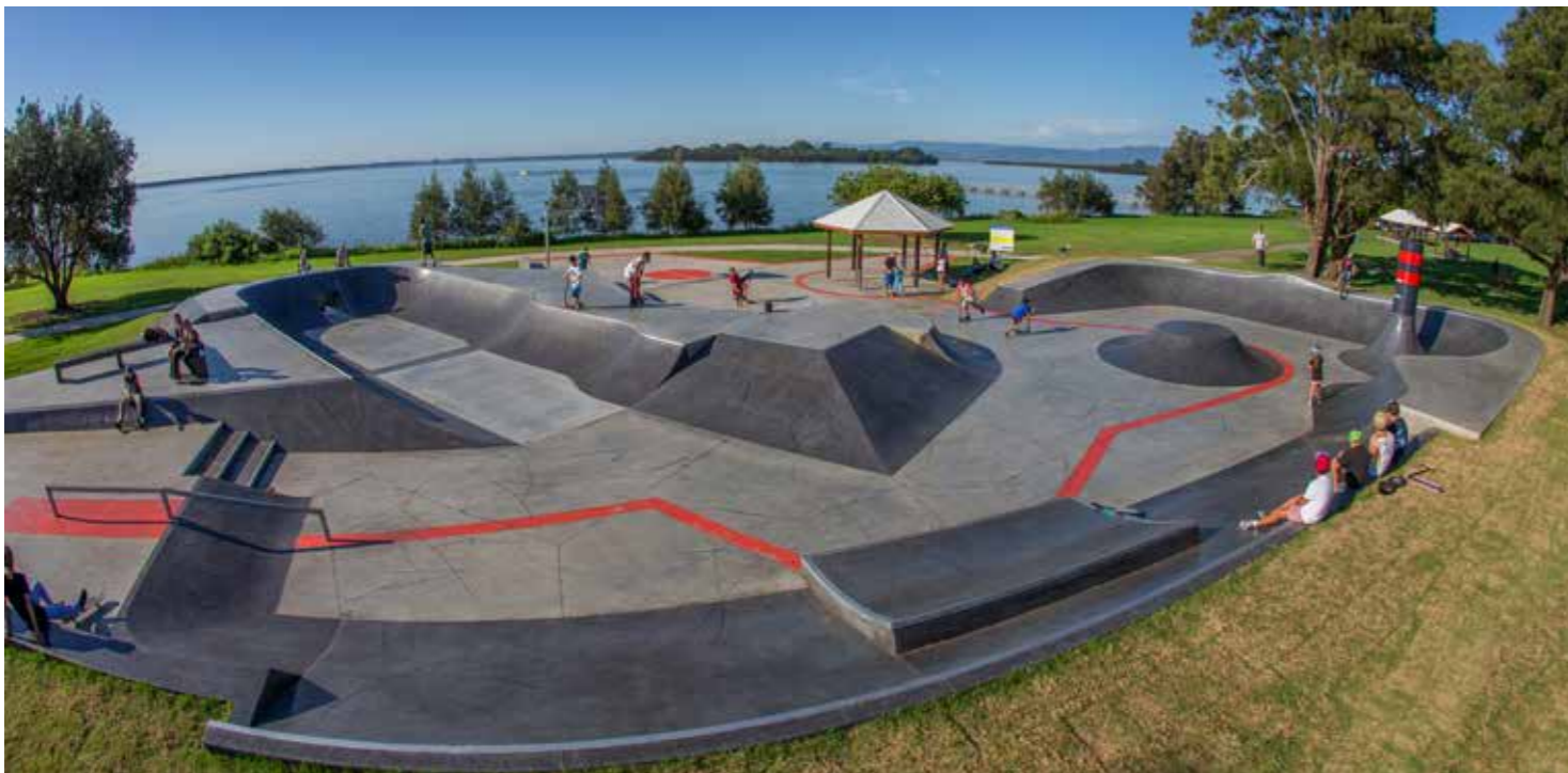
WOLLONGONG SKATE PARK | MIXED