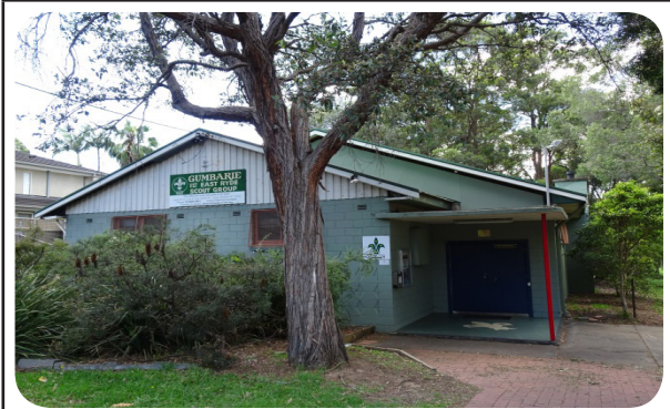
1 st East Ryde Scout Hall