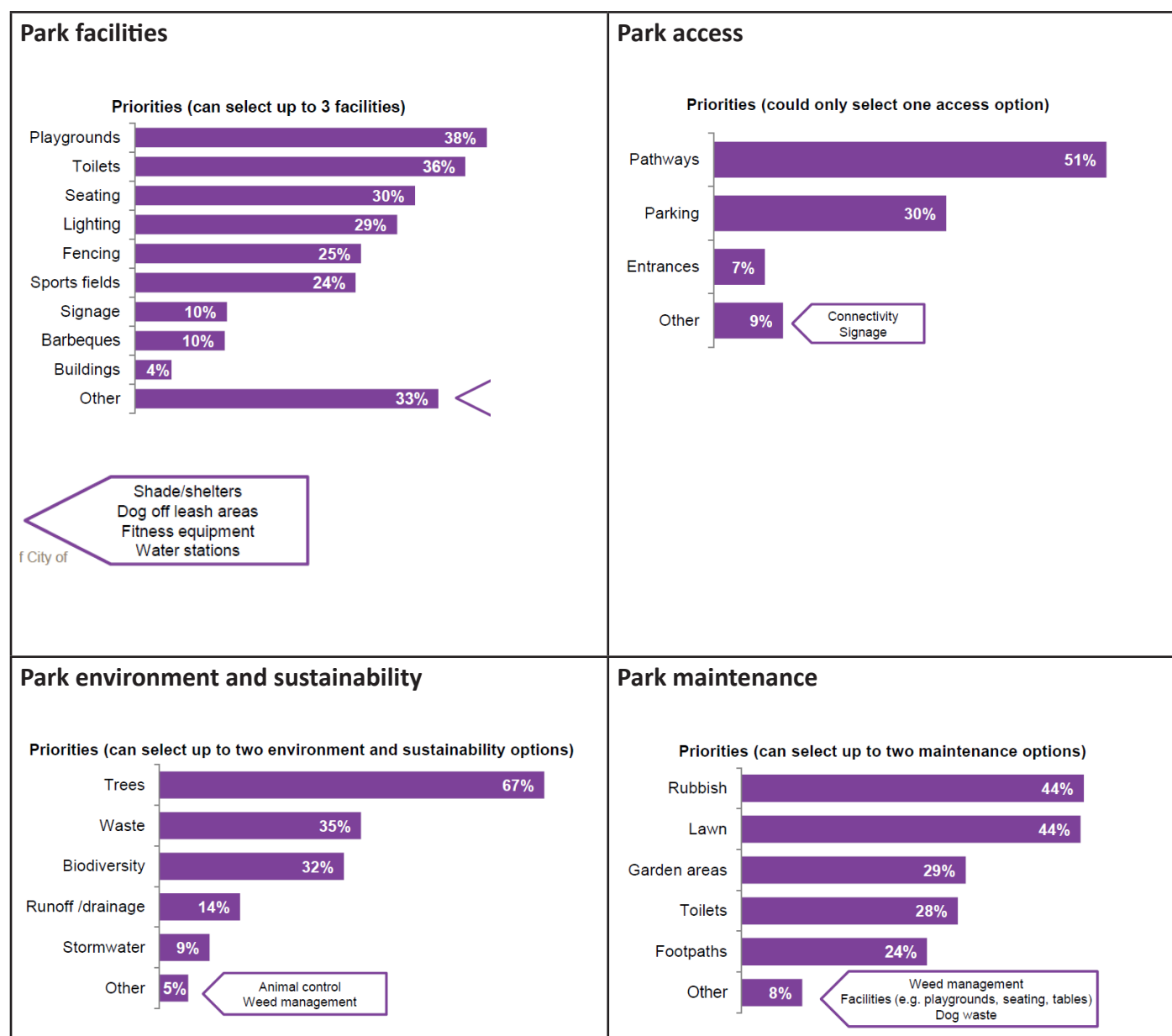
Figure 2 Priorities for parks in City of Ryde

Priorities for parks were identified by park users are shown in Figure 2.