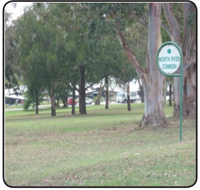
NORTH RYDE COMMON