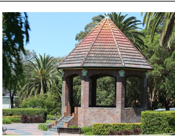
Rotunda in Ryde Park