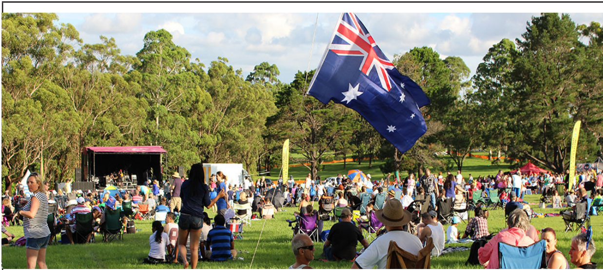
Australia Day 2016 – North Ryde Common.

General community uses of land include Scout and Guide activities, clubhouses for community groups, bowling clubs, child care and pre-schools.