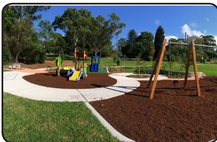
Granny Smith Reserve

General community use land will be managed for community activities within the City of Ryde.