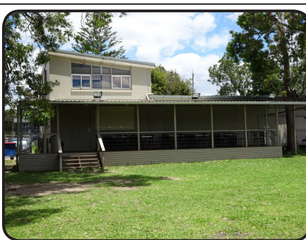
Denistone Ararat Scout hall – Santa Rosa Park