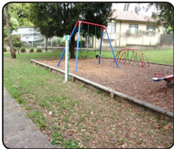
Anne Thorn Park

The plan must state whether the use or management of the land is subject to any condition imposed by the owner (s.37). The plan must state any restriction, covenant, trust etc applying to the land.