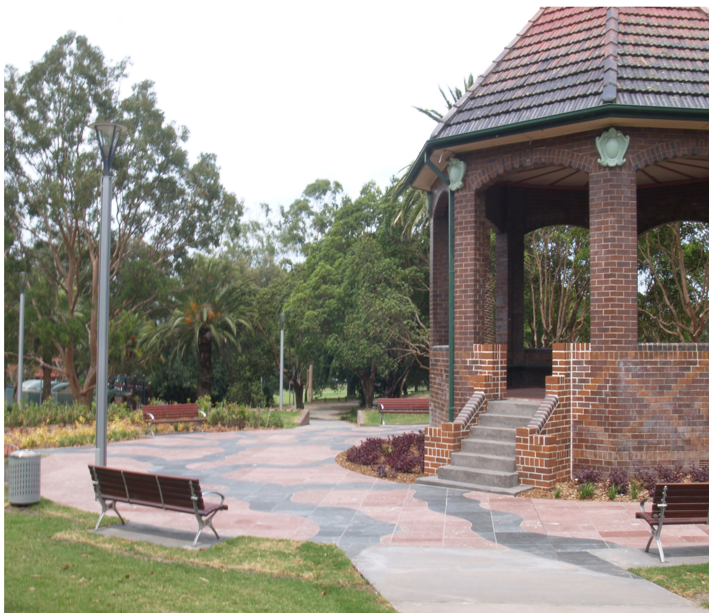
Ryde Park Rotunda