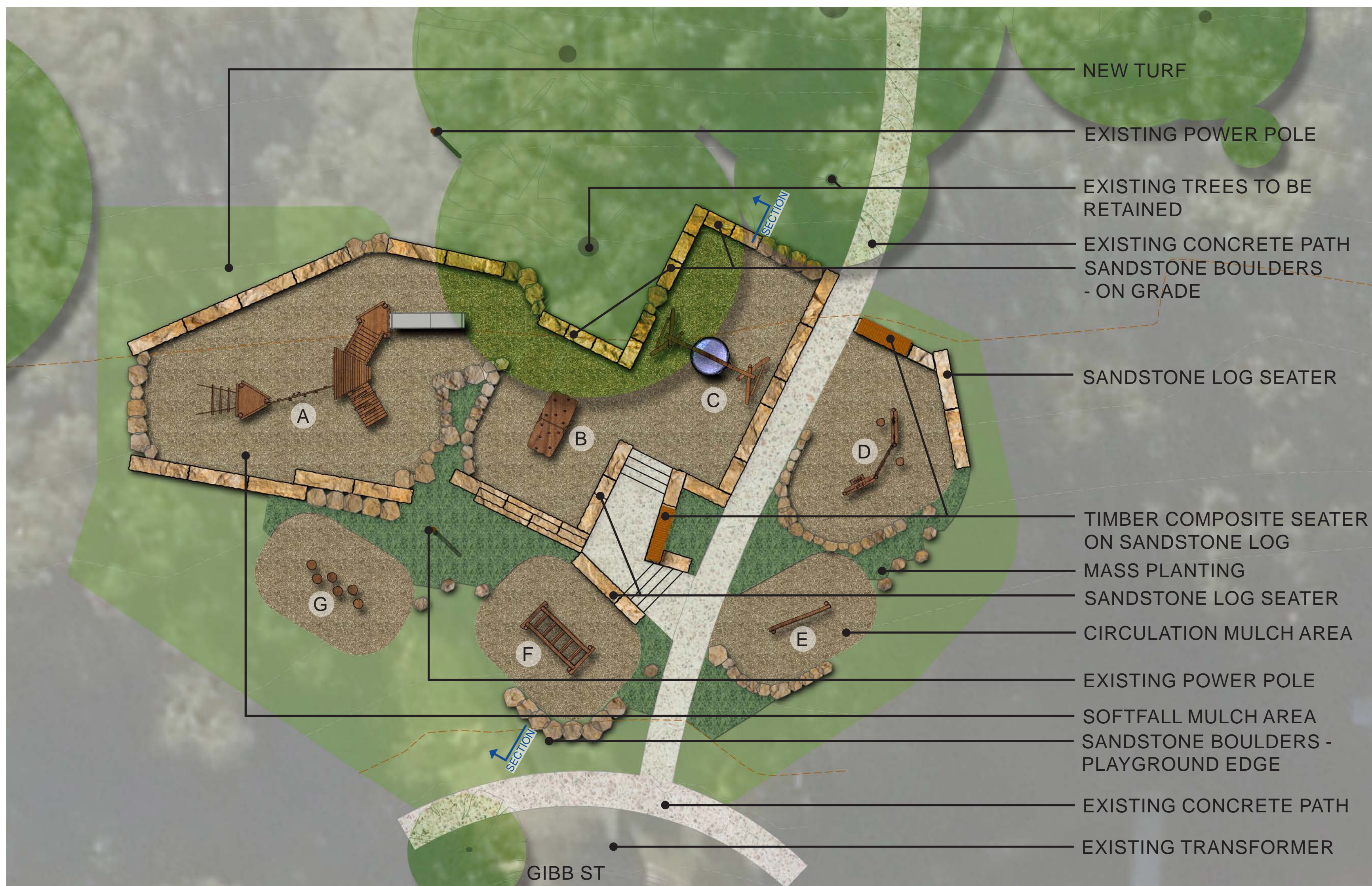
PLAYGROUND UPGRADE CONCEPT PLAN NTS