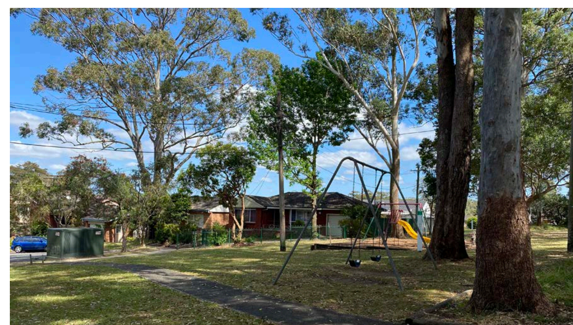
EXISTING PLAYGROUND PHOTO