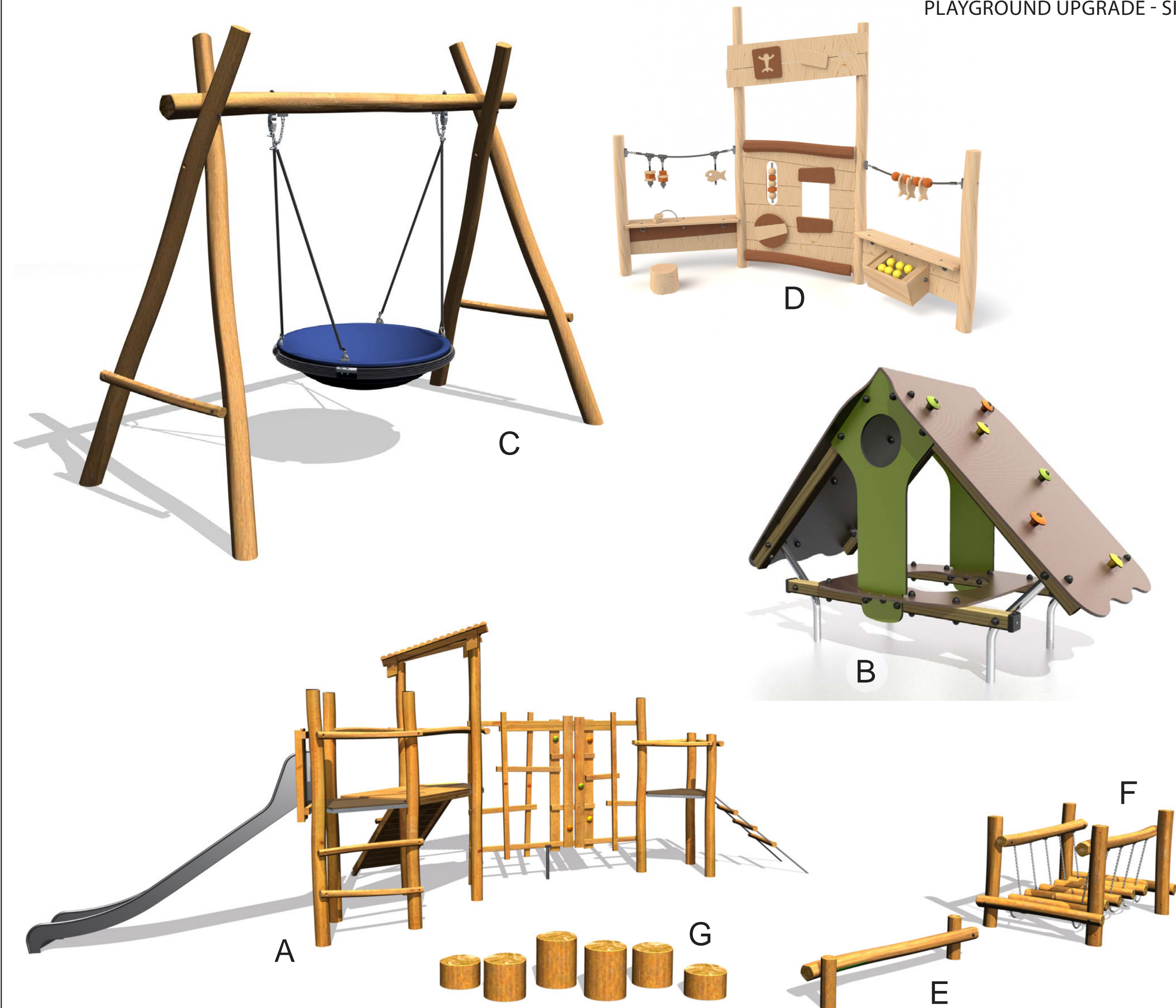
NEW PLAYGROUND EQUIPMENT & PLAY IDEAS, INDICATIVE ONLY