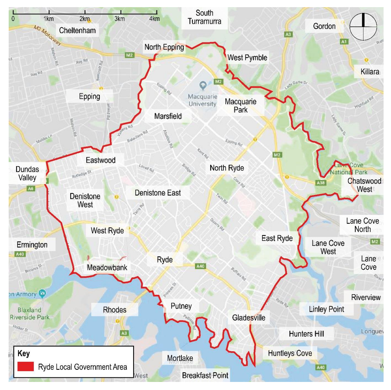
Figure 1.1 City of Ryde LGA.