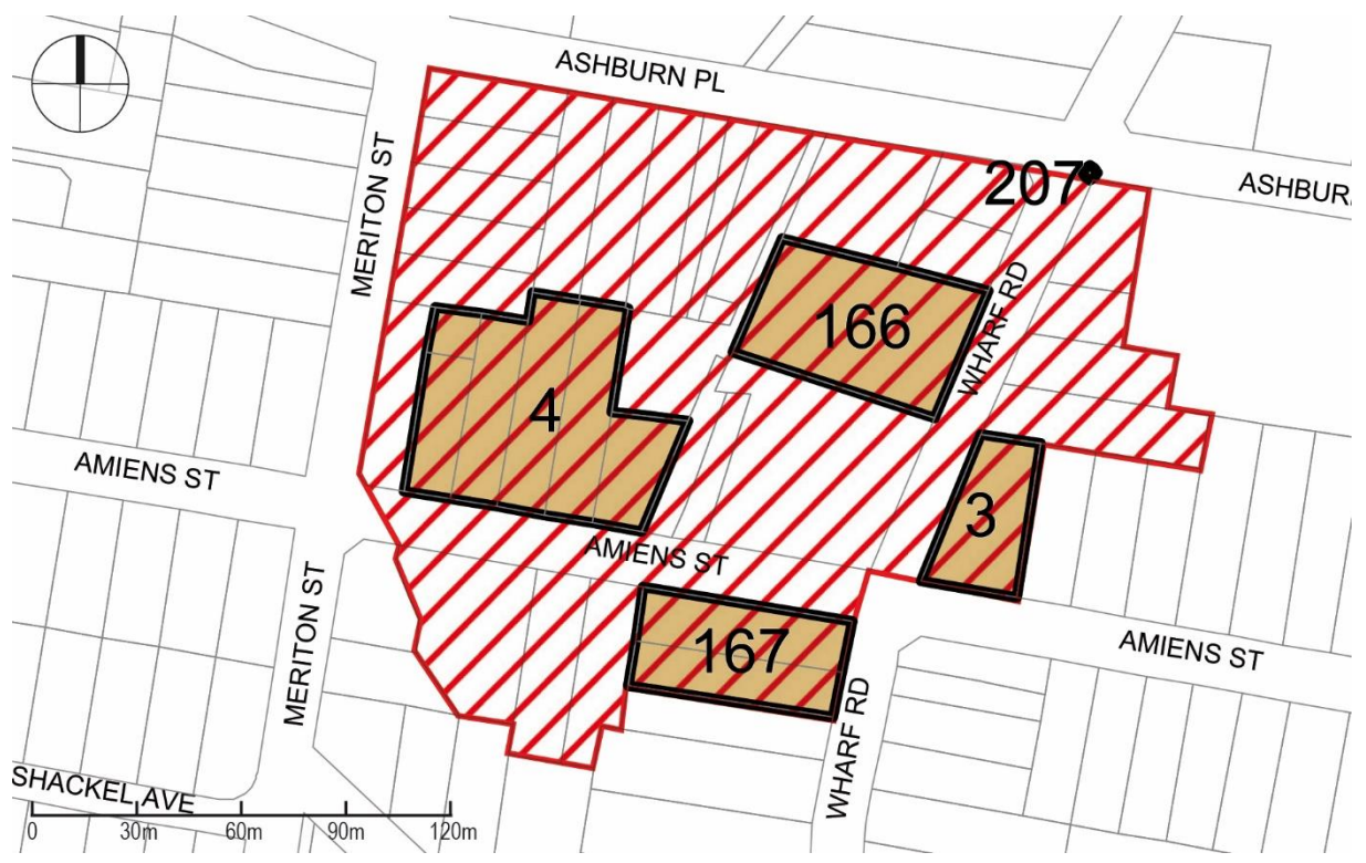
Figure 4.2.6 Ryde LEP Heritage Map indicating the draft Wharf Road Heritage Conservation Area, Gladesville.