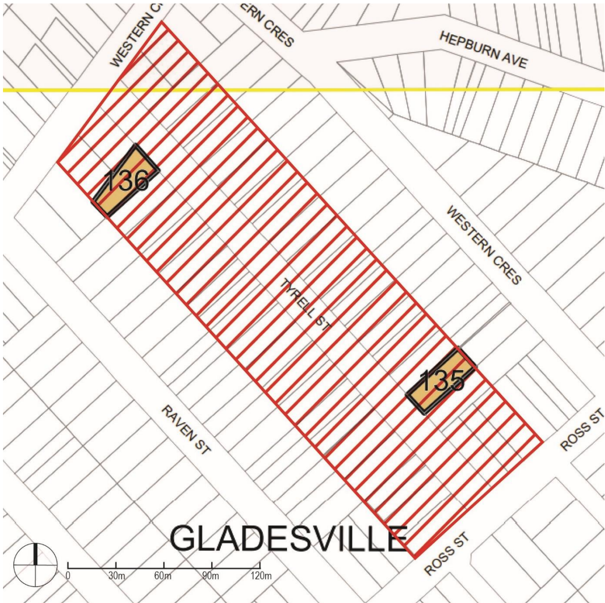
Figure 4.2.5 Ryde LEP Heritage Map indicating the draft Tyrell Street Heritage Conservation Area, Gladesville.