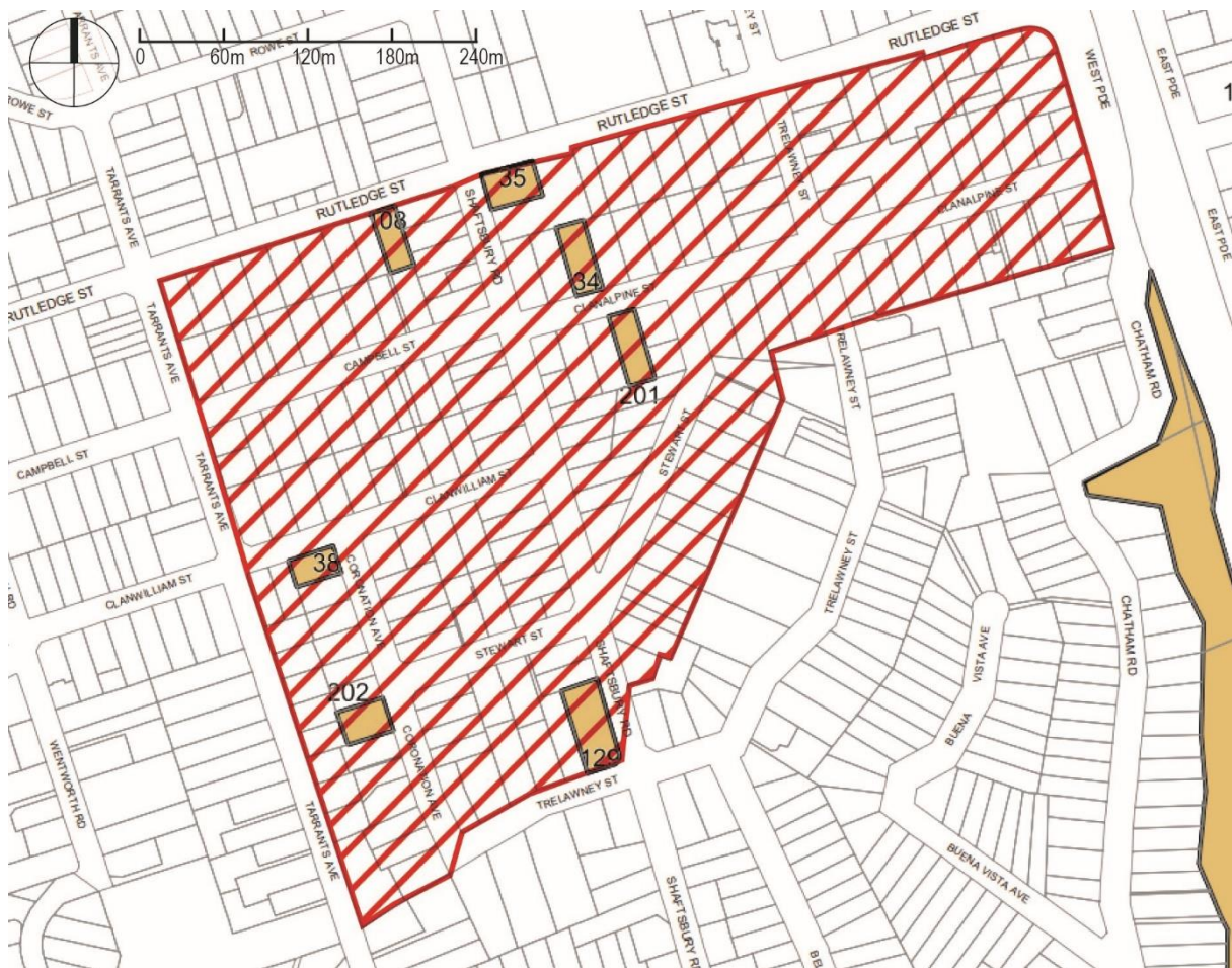
Figure 4.2.2 Ryde LEP Heritage Map indicating the draft Summerhayes Heritage Conservation Area, Eastwood.