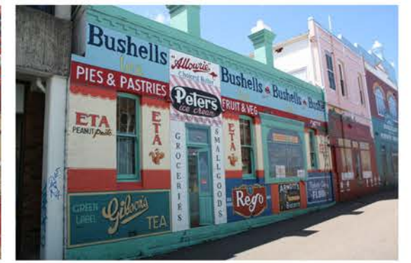
EXAMPLES OF MURALS - DURAL LANE, HORNSBY