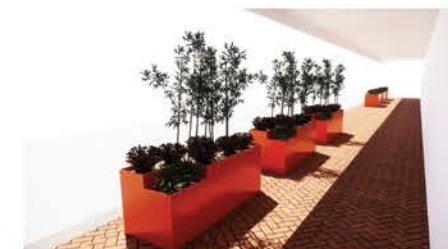
PLANTER BOX ONLY - OPTION 2