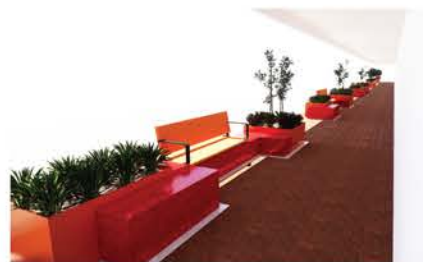
SEAT AND PLANTER OPTION 1a (TIMBER LOOK) - PERSPECTIVE