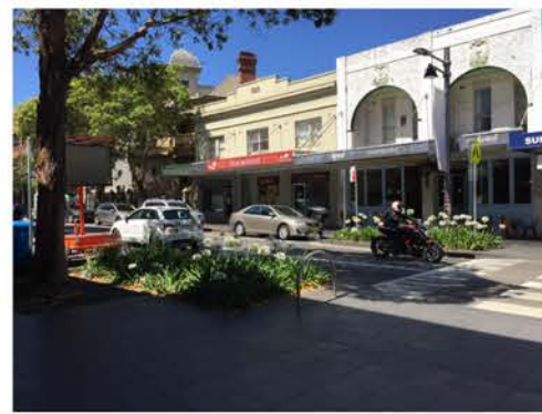
EXAMPLES OF PLANTED BLISTER KERBS AT PEDESTRIAN CROSSINGS