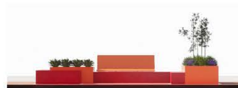
SEAT AND PLANTER OPTION 2 - ELEVATION