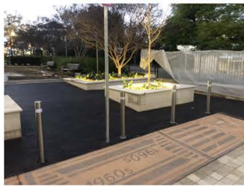
EXAMPLE OF INTERPRETATION PANEL IN GROUND PLANE - COULTER STREET, RYDE