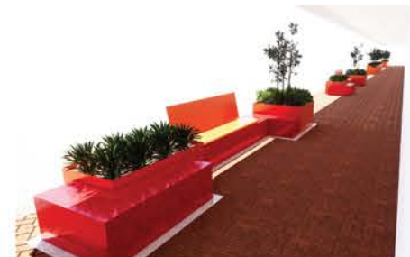
SEAT AND PLANTER OPTION 2 - PERSPECTIVE