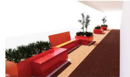
SEAT AND PLANTER OPTION 1a (POWDER COATED STAINLESS STEEL) - PERSPECTIVE