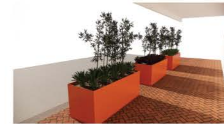
PLANTER BOX ONLY - OPTION 1