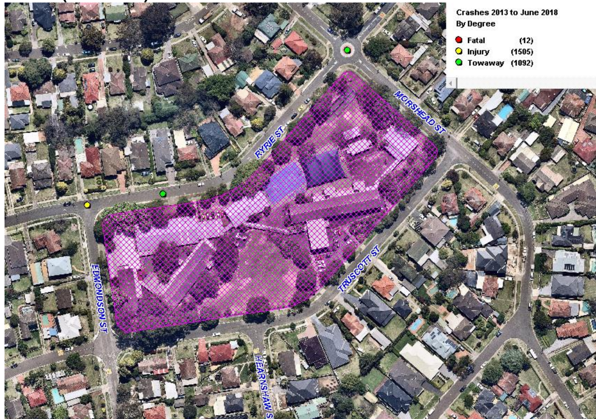
Figure 3: Crash Analysis – 2013 to June 2018