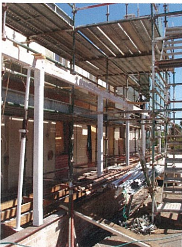
Construction of new rear verandah in progress