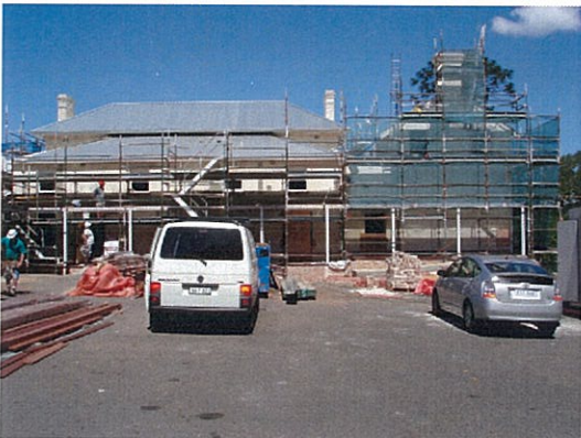
Roof works in Central Wing completed