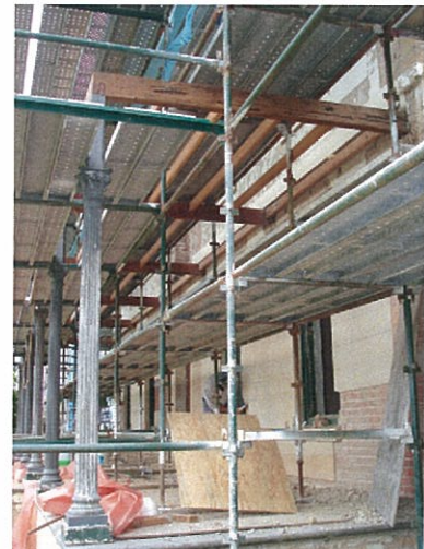
Re-construction of balcony structure in progress