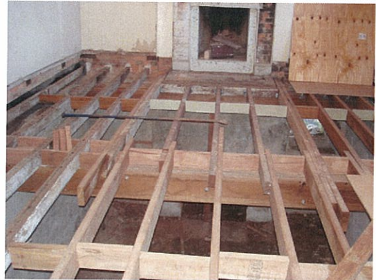
Replacement of floor structure completed