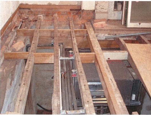
Installation of electrical services completed