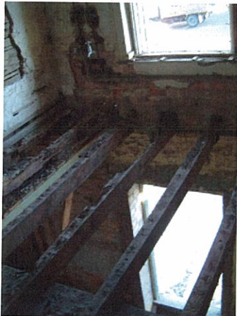
Demolition works in progress