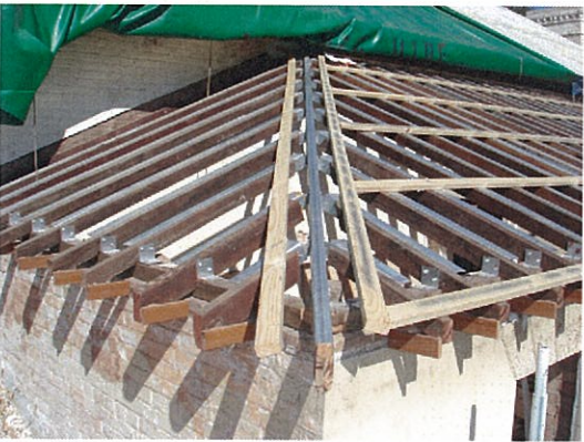
Replacement of roof structure in progress