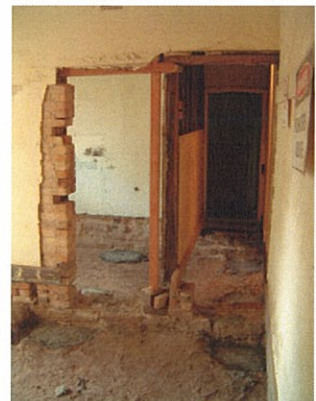
Demolition works completed