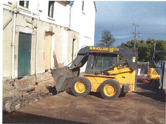
Construction of footings in progress