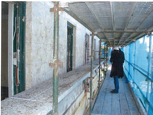
Removal of existing paint in progress