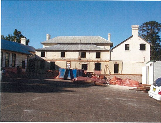
Demolition of rear verandah completed