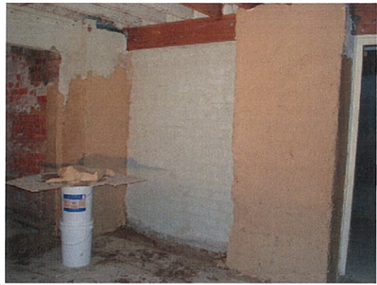
Desalination of stone walls in progress