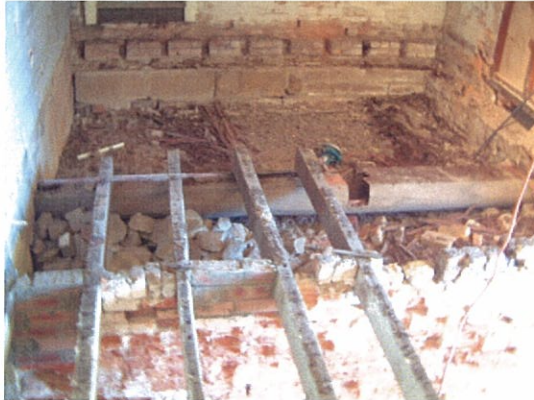
Demolition works in progress