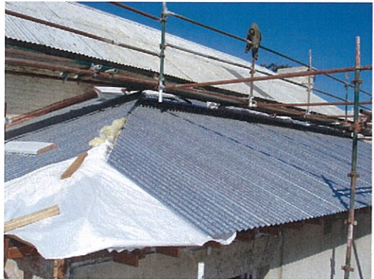
Replacement of roofing cover in progress