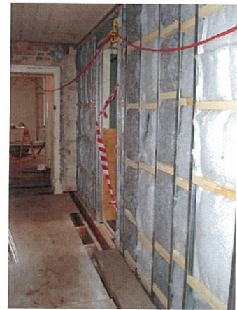
New partition walls in progress