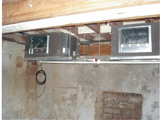
Installation of air-conditioning units completed