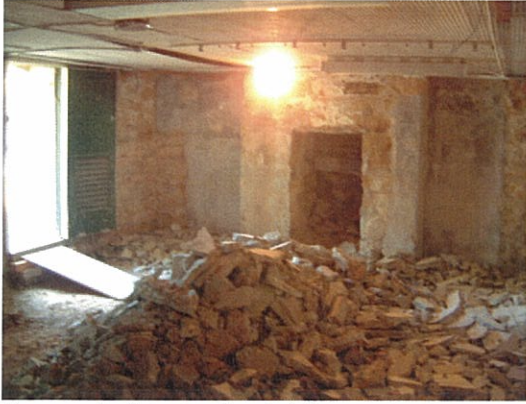
Removal of concrete slab in progress