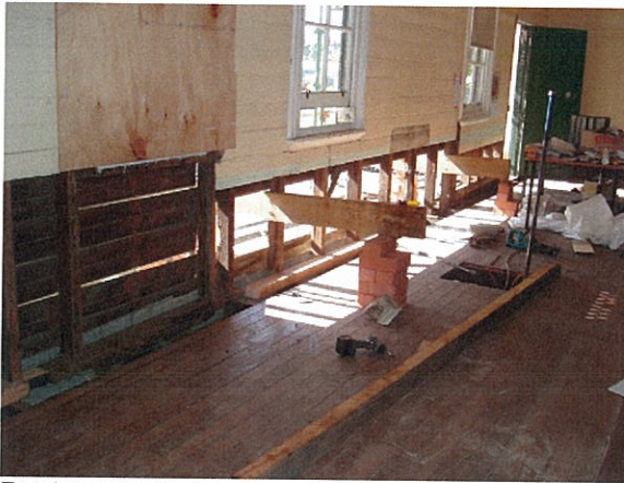
Replacement of wall panels in progress