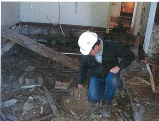
Archaeological investigation in progress