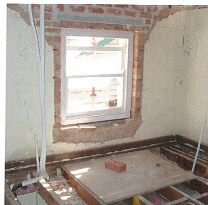
Walls repair works and new windows completed