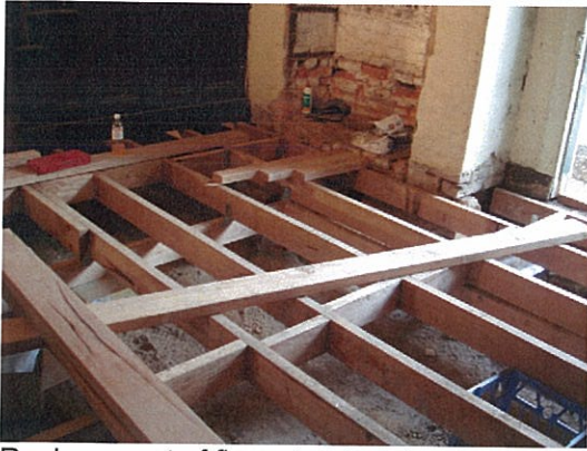
Replacement of floor structure in progress