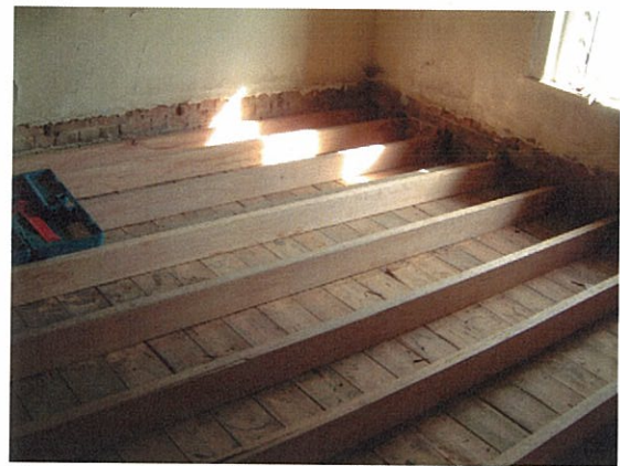
Replacement of floor structure completed