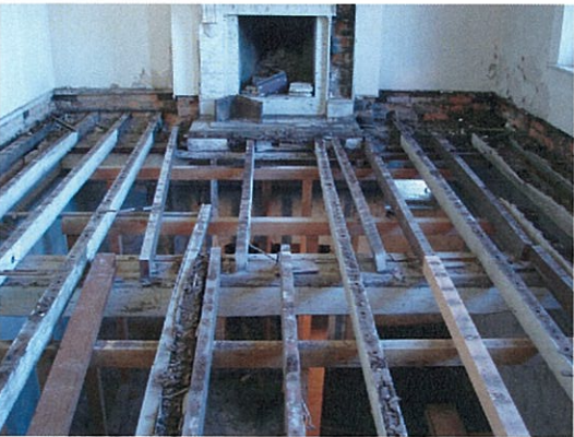
Demolition works in progress