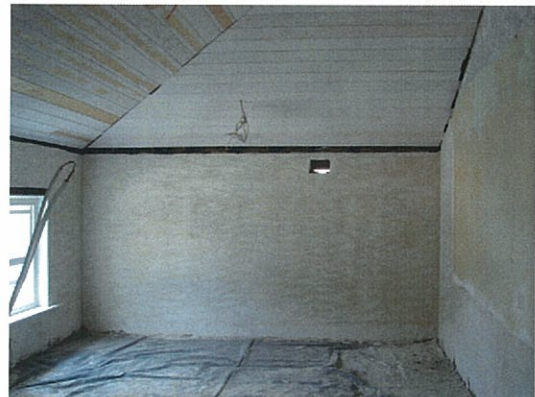
Replacement of wall plaster and ceilings completed