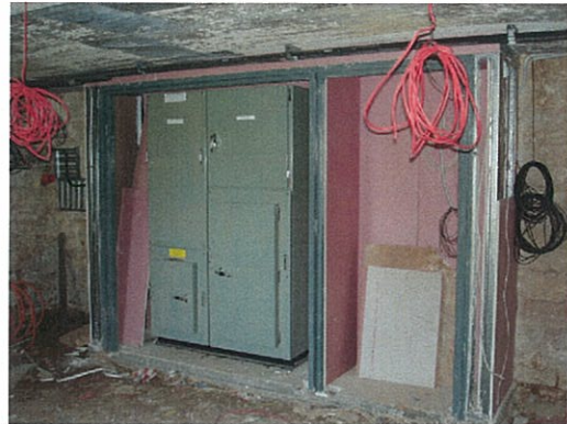
Installation of electrical switchboard completed