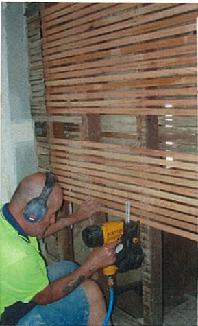
Repair of lath and plaster walls in progress