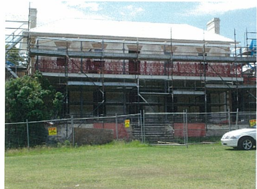
External wall repair and plastering completed