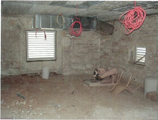
Installation of windows completed