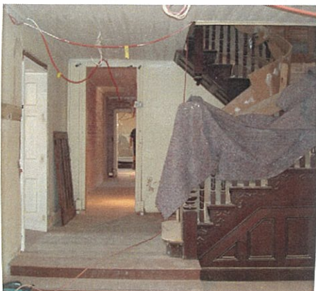
Installation of new timber flooring completed