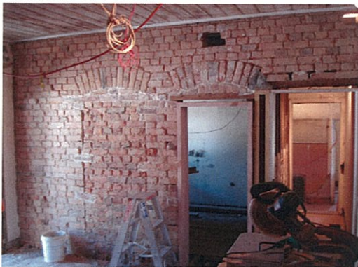
Repair works to brick walls completed