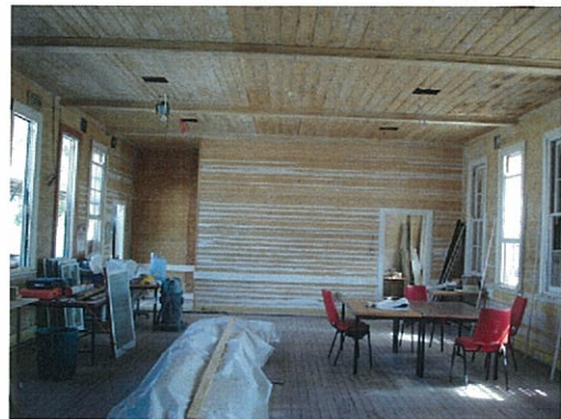
Stripping of old paint on walls and ceiling completed