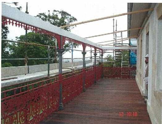
Front balcony floor and balustrade completed