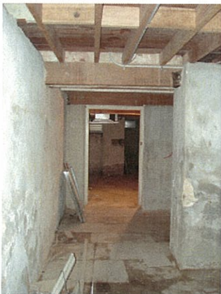
Desalination of walls completed