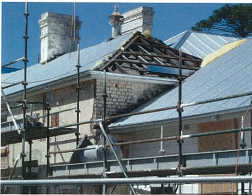
Installation of roofing sheets nearing completion