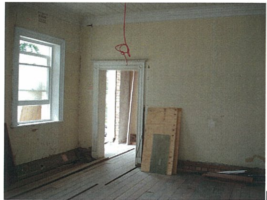
Installation of new timber flooring completed