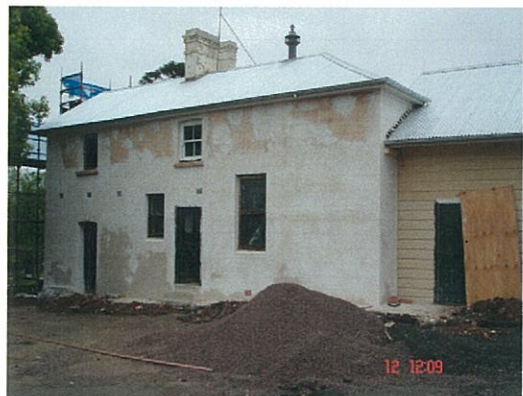
External wall repair and plastering completed