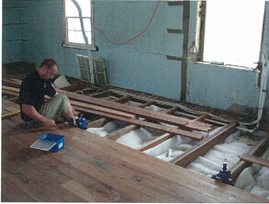
Installation of new timber flooring in progress