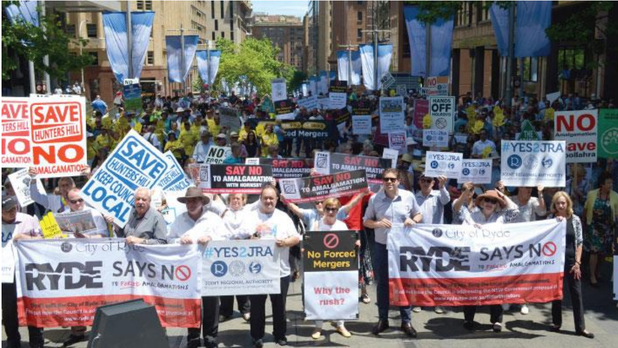
Rally Group - 18 November 2015

The deadline for the farcical and shameful '50 word' submissions to the State Government which will be used to determine the future of our Councils were due yesterday.