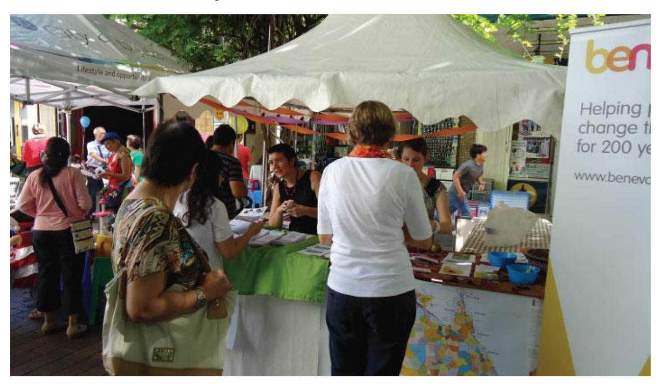
Community Information Expo 2015

The City of Ryde Council is once again joining forces with Relationships Australia's Ryde Community Hub to present the annual Community Information Expo on Thursday 24 March at Eastwood Plaza, 9.30am – 12.30pm.