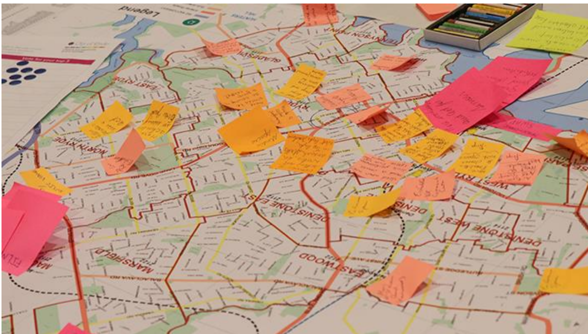
Social wellbeing, arts and cultural assets in focus

We discuss strengths and challenges as well as an aspirational activity whereby participants develop a cover story headline for Ryde in five years' time. Workshop participants have described the experience as "enlightening" and "rather inspiring".