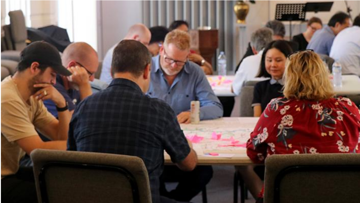
Workshop participants identify existing social wellbeing, arts and cultural assets

The workshops are all very interactive and include lots of activities. We do an exercise where, in small groups, using post it notes and big maps, participants identify what the City of Ryde's assets for social wellbeing and arts and culture are (eg facilities, services, community groups, open space, activities and events). As part of this exercise we also map what is missing or would be beneficial to the community.