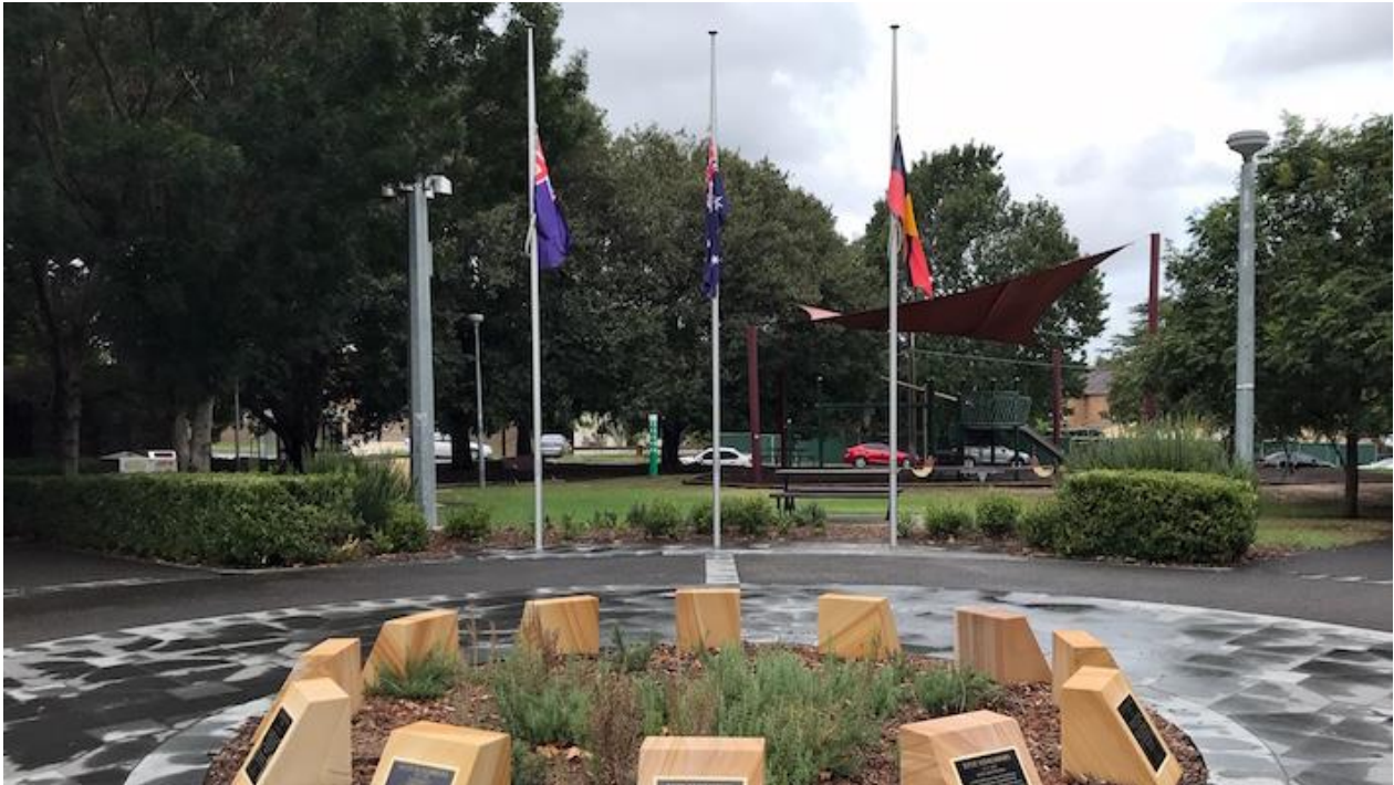
Flags at half-mast at Anzac Park, West Ryde