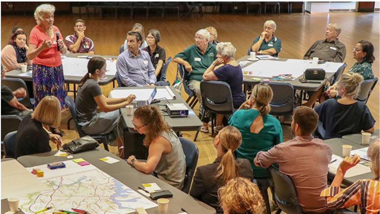
A workshop participant shares her views from the floor

We will also be running some general community workshops, a multicultural workshop and a workshop with key school staff.