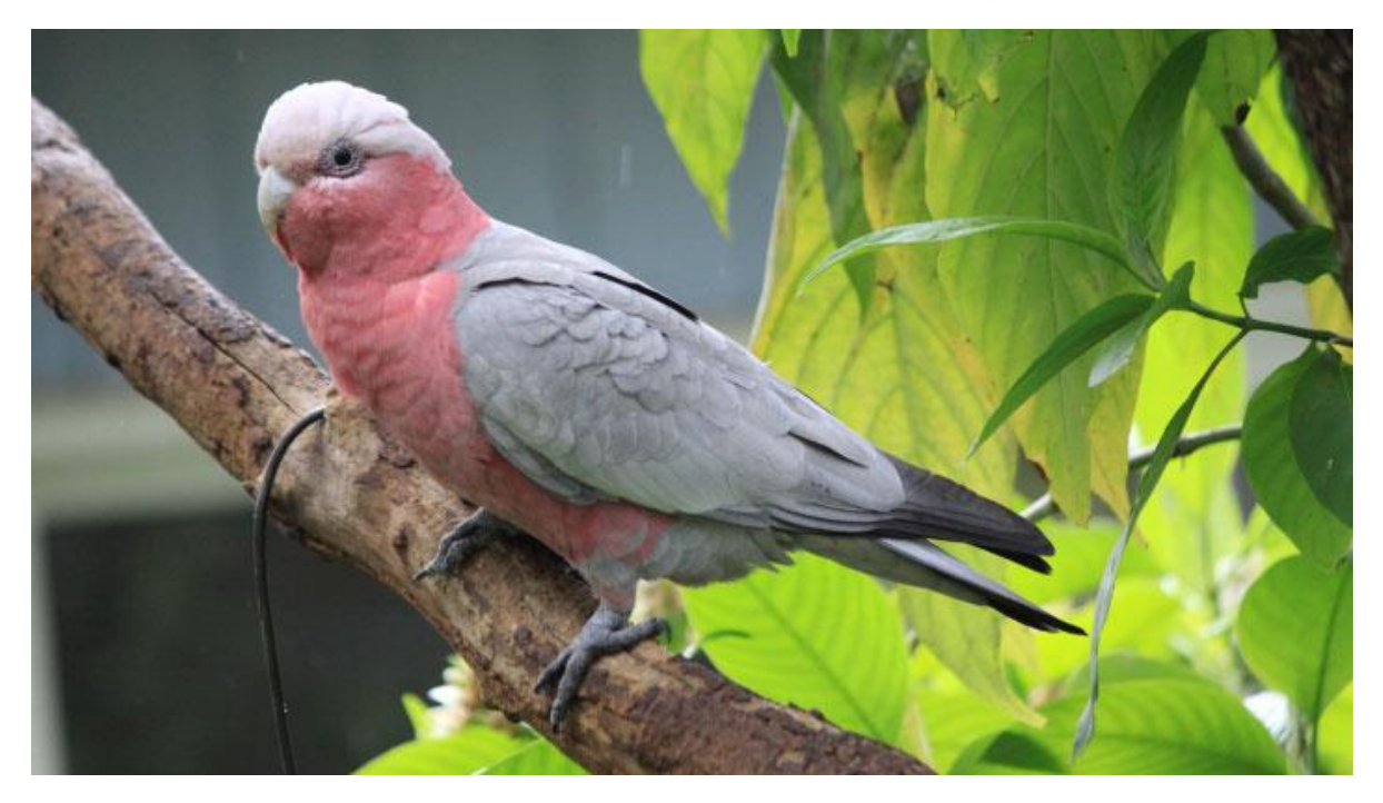
Galah Andrew runs <u>Zest for Birds</u> birdwatching tours.

The Lane Cove National Park sits along the whole northern boundary of the City of Ryde and is home to a great many birds including many which you are unlikely to see in your backyard. The forest here contains White-headed Pigeons, White-throated Treecreepers, Spotted Pardalotes (small colourful birds which breed in tunnels in the ground) and the elegant Black-faced Cuckoo-shrike which is neither a cuckoo nor a shrike. With luck you might see the impressive Powerful Owl sitting in its daytime roost with the remains of last night's dinner, a possum, in its talons.