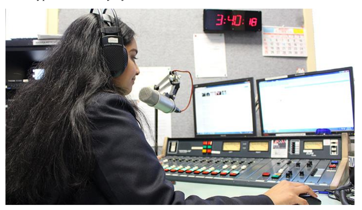
Getting ready to go on air at 2RRR

I have volunteered at the <u>Granny Smith Festival</u> and I also sit on <u>Ryde Youth Council</u>, which is a representative voice for young people in the City of Ryde, and I volunteer at Youth Of Sydney, which is a photojournal project that aims to debunk myths and stereotypes about today's youth.