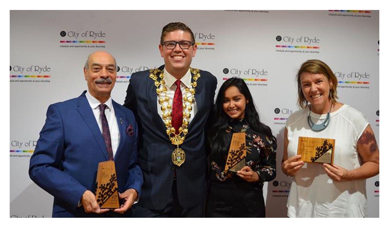
At the 2019 Ryde Citizen of the Year Awards