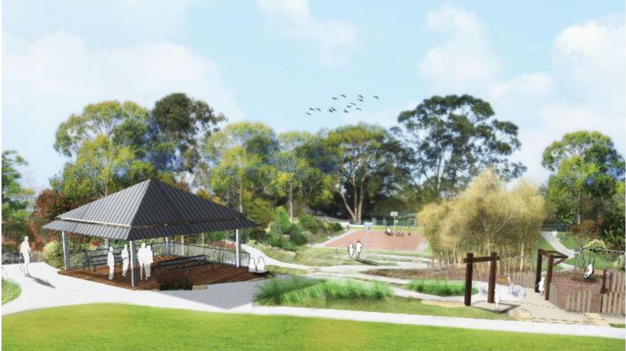
Concept design image for Kings Park

Construction is underway to complete a major upgrade to Kings Park in East Denistone, which once completed will provide the community with a brand new state-of-the-art open space in the City of Ryde.