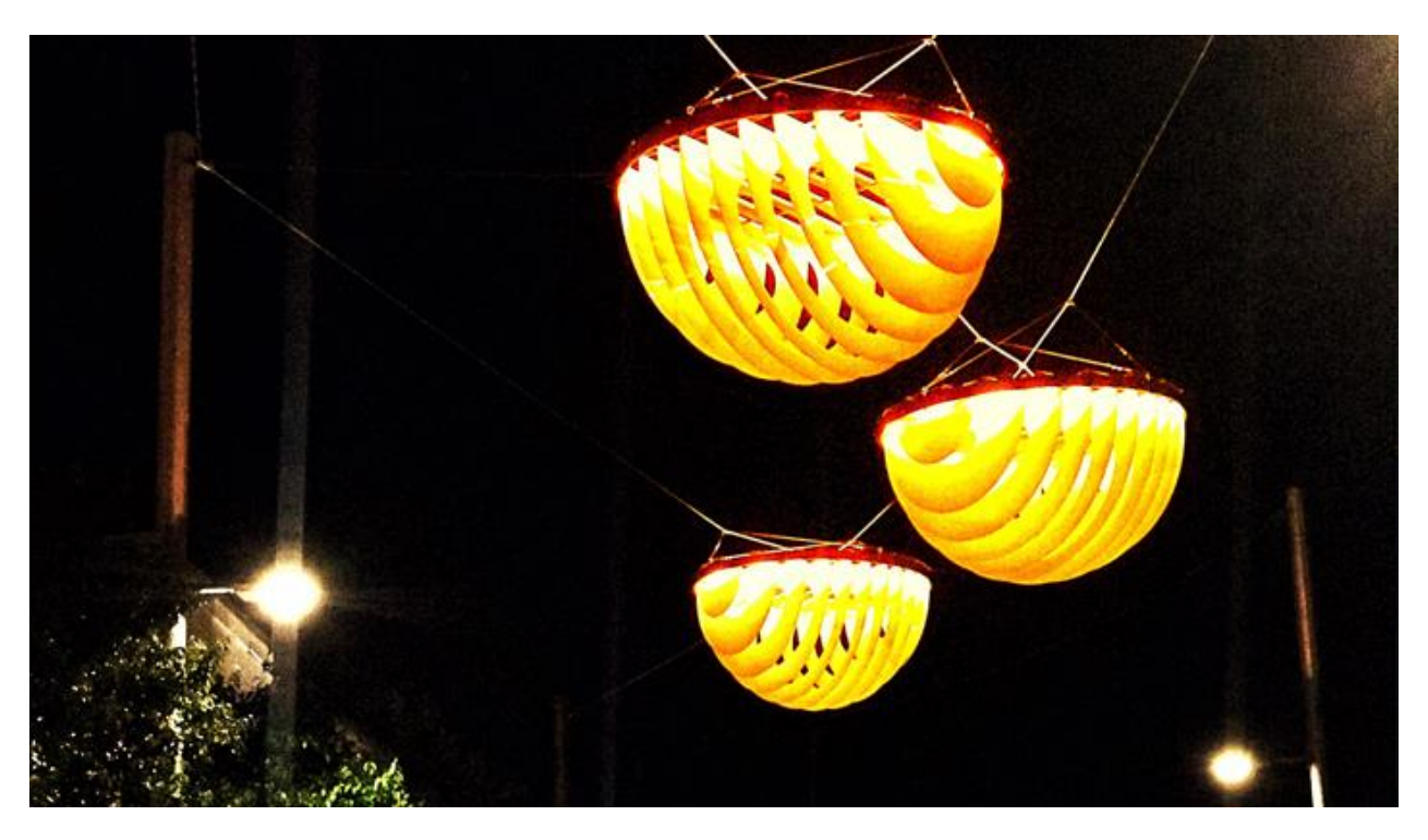
March is Endometriosis Awareness Month!

This year, Australia is getting its glow on. Endometriosis Australia's new campaign Endo Enlightened encourages landmarks and businesses to envelop themselves in bright yellow lights as a demonstration of hope and support and to raise awareness of the disease that affects 1 in 9 women and those who identify as gender diverse. The City of Ryde is lighting up Coulter Place Gladesville in bright yellow lights as part of this campaign from 9-31 March 2021. Individuals have the opportunity to show their support as well by shining a yellow light from their homes or wherever they are.