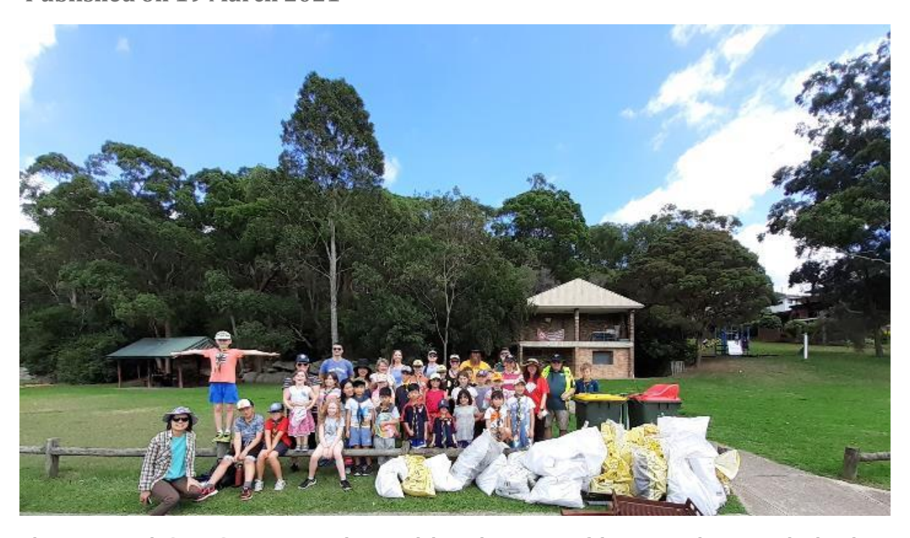
The 1st East Ryde Scout Group - pictured at Magdala Park - was one of the groups who got involved in this year's Clean Up Australia Day

This year's Clean Up Australia Day activities in the City of Ryde attracted 34 participating groups including businesses, community groups, schools and youth organisations.