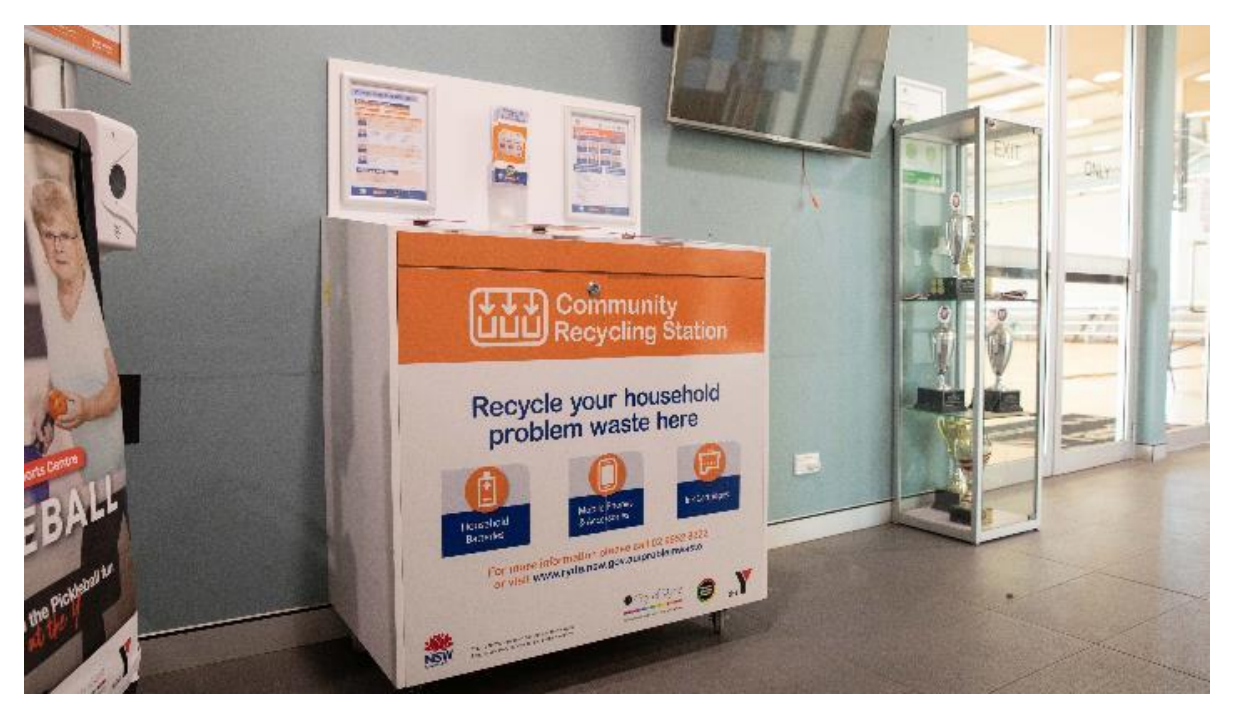
The new Problem Waste Drop-Off Station at YMCA Community Sports Centre

The City of Ryde has installed new Problem Waste Drop-Off Station at YMCA Community Sports Centre, ELS Hall Park, North Ryde.