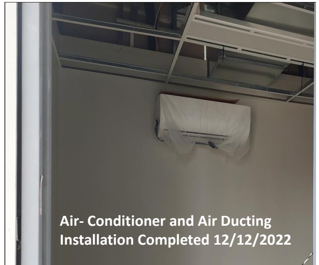
Air- Conditioner and Air Ducting Installation Completed 12/12/2022