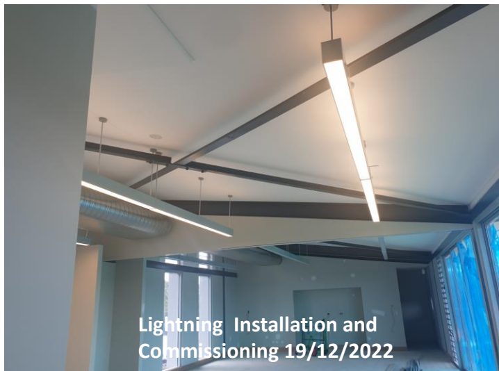
Lightning Installation and Commissioning 19/12/2022