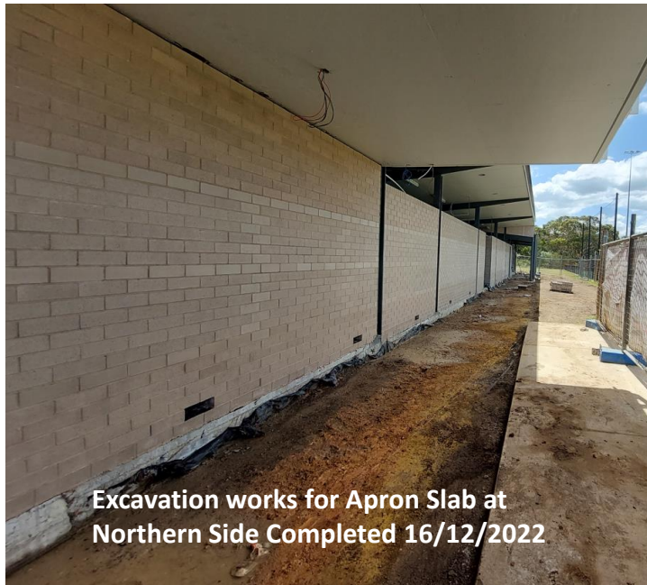
Excavation works for Apron Slab at Northern Side Completed 16/12/2022