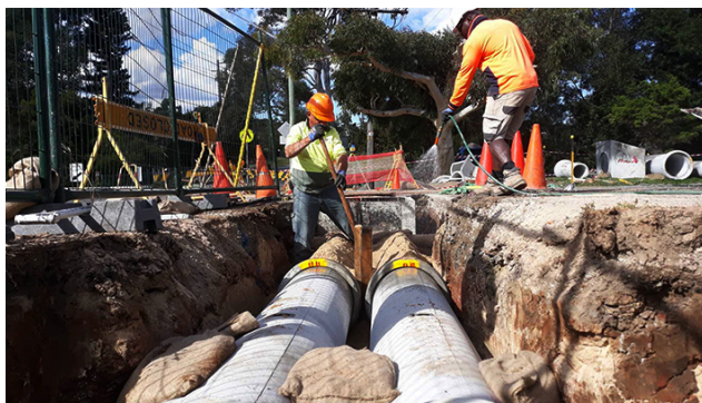
Example stormwater drainage works in progress

The works will take place along Monash Road between Buffalo Road and Higginbotham Road/Thompson Street (see map on reverse side).