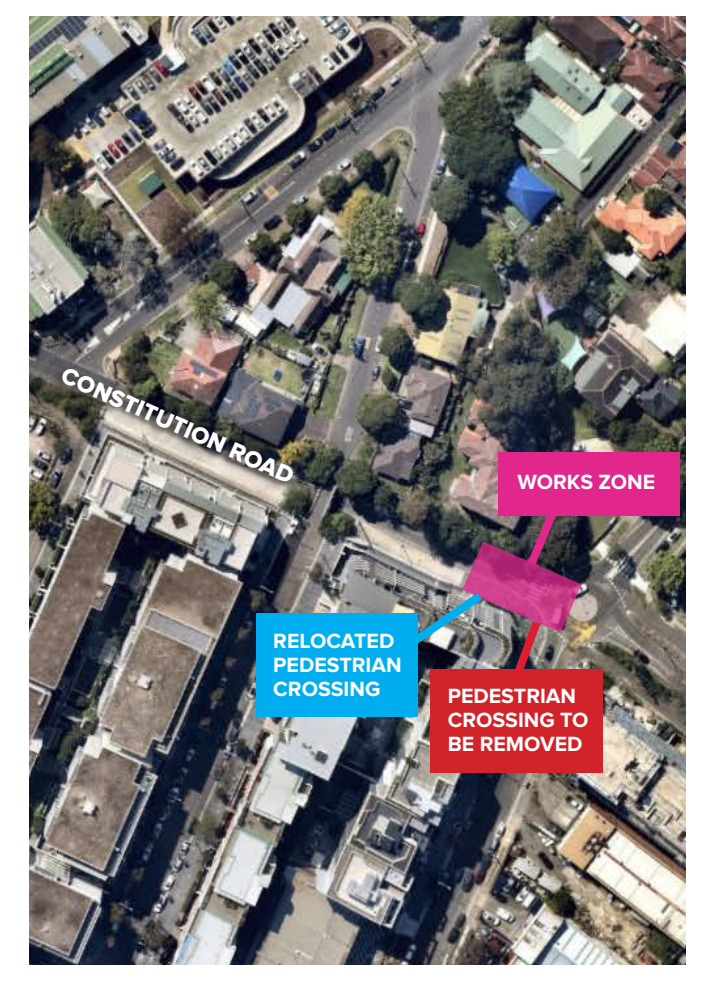
Stage 2 works