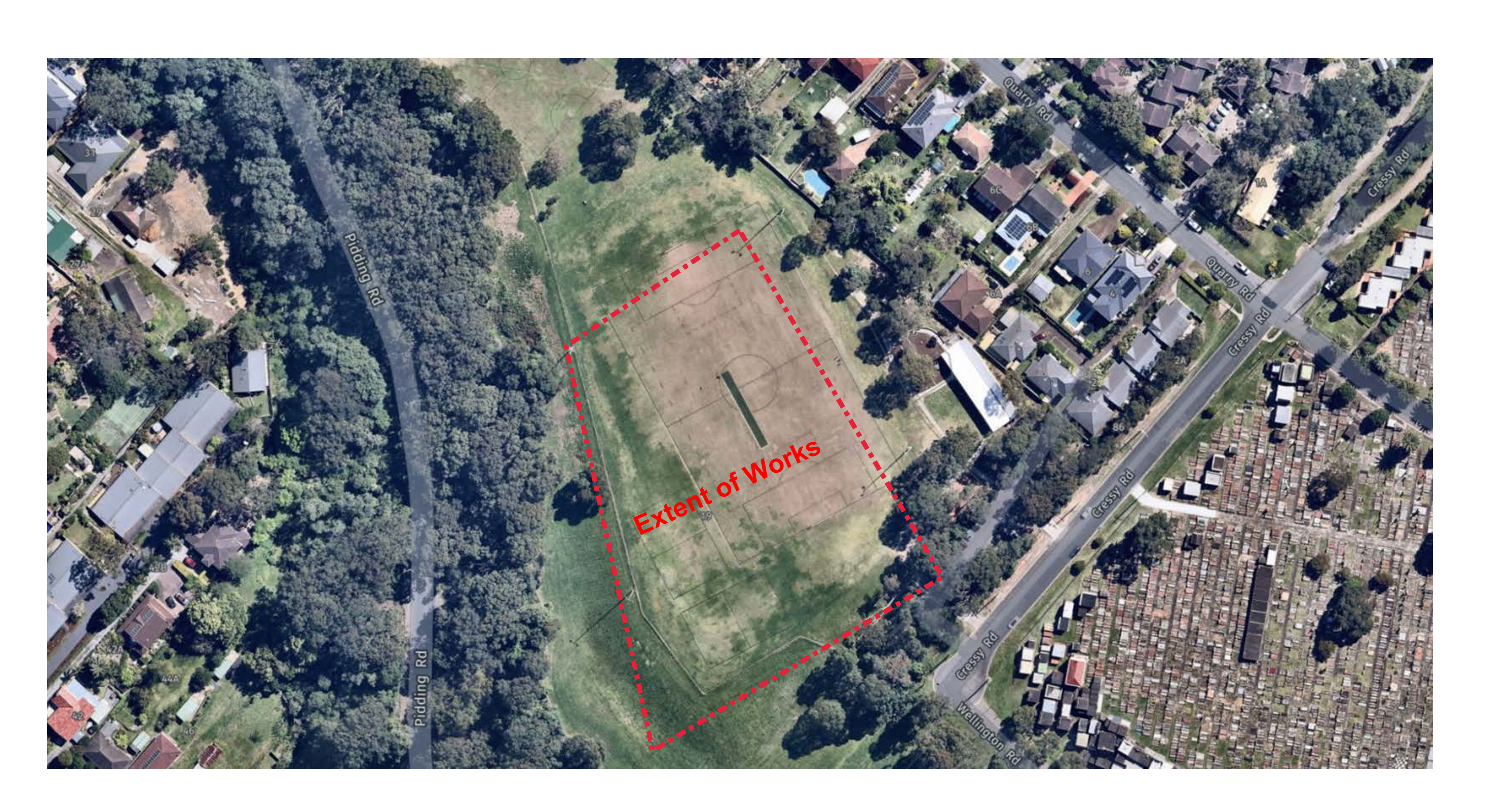
Main field will be fenced off for the duration of the works

For more information please go to: www.ryde.nsw.gov.au/projects