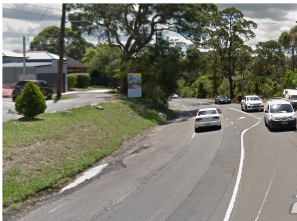
Site photo : Pittwater Rd North of High St