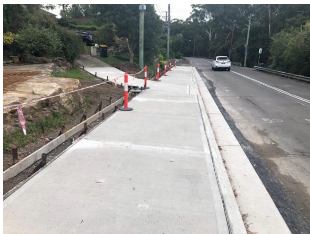
Site photo : Pittwater Rd

For further information please do not hesitate to contact: