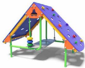
A CLIMBING CUBBY