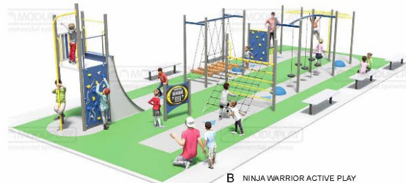
B NINJA WARRIOR ACTIVE PLAY