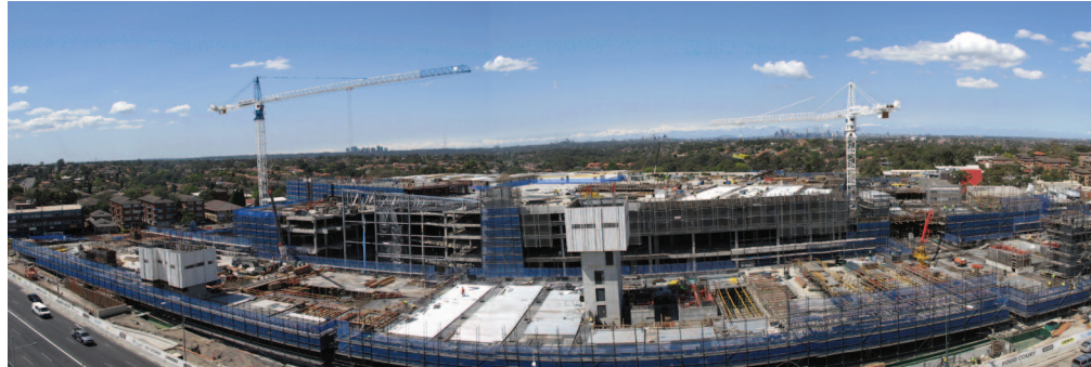
Top Ryde City shopping centre development

The Mayor's role, as Chair of Council and the civic leader of Council, is crucial to effective relationships within the administration and to good governance.