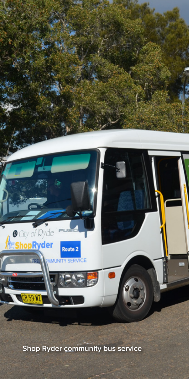
Shop Ryder community bus service