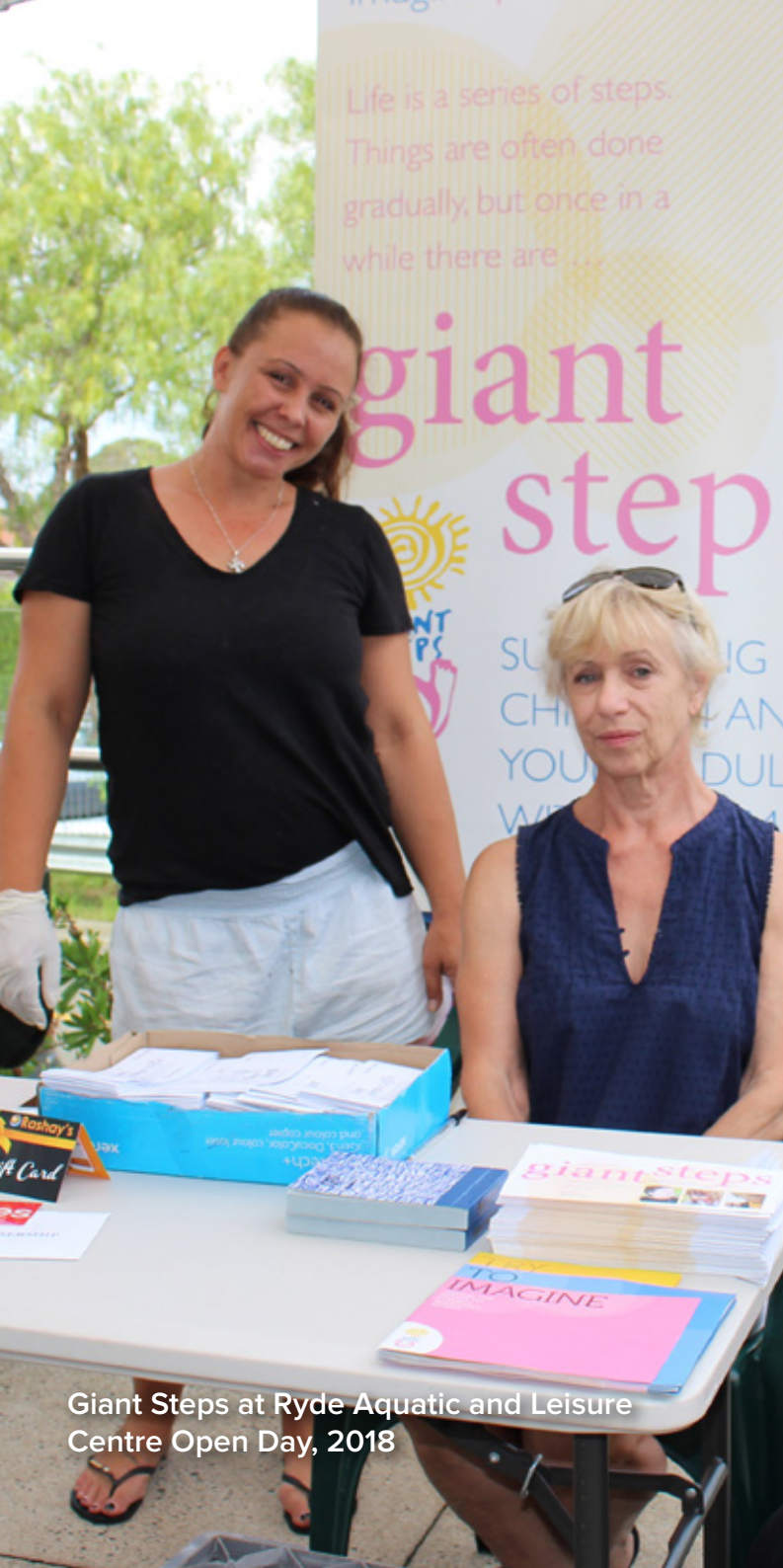
Giant Steps at Ryde Aquatic and Leisure Centre Open Day, 2018