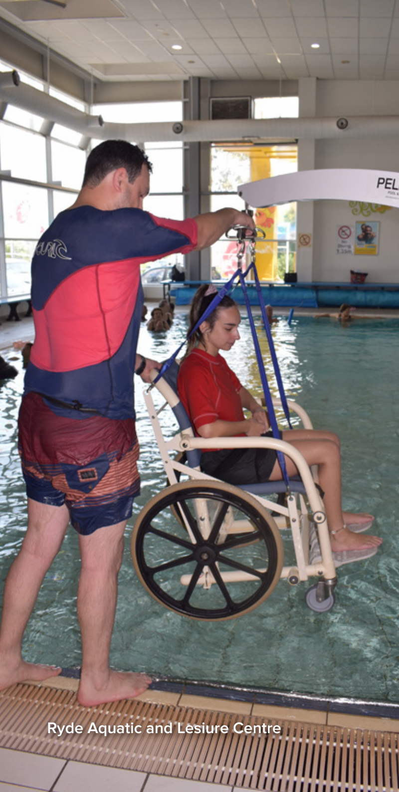
Ryde Aquatic and Leisure Centre