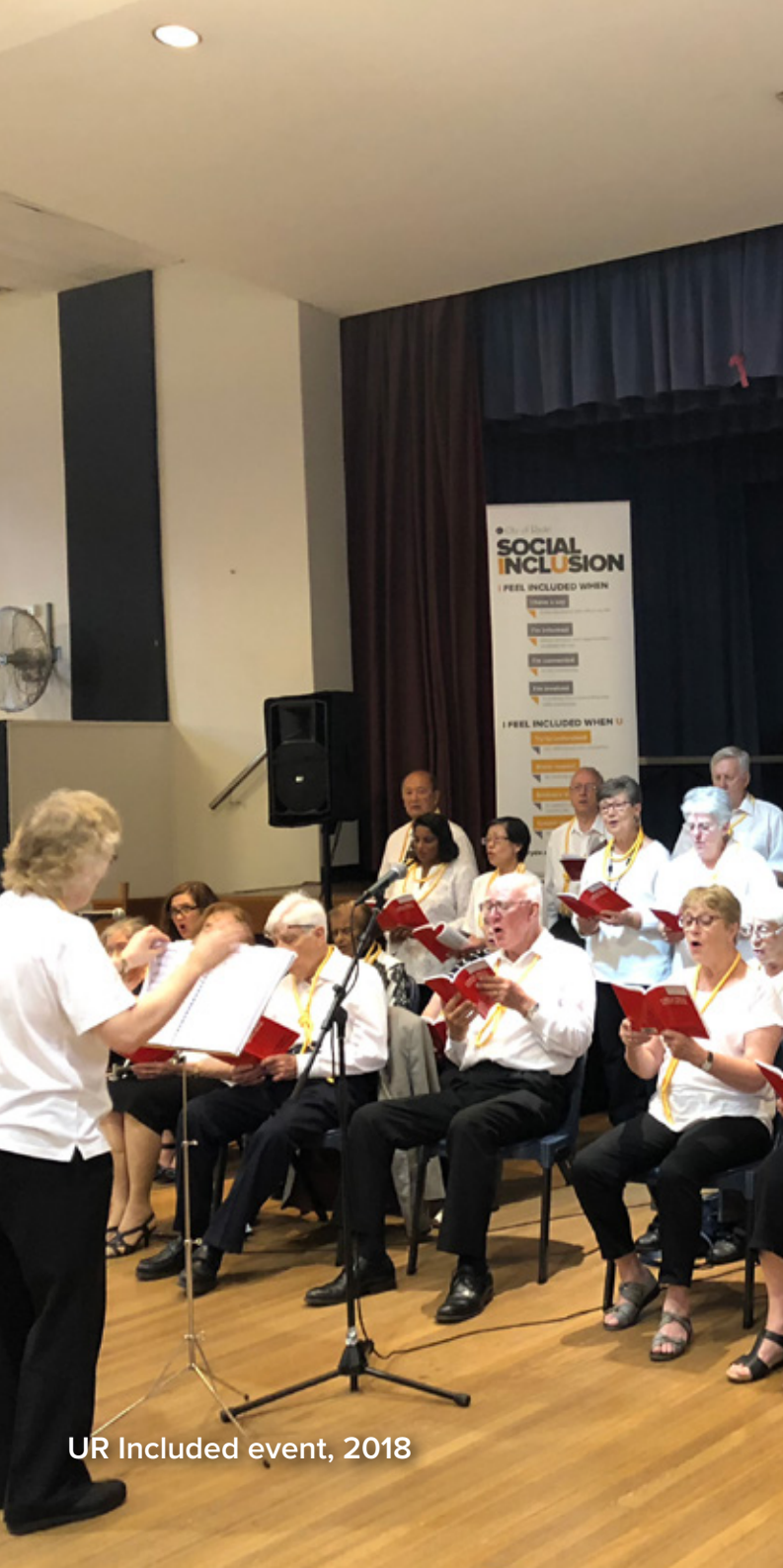
UR Included event, 2018