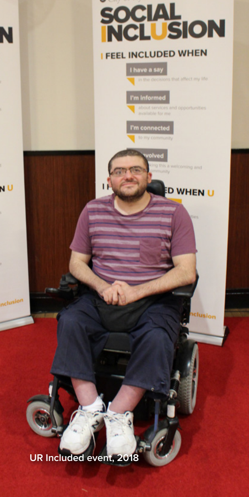
UR Inclusion event, 2018