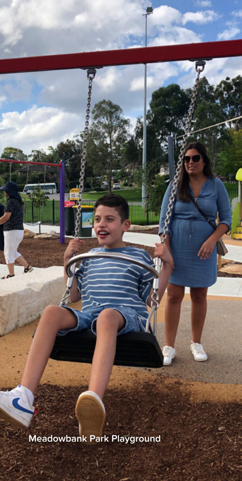
Meadowbank Park Playground