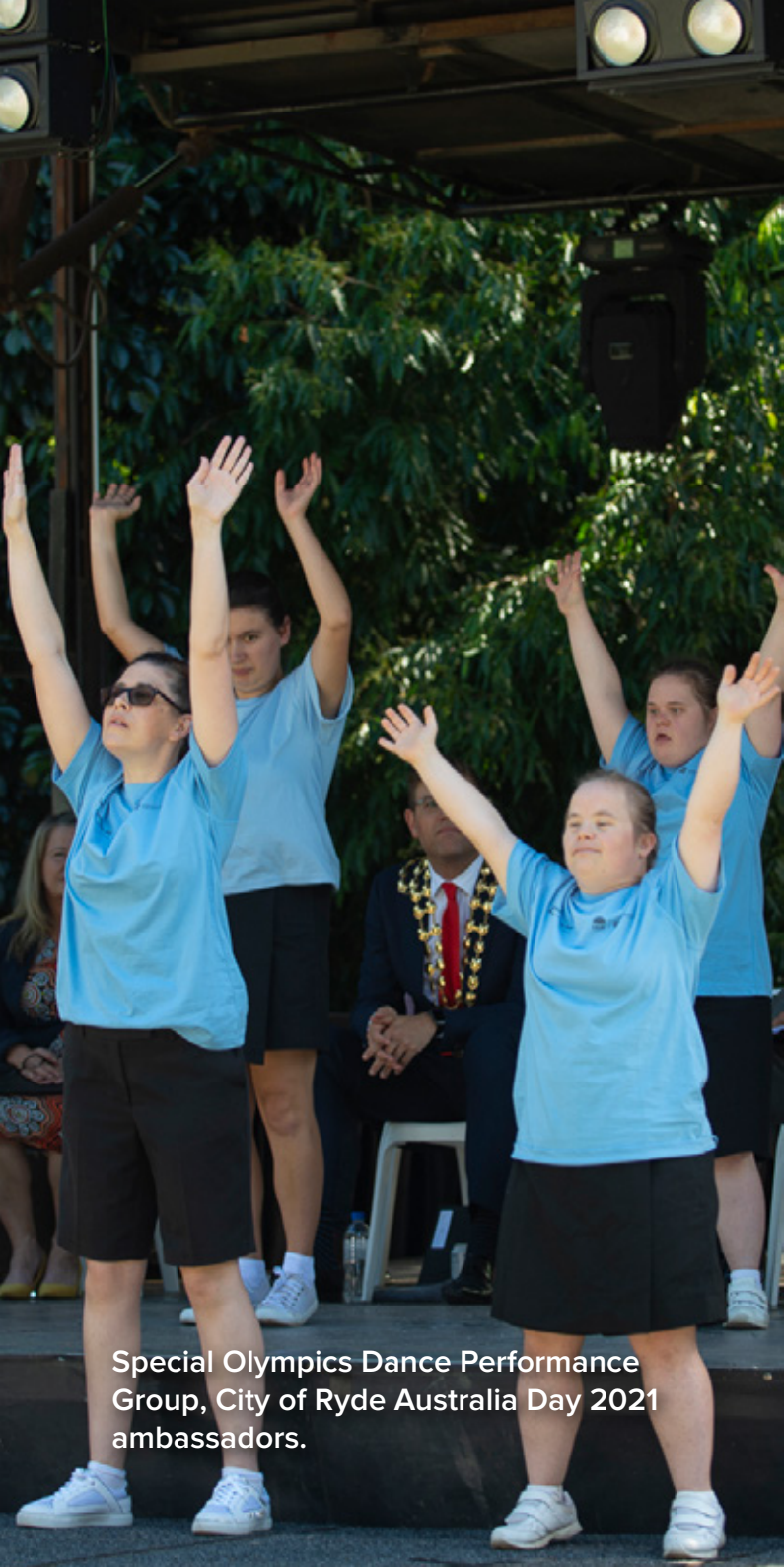
Special Olympics Dance Performance Group, City of Ryde Australia Day 2021 ambassadors.