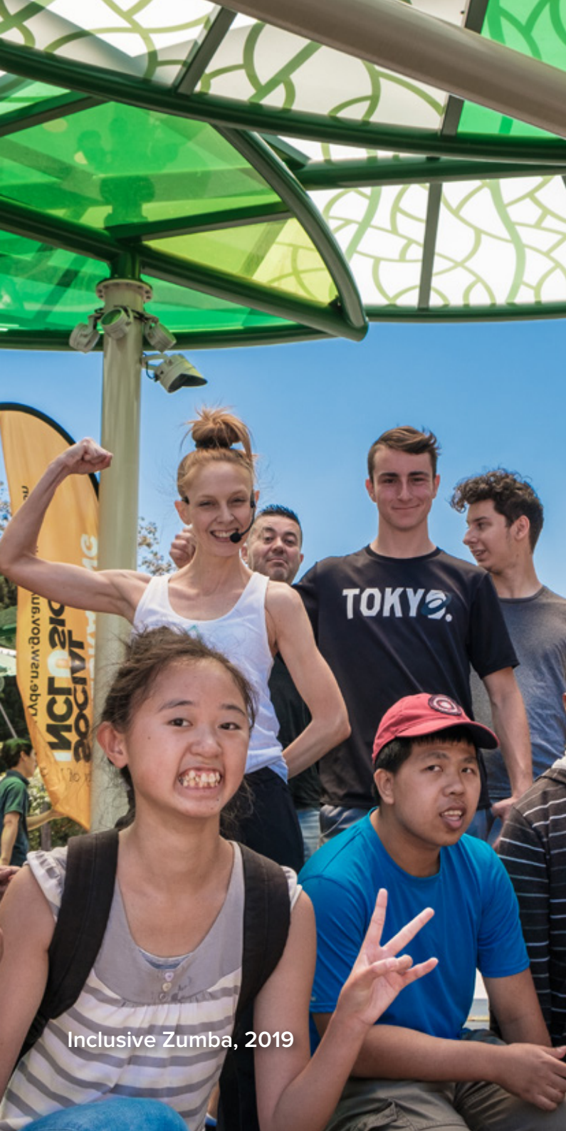
Inclusive Zumba, 2019