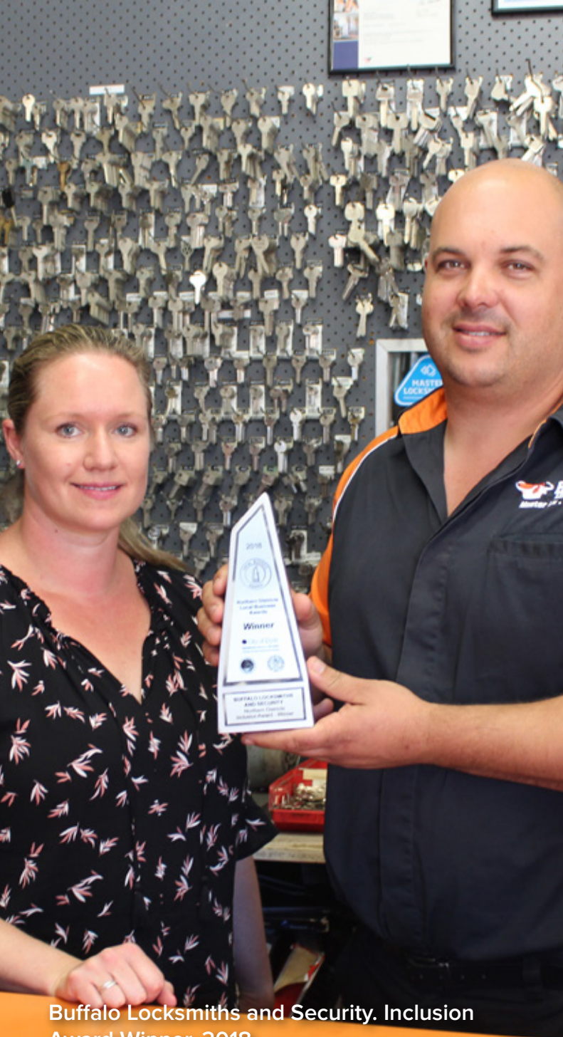
Buffalo Locksmiths and Security. Inclusion Award Winner, 2018