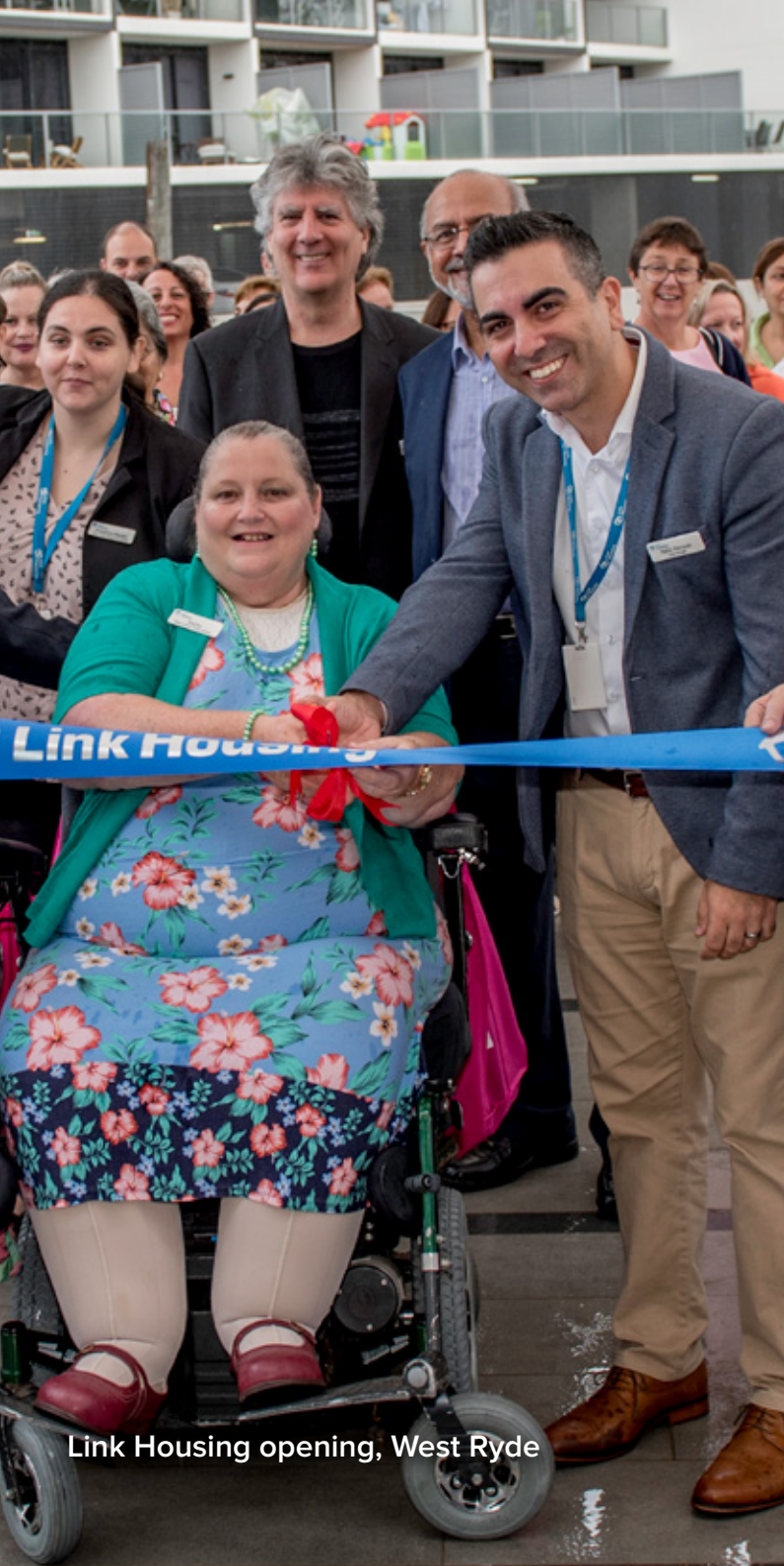
Link Housing opening, West Ryde