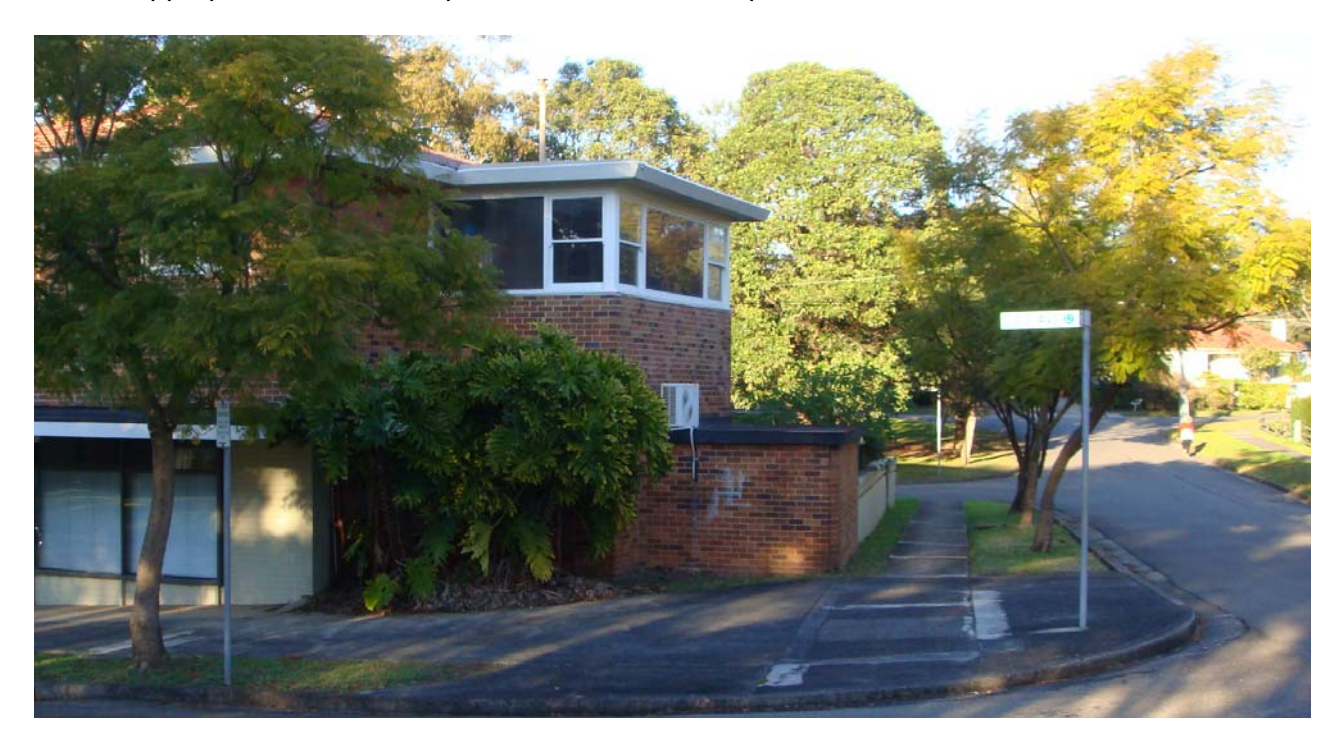
Existing Street Trees - Doig Avenue

Tree planting in Small and Neighbourhood centres should reflect the predominant existing street tree planting. Where there is no predominant existing street tree planting or the existing species are not appropriate Council will provide an alternative species.