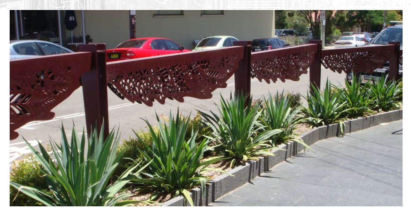
Integrated Public Art – Fiveways