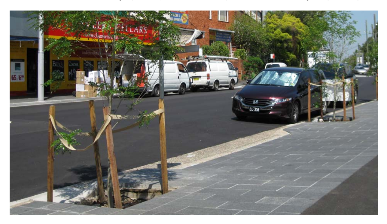
Street trees integrating WUSD principles - Meadowbank

Water Sensitive Urban Design (WSUD) should be incorporated into the design of public spaces.