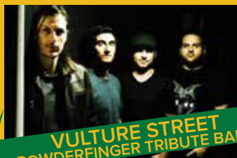
VULTURE STREET POWDERFINGER TRIBUTE BAND