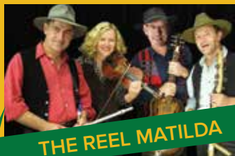
THE REEL MATILDA

Plus KIDS RIDES, FOOD TRUCKS and FIREWORKS