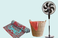
Large household items