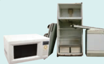
Household appliances and metals