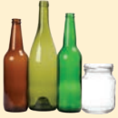
Glass bottles and jars