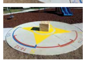
All photos above: Halcyon Park, Gladesville