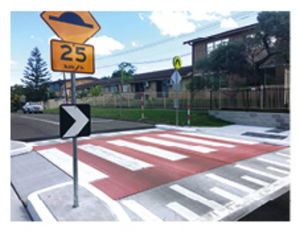
The crossing will be similar to the one built on Oxford Street Gladesville (above)