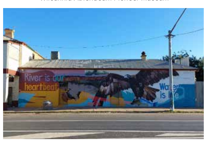
Street art on the high street of Wilcannia