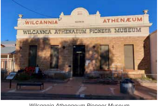
Wilcannia Athenaeum Pioneer Museum