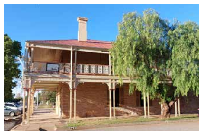
Central Darling Shire Council Chambers