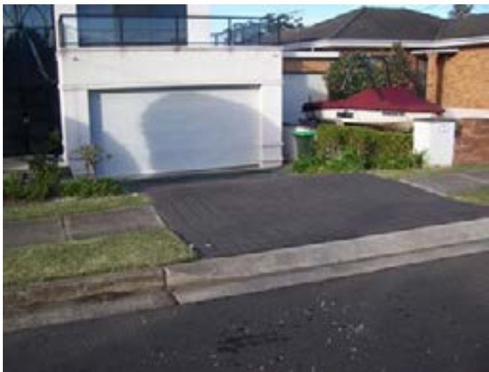
Non standard (Complex) Driveway examples