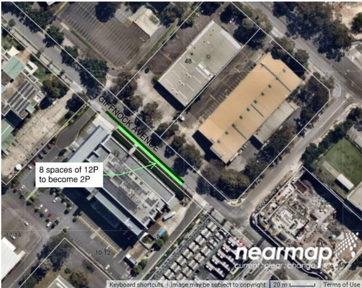
Figure 2: Giffnock Avenue – Recommendation B