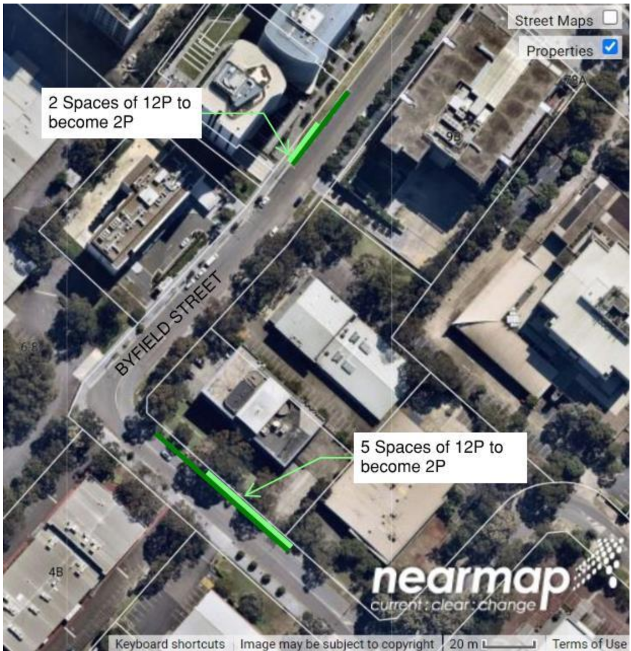
Figure 3: Byfield Street – Recommendation C