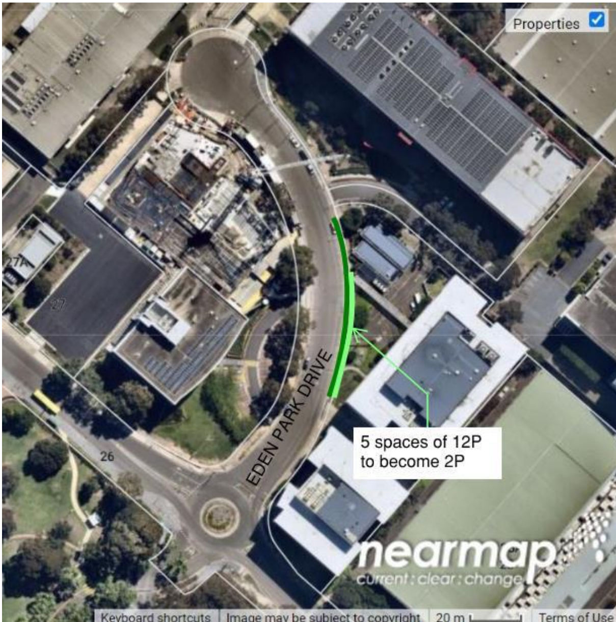
Figure 3: Eden Park Drive – Recommendation A