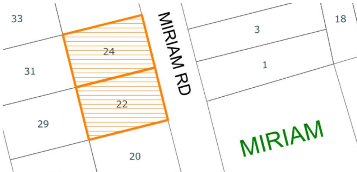
Figure 2: Distribution Map

Given the negligible impact, the properties shown in the map below were only notified.