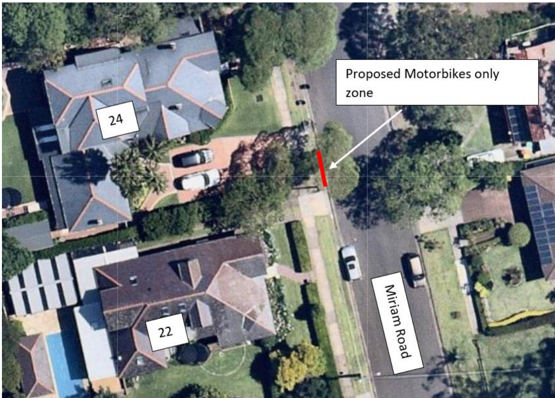
Figure 2: Proposed Motorbikes Only Zone