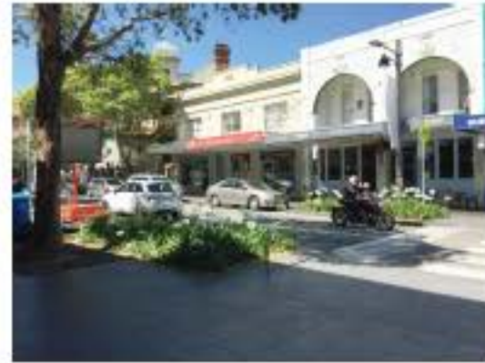
EXAMPLES OF PLANTED BLUSTER KERBS AT PEDESTRIAN CROSSINGS