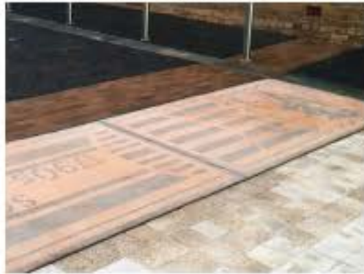
EXAMPLE OF GROUND PLANE INTERPRETATION PANEL - COULTER STREET, GLADESVILLES