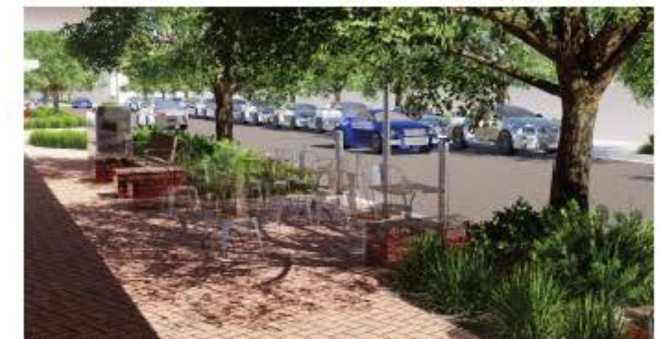
OUTDOOR DINING AREA WITH STREET FURNITURE AND MOVABLE TABLES AND CHAIRS