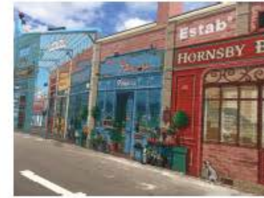
EXAMPLES OF MURALS - DURAL LANE, HORNSBY