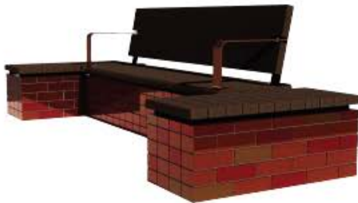
PROPOSED FEATURE SEATING IN CONTEXT - PERSPECTIVE