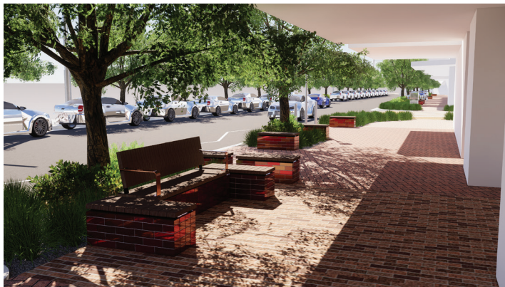
Above: Rendered impression, may be subject to change.

For further information please do not hesitate to contact: